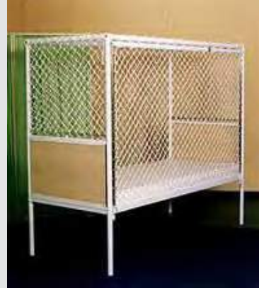
Above: A net bed promoted by the Czech based company, “laboratory and medical equipment opting service.”

Following the adoption of Commission Implementing Regulation (EU) No 775/2014 in July 2014, a range of goods was added to Annex II of EC Regulation 1236/2005 including: