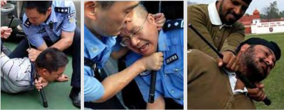
Above: Images of ESP training of police officers in the use the baton in a neck-hold position. Training was conducted in the Democratic Republic of Congo. [date unknown]