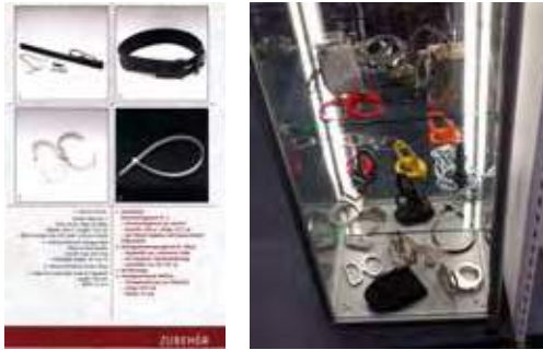
Left: “ Detainee/Prisoner Control Pliers ” from Clemen and Jung catalogue and Right: on display on Clemen and Jung stall at IWA 2015 security exhibition held in Nuremberg

On 17 April 2015 Amnesty International and Omega wrote to Clemen & Jung informing them of the forthcoming report and requesting further information on their products and activities. On 22 April 2015 the Clemen & Jung website was updated. Changes to the website included the transfer of “ Detainee/Prisoner Control Pliers ” to the “ history and retro-section ” of the website designed for products intended for “ collectors and law enforcement museums. ”