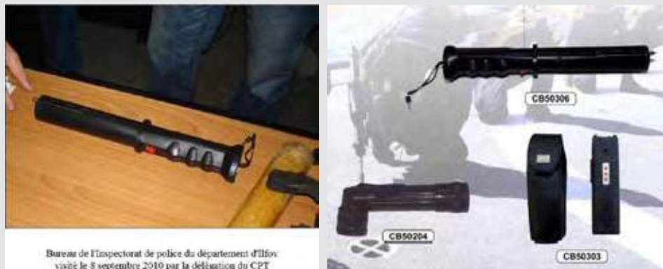
Left: image of direct contact electric shock weapon photographed by the CPT delegation at the Police Inspectorate Ilfov Department on 8 September 2011; Right: image of visually similar, if not identical electric shock baton taken from promotion material distributed by China Best Industrial, at the Eurosatory 2014 arms and security exhibition.

In its 2011 report, the CPT delegation highlighted its concerns regarding the alleged infliction of electric shocks with a direct contact electric shock weapon upon two people who had been held at the Police Inspectorate Ilfov Department in August 2010. On visiting the interrogation room indicated by the two victims, the delegation observed the presence of objects the victims had described precisely (including an electric shock baton). The electric shock baton photographed by the CPT delegation appears to be visually similar, if not identical, to electric shock batons manufactured by Chinese companies, most notably the CB50306 which has been widely promoted by China Best Industrial, including at the Eurosatory 2014 arms and security exhibition. 147 Consequently it appears that such electric shock weapons have been previously imported into Romania, directly or indirectly, from China.