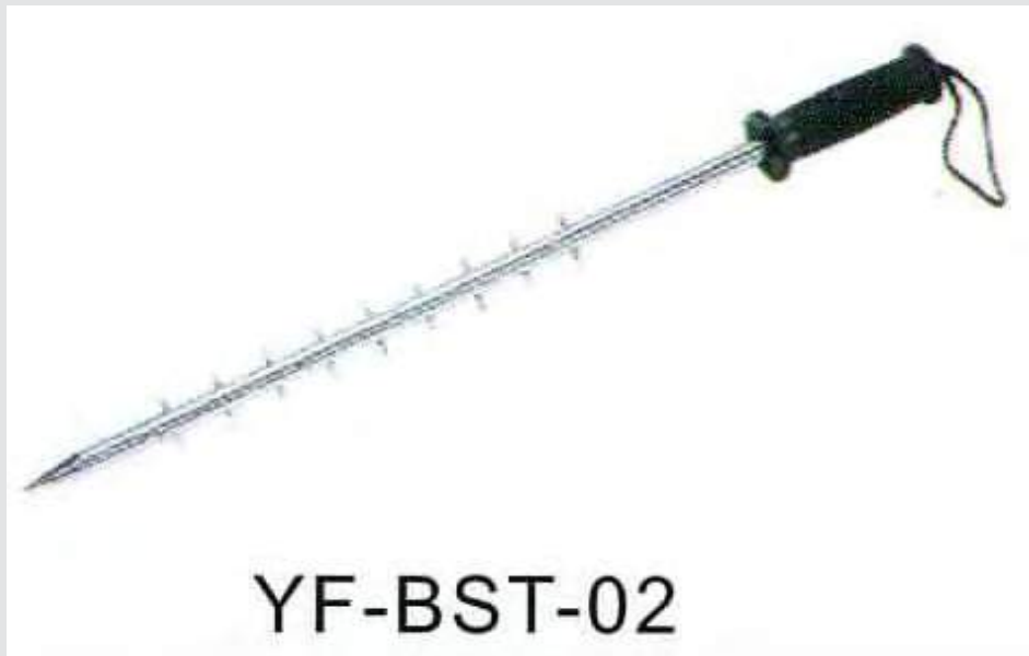
Above: Spiked baton from Yuanfar International catalogue, Left: legcuffs, Centre: “electronic shackles”, taken from Jiangsu Wuwei Police Equipment Manufacturing Co.Ltd catalogue, and Right: legfettters taken from Jiangsu Anhua Police Equipment Manufacturing Co. Ltd catalogue, all distributed at Milipol 2013.

Although “weighted leg restraints” were added to the Regulation prohibited list after this exhibition, in July 2014; the promotion at Milipol 2013 (and previously at Eurosatory 2012) of such equipment, which is clearly inappropriate for use by law enforcement officials, is of concern.