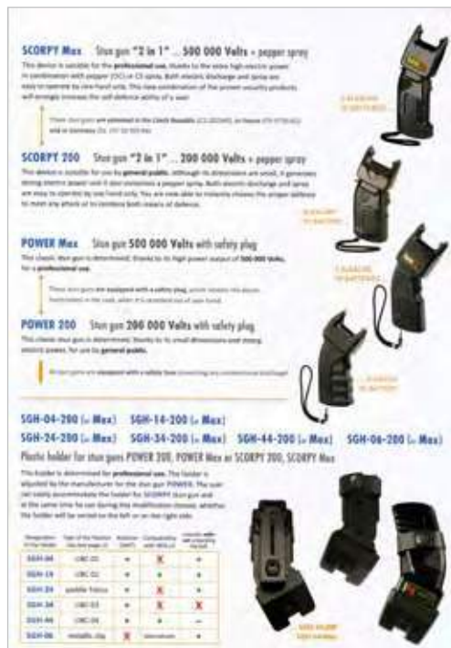
Below: "Scorpy Max" and "Power Max" taken from the catalogue of Eurosecurity Products [Czech Republic] distributed at the IWA 2015 trade event in Germany.