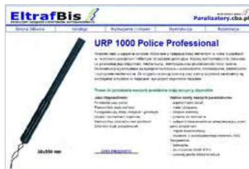
Above: Electric shock baton promoted by Eltraf Bis [Poland].