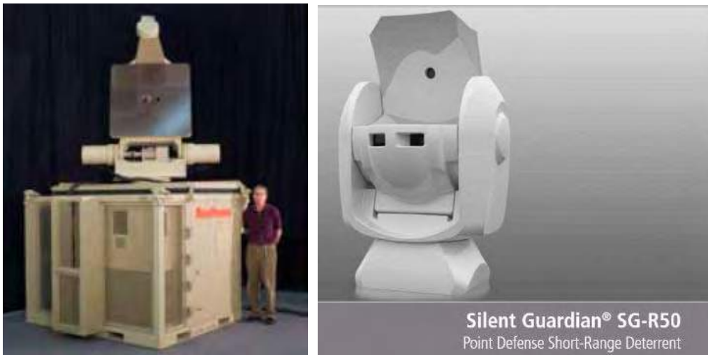
Left: Silent Guardian, and Right the Silent Guardian SG-R50 taken from Raytheon publications

In 2010, it was reported that a smaller version of the ADS, manufactured by Raytheon and referred to as a "7½ foot tall Assault Intervention Device," was due to be installed in a dormitory at Pitchess Detention Center in Los Angeles County as part of a trial by the National Institute of Justice (NIJ). 229 In February 2011, it was announced that the NIJ would review the trial further before