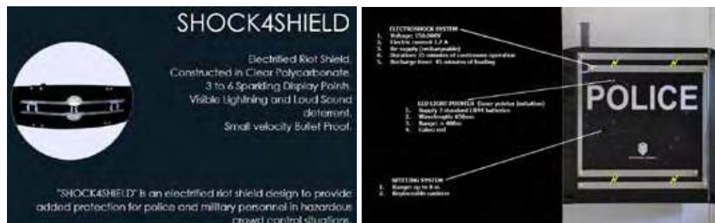
Left: Shock4shield manufactured and promoted by ISRP [Portugal]; Right: the Spitting Cobra electroshock shield with pepper spray promoted by GER d.o.o. [Slovenia].

Amnesty International and Omega recognise that there is an existing trade in certain direct contact electric shock devices (particularly electric shock stun guns marketed to individuals for self-defence). However research by the two organisations has uncovered EU companies promoting direct contact electric shock devices to the law enforcement or military communities (as summarised in the table below).