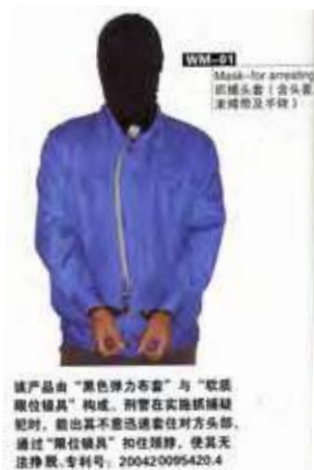
Above: “Mask for arresting”: image taken from promotional material distributed by Chinese company Jiangsu Anhua Police Equipment Manufacturing Co. Ltd at Milipol 2011, Paris, France.

A limited range of “niche” restraint devices for use by law enforcement officials have been marketed by European companies. For example the German Company, Clemen & Jung, has developed and promotes the “Detainee/Prisoner Control Pliers”. This device is intended to be used by an accompanying officer to hold and restrain a prisoner by their wrist and lead them or force them to move. The