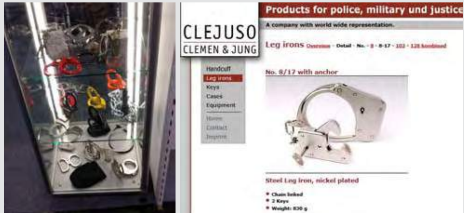
Left: Restraint devices on display on the Clemen & Jung stand at IWA 2015 trade event in Germany. Right: No 8/17 Steel Leg Iron with Anchor.

The German company Clemen & Jung, “Deliver their products to police, military, justice institutions, and correctional facilities worldwide.” 62 Among their product range is a handcuff described as the “No.17 heavy cuff with anchor” which weighs 1,055 grams 63 and appears to be designed for attachment to a fixed object. The company has also promoted a single “steel leg iron” weighing 830 grams. 64 This is described as “No. 8/17 with anchor” and also seems designed for attachment to a fixed object. 65 As neither the “No.17 heavy cuff” nor the “steel leg iron” have any linking chain between the restraint and the attachment device, the restrained individual would be severely restricted in their movements potentially adding to their discomfort. Until at least 19 April 2015, both products were advertised on the company’s website and in March 2015 a device visually similar to the Nr 8/17 leg iron with anchor was on display at the company’s stand at the IWA trade event. 66