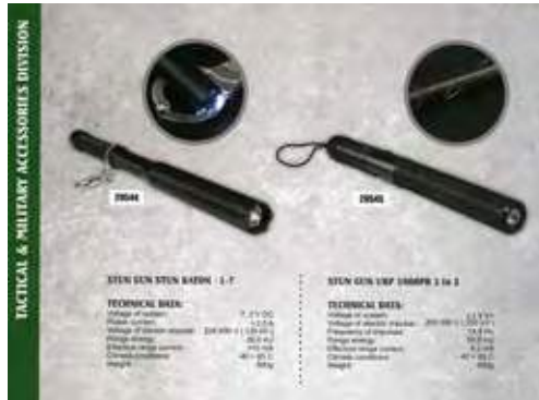
Left: Electric shock shields, Above: electric shock batons promoted by HPE Holsters [Poland]. Note that this advertising material includes images of the application of electroshock weapons directly upon handcuffs.