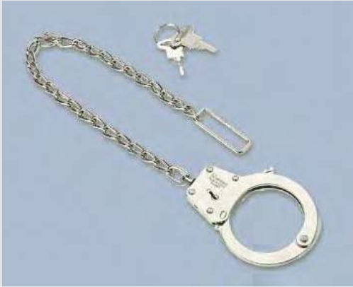
Above: The Ralkem 9923 single cuff, manufactured by the Czech Company Alfa Proj.

The Czech company ALFA - PROJ spol. s r.o, manufactures and promotes a range of small arms and restraint equipment. 71 Among the products advertised on the company website as of 12 May 2015 are a range of