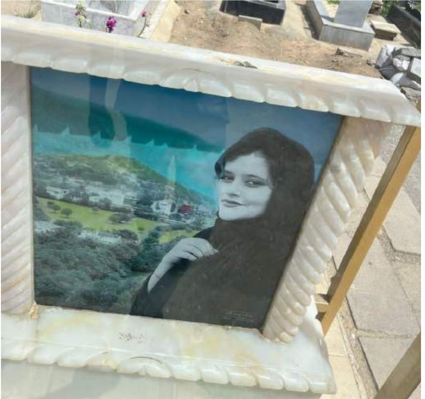
A picture of Mahsa/Zhina Amini's grave after it was vandalised for the second time, on 23 May 2023, this time with the crown on the headstone broken off and removed.