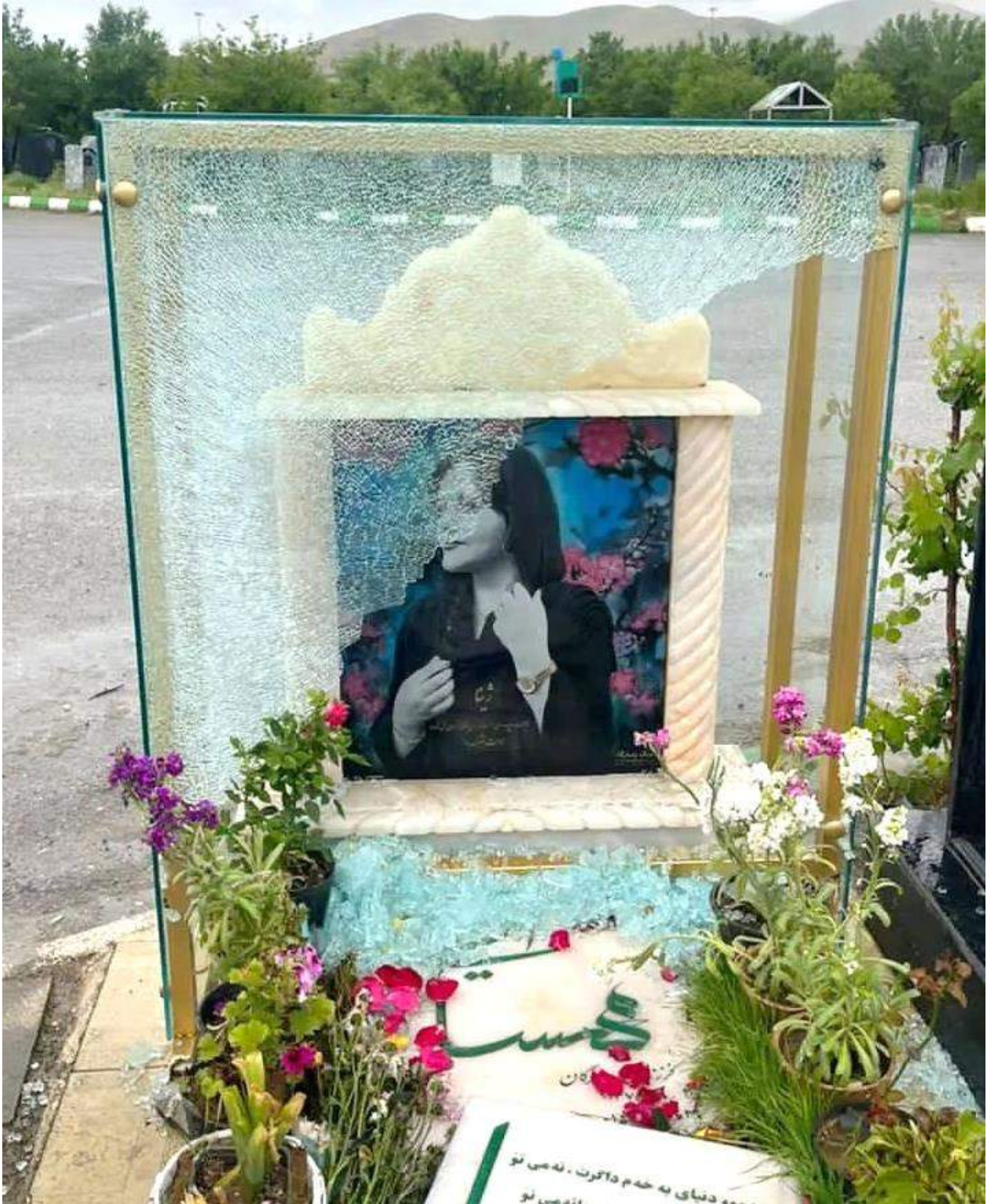
A picture of the vandalised grave of Mahsa/Zhina Amini, taken on 21 May 2023, with the glass encasing the headstone broken.