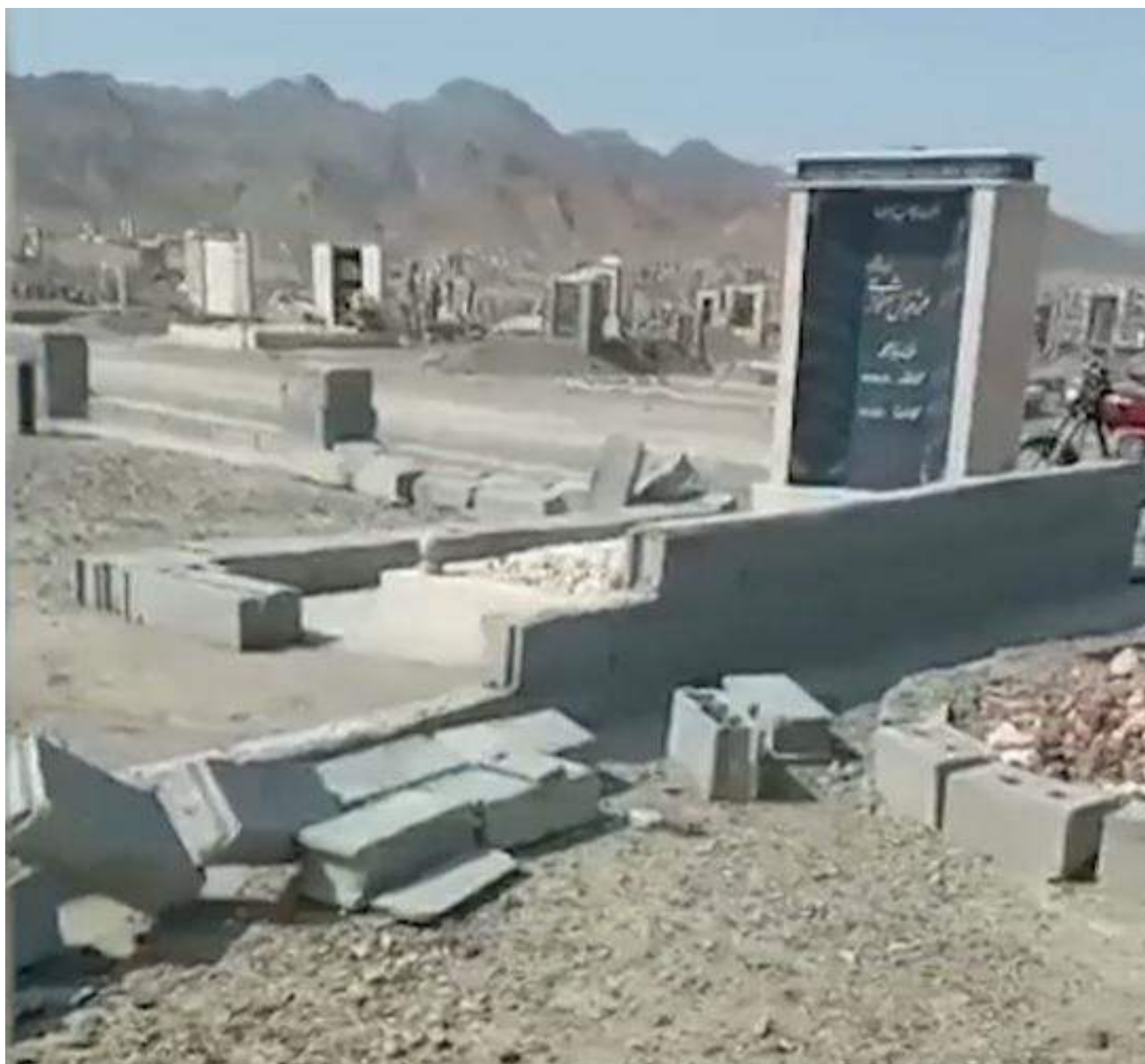
The grave of Mohammad Eghbal Shahnavaзи (Nayebzehi). The picture shows his gravesite after it was vandalised, with some of the bricks forming the raised concrete structure around his grave broken.