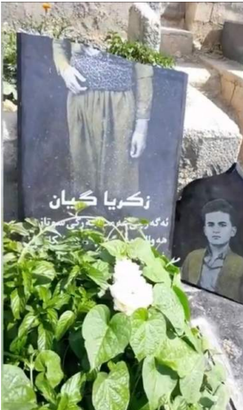
Zakaria Khial's gravesite. The picture shows the top part of his headstone broken off.