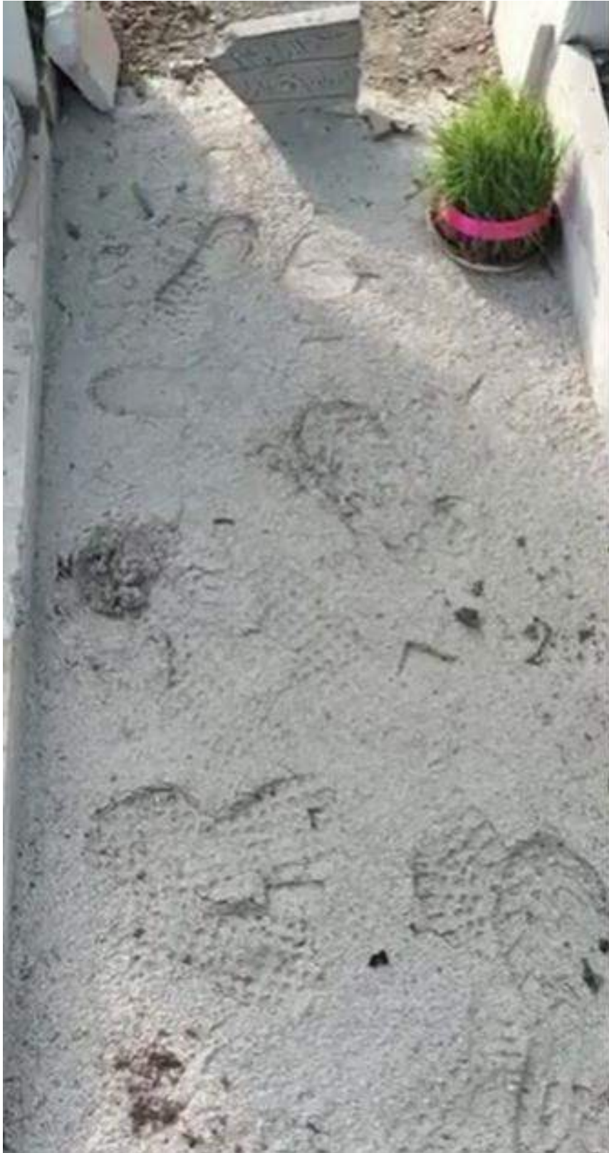
Arian Khoshgavar's grave. The picture shows his grave after it was vandalised with the cement containing multiple shoe prints