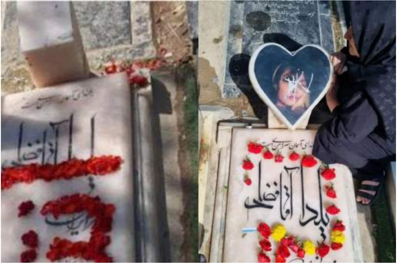
Yalda Aghafazli's gravesite. The picture on the left is from April 2023, when the heart-shaped part of her headstone containing a picture of her face was removed. The picture shows the pillar that remained afterwards. The family reinstalled a heart-shaped headstone several days later. The picture on the right is from August 2023 when lines were scratched onto her face on her headstone.