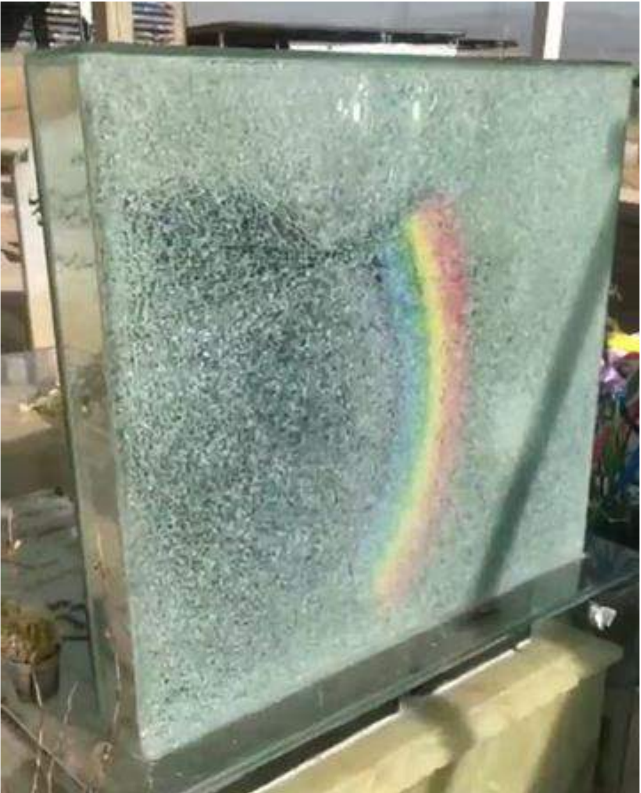
Kian Pirfalak's vandalised grave. The picture is a still from a video taken of his grave which showed that the glass encasing his headstone had been smashed.