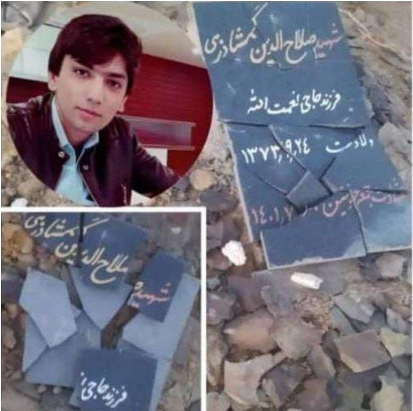
Salaheddin Gamshadzehi's grave. The picture shows his gravestone smashed into pieces.