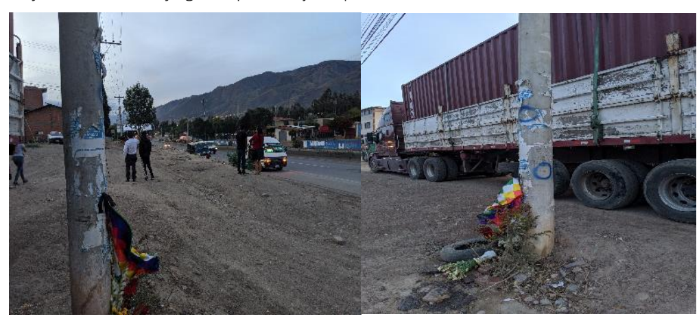
The photo on the left shows the view from the Huayllani Bridge where the security forces were positioned, looking towards Cochabamba. The photo on the right shows the same pole seen from where the security forces were positioned. According to the statements gathered, the blue rings mark the bullet holes. Interviewees stated that the shots came from the direction of the Huayllani Bridge.

Witnesses stated that after almost an hour, and without warning, the police began firing tear gas at the protesters. According to those interviewed, the protesters ran away, some carrying children, while others vomited and collapsed unable to breathe. Approximately 30 minutes later, the police and the army reportedly began firing rubber bullets and live ammunition at the demonstration. Several demonstrators said they were shot while trying to help other injured protesters. The police began firing tear gas at the protesters are away, some carrying children, while others vomited and collapsed unable to breather. Approximately 30 minutes later, the police and the army reportedly began firing rubber bullets and live ammunition at the demonstration. Several demonstrators said they were shot while trying to help other injured protesters.