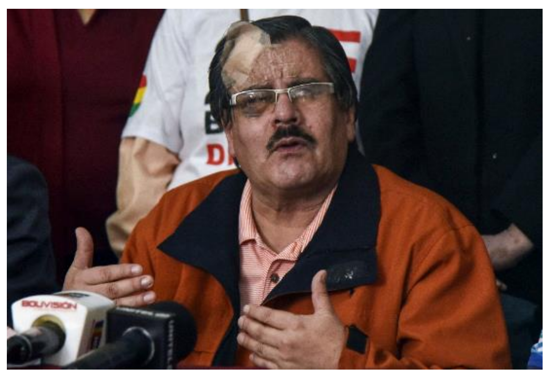
→ Waldo Albarracin at a press conference in La Paz on 27 October 2019.

Waldo Albarracin Sánchez has a long history of defending human rights in Bolivia. He was president of the APDH from 1992 to 2003, Ombudsman from 2004 to 2008 and Rector of the Universidad Mayor de San Andrés (UMSA) until 30 November 2019. He is currently a member of the National Committee for the Defence of Democracy (Comité Nacional de Defensa de la Democracia, CONADE). 139