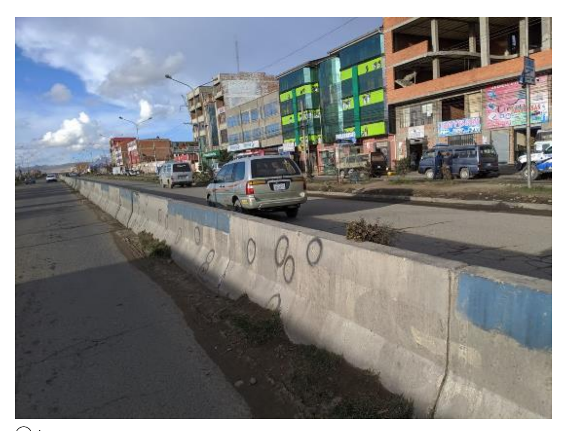
↑ Wall dividing the highway seen from the Senkata plant. Bullet holes in the concrete can be seen circled in black. 13 January 2020.

Anonymous sources from the Attorney General's Office stated that they did not find traces of dynamite in Senkata, but they did find the remains of Molotov cocktails on the walls of the plant. It should be noted that at least one person saw a young man making Molotov cocktails using small soda bottles from a kiosk. The witness indicated that the people did not know how to defend themselves when the soldiers shot at them. And he also indicated that a soldier shot the young man who was making the Molotov cocktails in the head and killed him. 120