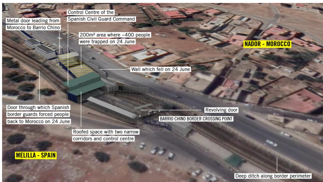
Figure 3: 3D model produced by Amnesty International Evidence Lab showing the Barrio Chino border crossing.

Barrio Chino, closed since the Covid-19 pandemic began in 2020, is a pedestrian crossing that could be used only by locals, - mainly porters, men and women involved in the so called 'atypical trade' - from 7 am to 10 pm. Available information indicates that the fences built by Spain and the border crossing posts are on Spanish territory. In July 2022, Amnesty International consulted several experts who, based on the information available at the National Centre for Geographical Information (CENIG), consider that the entire