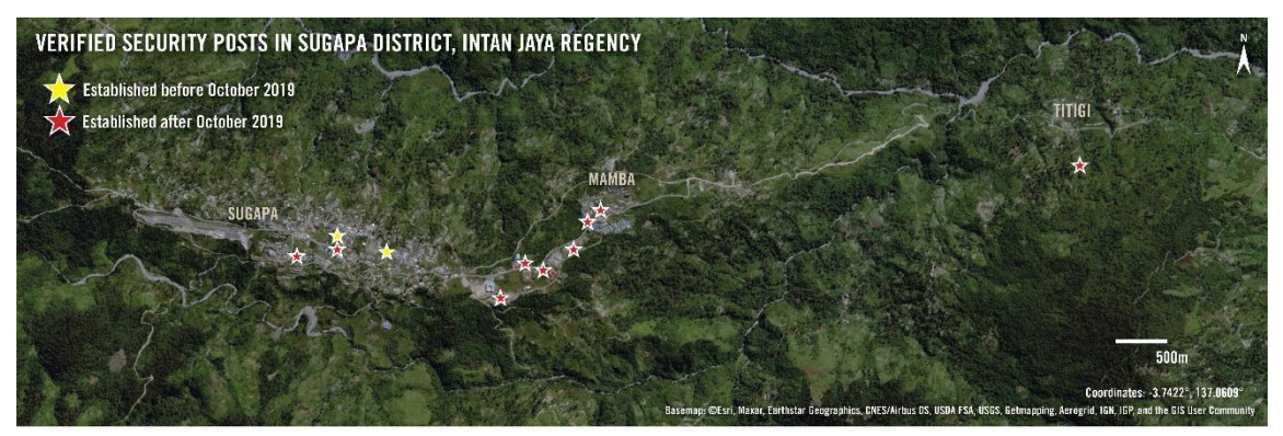
Map shows the location of 11 security posts in Sugapa district, Intan Jaya regency, verified by Amnesty International. Most of them were established after October 2019.

Amnesty International believes there are 17 posts occupied by security forces in Sugapa district, in Intan Jaya regency, based on interviews, open-source investigation, and satellite imagery. Interviewees provided the location of the 17 posts. <sup>43</sup> Amnesty International also confirmed the location of 11 of these posts based on open-source investigation and satellite imagery (see map below).