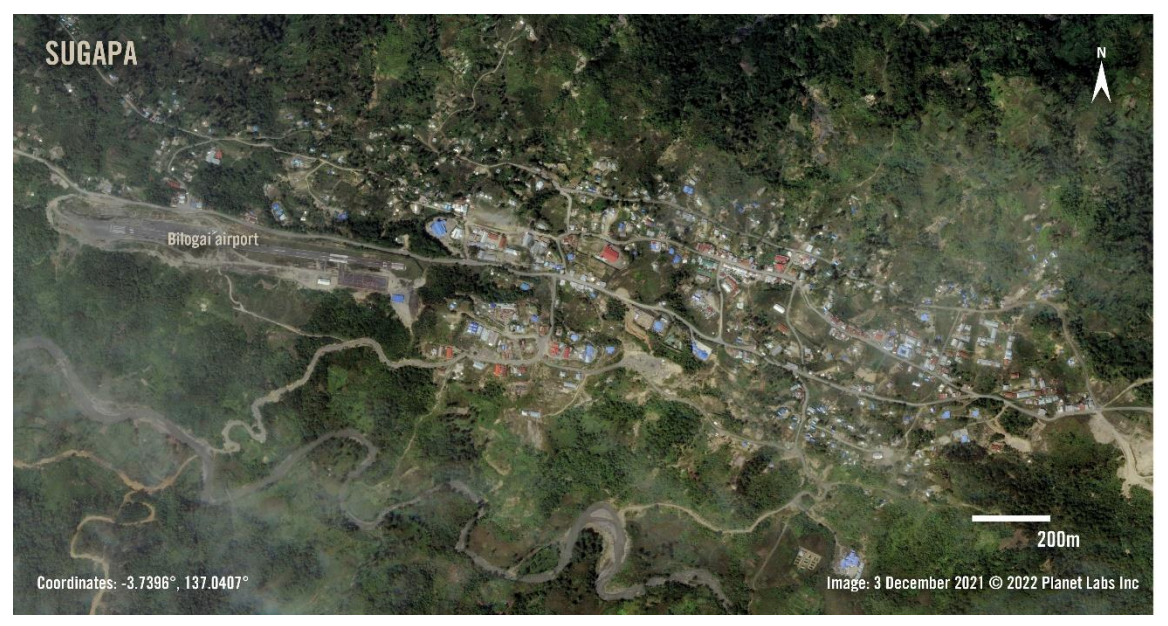
Satellite imagery from 03 December 2021 shows the aerial view of Sugapa district, capital of Intan Jaya regency.

Wabu Block is located just south of Sugapa district, capital of Intan Jaya regency, around Mount Bula. It is named after the local river Wabu. The area is inhabited by Indigenous Papuans. The same 1999 study noted that the area is inhabited by the Indigenous Moni tribe (also called Migani) and that "elaborate tribal and family laws exist, as do complex land ownership and usage issues".<sup>30</sup>