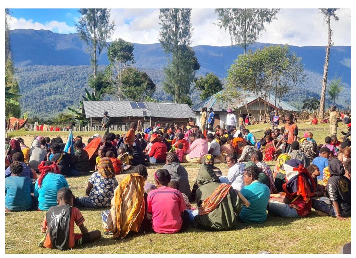
Indigenous Papuans gathered in an area near a church after gunfights in Sugapa district, Intan Jaya regency. 02 November 2021

Intan Jaya regency, where Wabu Block is located, has become a hotspot for conflict and repression since October 2019. Indigenous Papuans report that they live in an environment of violence and under multiple restrictions on public and private life imposed by an increasing presence of Indonesian security forces. As the presence of security forces has increased, its members have carried out unlawful killings, raids, and beatings. According to the interviews we conducted, security forces restrict the movement of residents, the use of electronic devices and how they appear by, for example, giving orders to cut their hair. Many residents have left their houses and villages in the search for the safety of other cities and the forest.