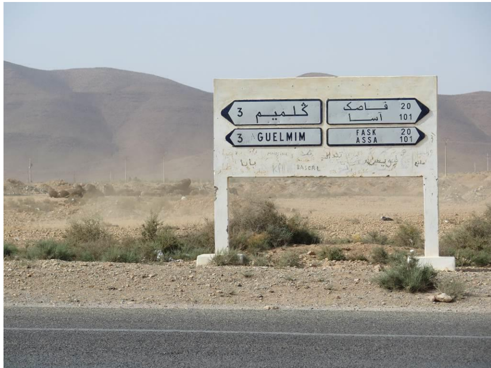
Photo: Junction between Gulemim and Assa, southern Morocco, where reports of protesters being tortured and otherwise ill-treated following arrest by gendarmes and police in September 2013 emerged.

"He was full of bruises. He told me they tortured him the night he was arrested, until he signed, although he was innocent. When he resisted signing, they threw water on him and gave him electric shocks. We went to the police station at the time, but they wouldn't let us see him."