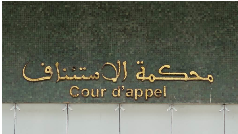
Photo: Agadir Court of Appeals whose landmark ruling in August 2014 overturned a conviction based on a torture-tainted police interrogation report.

In a rare decision, the Criminal Chamber of the Agadir Court of Appeals quashed a guilty verdict for drugs charges against a detainee who alleged torture, in August 2014. The court granted a medical examination which was performed in the Guelmim military hospital. It concluded that he had been tortured in garde à vue detention including though beatings, blows to the head that perforated his eardrum, and cigarette burns, following his arrest in Guelmim in June 2014. Authorities announced an investigation into the alleged torture, and have yet to make conclusions public.