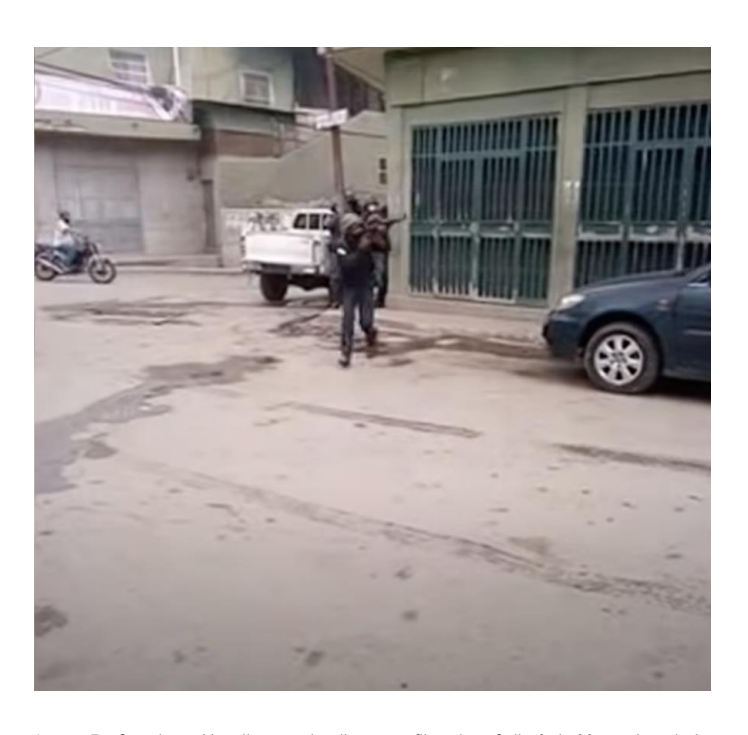
Image 5 - Gunshots: Heavily armed police were filmed on Calle 1 de Mayo, deep in La Vega. At about the 20-second mark of this video, a gunshot can be heard and a police officer ducks. At the 35-second mark, he can be seen aiming his gun while moving to go behind cover where other police are waiting. CPNB and Policia Nacional Bolivariana can be clearly seen on some of the uniforms.