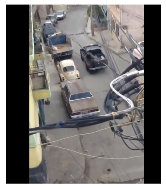
Image 6 – Transported body: A video, filmed from above street level on Calle Zulia, shows a police pick-up truck driving westward out of La Vega parish with what appears to a dead body in the rear.

The sequence of events shared on security forces' official channels mention that the operation was carried out after the supposed criminal groups took hold of the area, and that the events corresponded to a clash between security forces and said groups. These events resulted in several deaths and arrests. In his social networks, Miguel Domínguez, commander of the FAES, published on the night of 8 January 2021 that "15 alleged criminals [had been] killed, [there were] 2 innocent victims and 15 people [had been] arrested after shooting in La Vega".