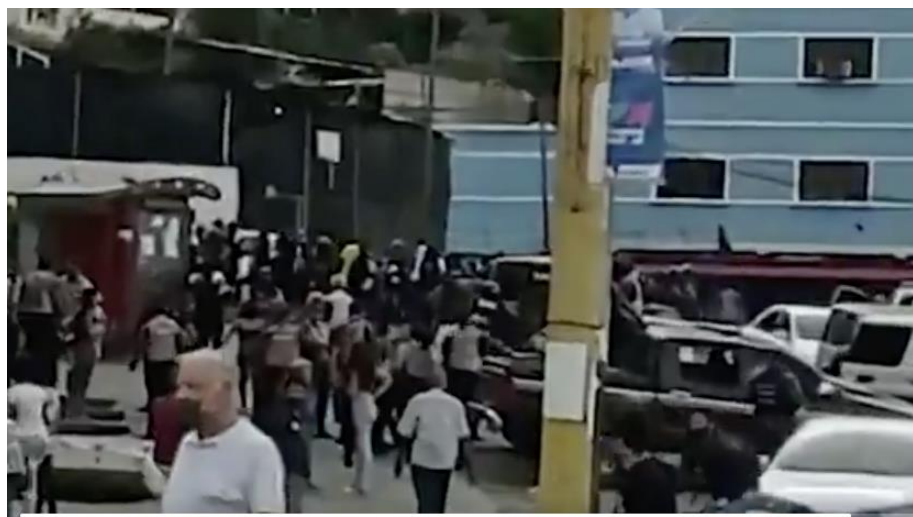
Image 2 – Police presence. Venezuelan police and their vehicles seen further south by Av. Guzmán Blanco, at the border of the La Vega parish on the morning of Jan 8.

Another video shows police officers in their vehicles on Avenida Guzmán Blanco, on the edge of the La Vega parish.