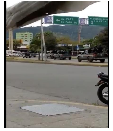
Image 1 – Police presence: Videos filmed on the morning of 8 January show a convoy of police vehicles driving south down Avenida O'Higgins in Caracas toward the La Vega area.

Amnesty International verified nine videos filmed between 8 and 9 January showing police activity in the La Vega area. Videos filmed on the morning of January 8 show a convoy of police vehicles driving south on Avenida O'Higgins in Caracas towards the La Vega area.