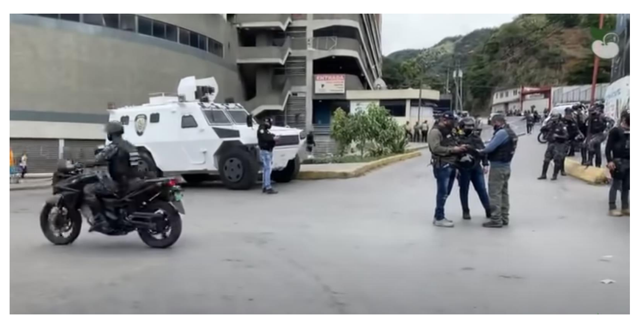
Image 3 – Police presence: Footage shows a heavy police presence near the Gimnasio Vertical in La Vega parish on 8 January. Clips also show the police vehicles, weapons, armour and UOTE badges.

A video published by local media also on 8 January shows a strong police presence near the Gimnasio Vertical in La Vega parish. Police vehicles, weapons, armor, and the acronym UOTE (Special Tactical Operations Unit of the FAES) are also visible in the video.<sup>4</sup>