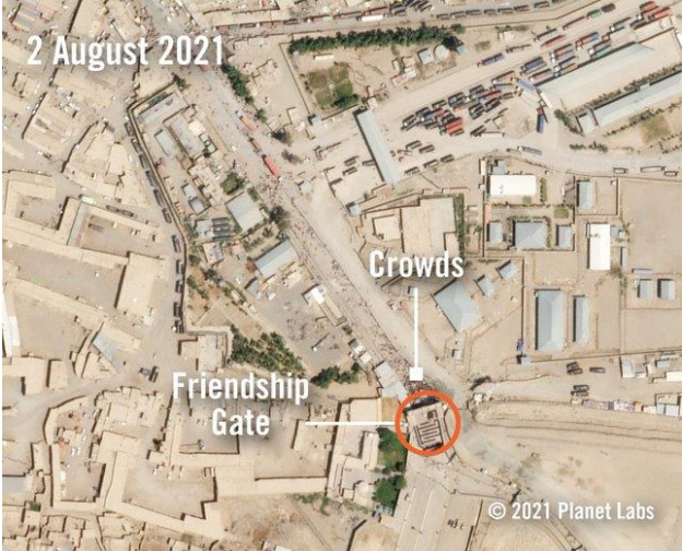
Spin Boldak border crossing. 2 August 2021.

Afghans who tried to cross land borders, an Afghan researcher, and the UN agency in charge of refugees (UNHCR), all told Amnesty International that the Afghan people were also prevented from seeking refuge abroad because most of the land border crossings were closed for asylum seekers. 185