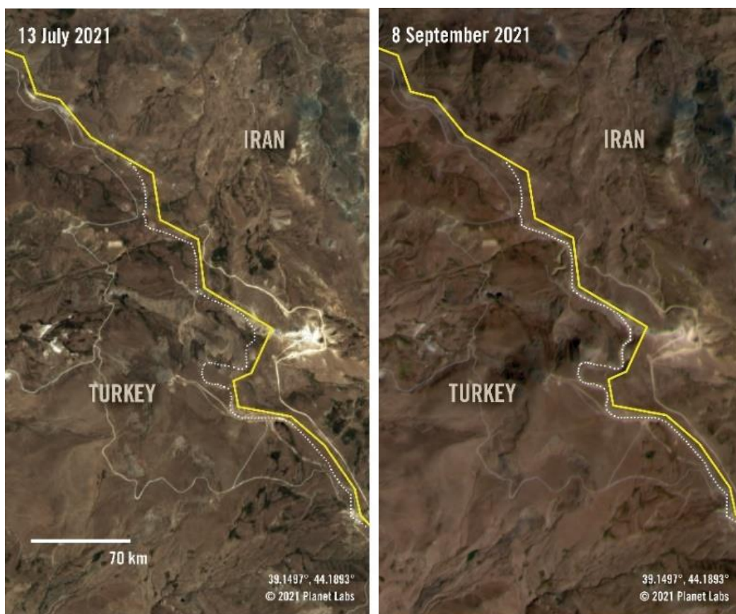
New Construction along the Turkey-Iran border between 13 July and 8 September, 2021.

An additional obstacle for Afghan people seeking to flee abroad seems to be the lack of passports. According to the Afghan researcher who spoke to Amnesty International, Afghan authorities currently do not deliver passports and Afghan people are not allowed to cross border without passports. 199