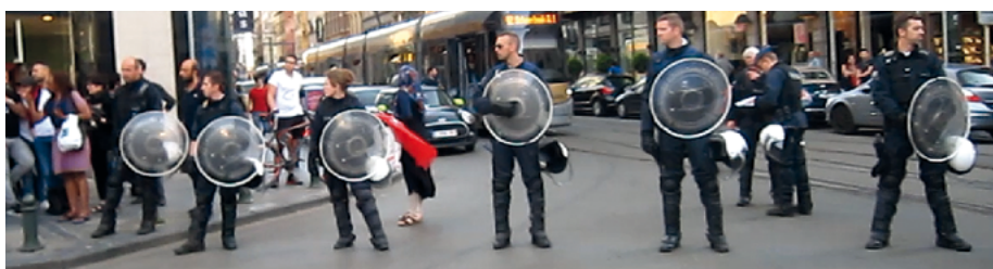
A loose line of police officers in Brussels, Belgium, 24 May 2017