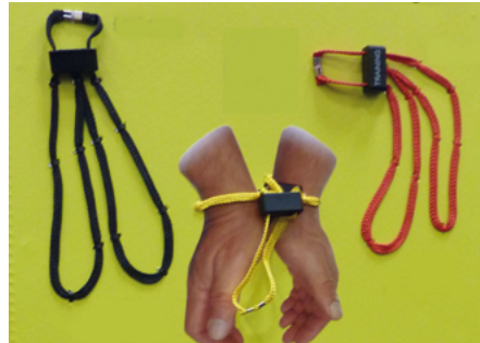
Disposable textile handcuffs