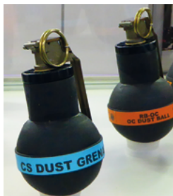
Chemical irritant grenades