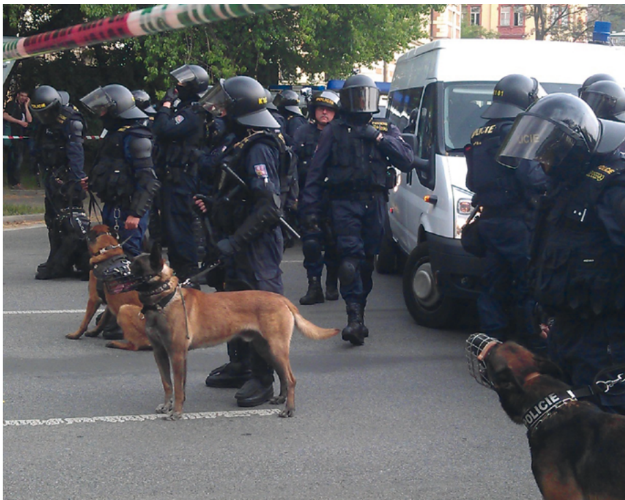
Police dogs, Ústí nad Labem, the Czech Republic, 1 May 2014

Studies have shown that police dogs tend to bite multiple times, often in the head, neck, upper arms and chest. 72 Being attacked by a police dog can be particularly traumatic and can leave lifelong physical and mental scars. Studies have found that the use of dogs against suspects greatly increased the risk of injury compared with other use of force methods. 73