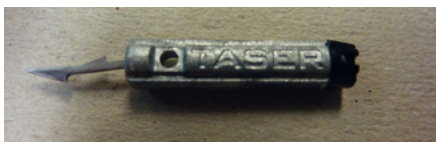
An electric shock projectile – barbed dart