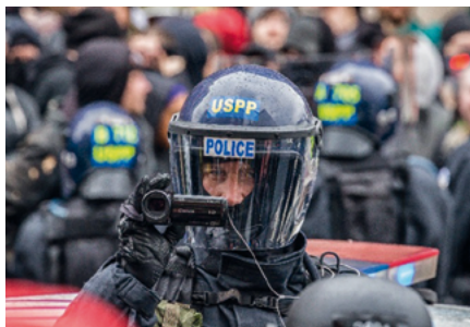
A U.S. Park Service Police Officer takes video of spectators observing an incident in which the USPP has kettled a group of people at 12th and L NW in Washington, D.C., on Inauguration Day, 20 January 2017

into vehicles, worn covertly by officers, installed in a server-type unit, operated via a laptop, or be fixed at specific locations (e.g., places frequently used for public assemblies). Capabilities include obtaining the unique identifying numbers of mobile phones (i.e., IMSI / IMEI), mass or targeted interception and storage of voice calls and SMS messages, decryption of encrypted communications, re-routing of calls, masquerading as the user and voice recognition.