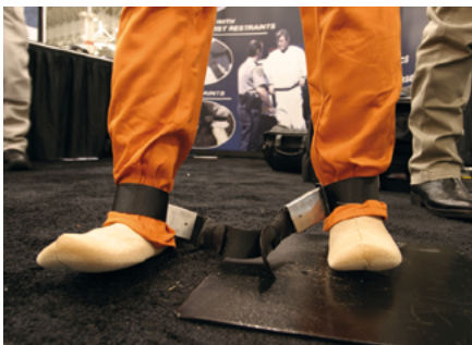
A fabric restraint with metal grip