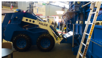
A vehicle with an integrated barrier marketed for policing assemblies