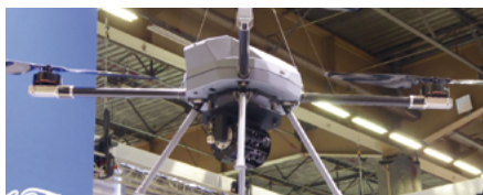
An unmanned aerial vehicle