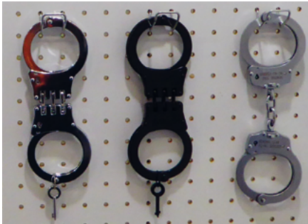
Chain-link and hinged handcuffs