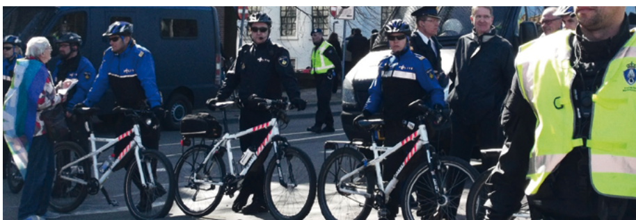
A line of bicycle police units in The Hague, the Netherlands, 23 March 2014