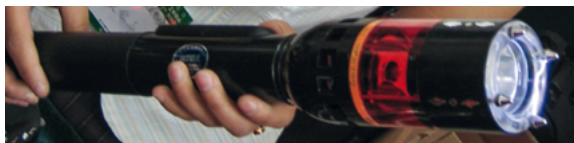
An electric shock flashlight