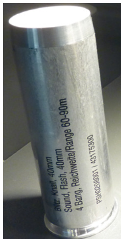
A 40 mm cartridge-launched stun projectile