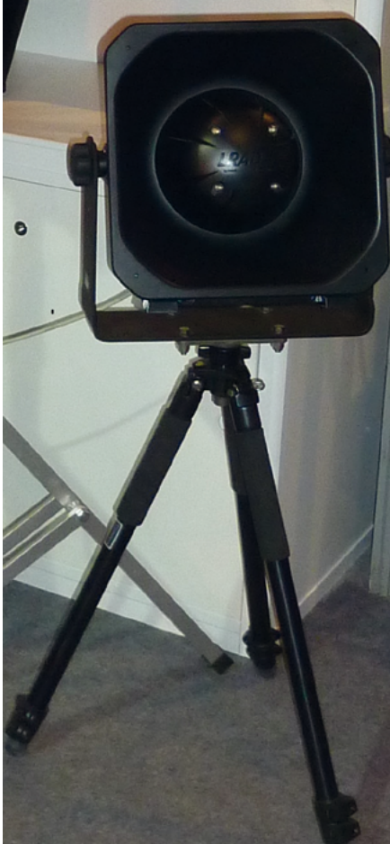
A free-standing acoustic device