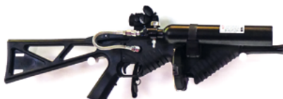
A compressed-air launcher