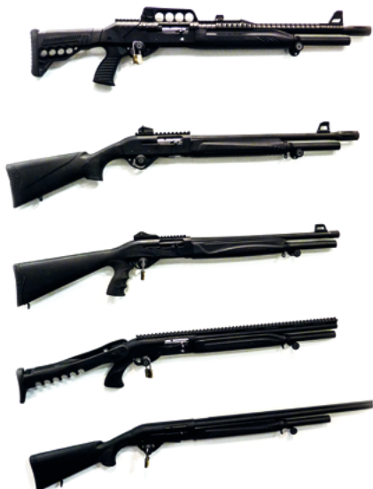
Different forms of shotguns