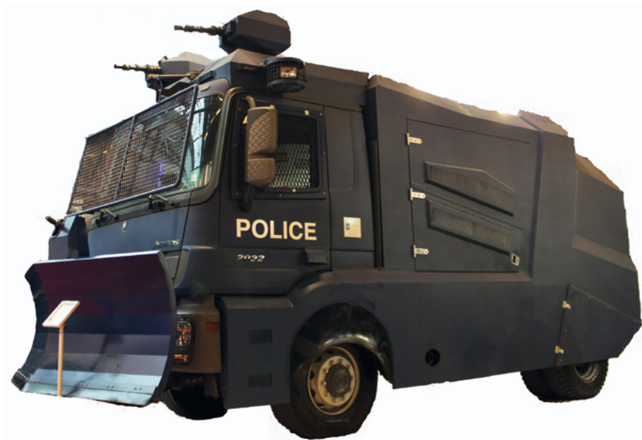
A riot control vehicle with mounted water cannons