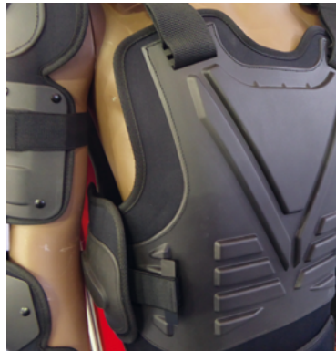
Riot-control body armour

ployment of protective equipment may often constitute a good practice, and its availability is an important aspect of the principle of precaution.