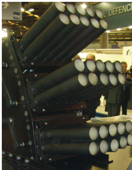
A multiple barrel launcher