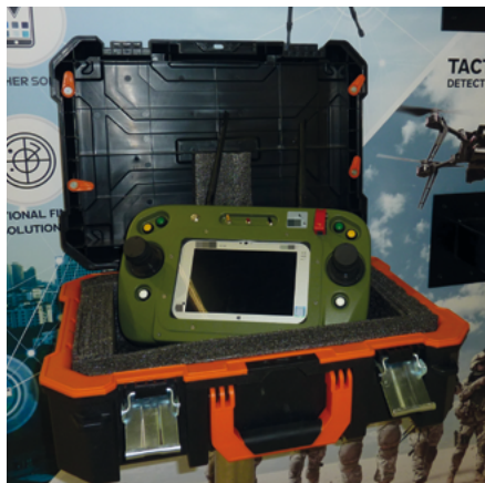
A UAV with surveillance and interception capabilities