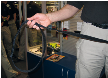
A "fast" strap