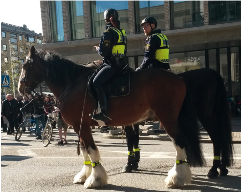
Mounted crowd-control police officers, Gothenburg, Sweden, 1 May 2016

Horses can react unpredictably when they are frightened, for example by loud noises, and this can lead to injuries to mounted law enforcement officers and protesters in close proximity.