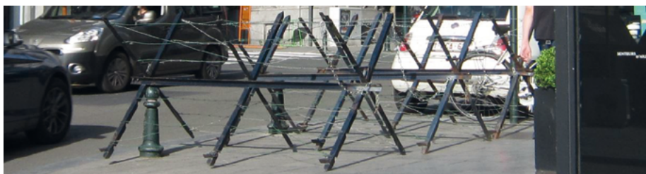
A temporary barbed barrier in Brussels, Belgium, 24 May 2017