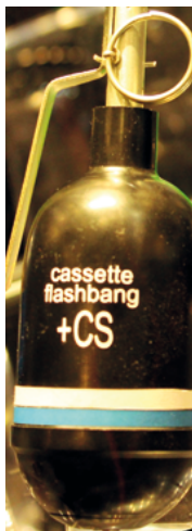
A hand-thrown stun grenade with CS chemical irritant