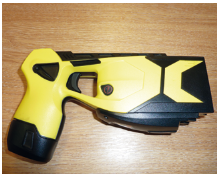
A projectile electric shock weapon