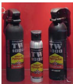
Handheld irritant sprays