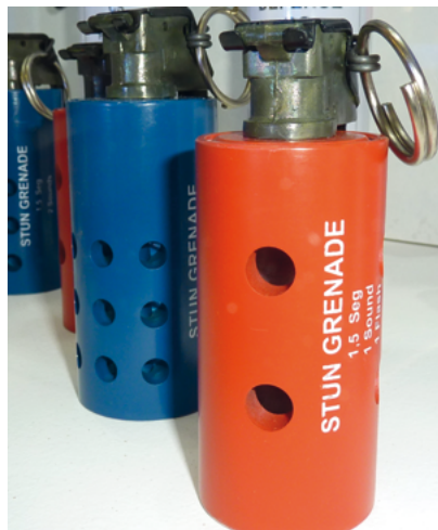
Hand-thrown stun grenades