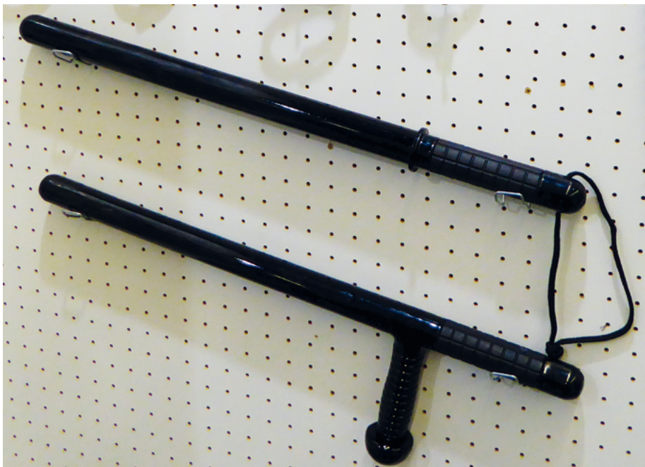
A straight baton and side-handle baton