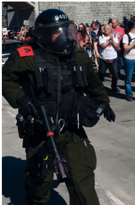
An officer with a single-shot handheld launcher in Quebec City, Canada, 9 June 2018