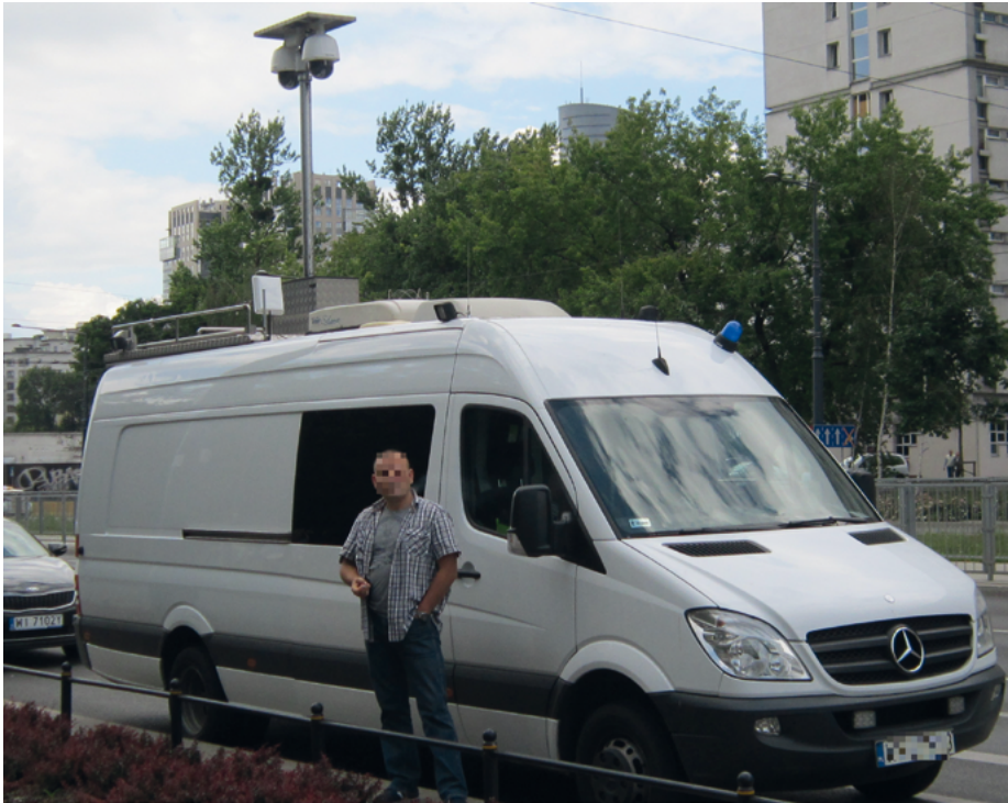
Surveillance vehicle, Warsaw, Poland, 9 July 2016

Signal jammers are used to generate disruptive signals across the radio frequencies used by mobile phones, wireless Internet and other communications devices and networks, in order to block communication with antenna towers, thereby preventing communications technologies from being used within a certain area. Jammers vary greatly in appearance and size, with some having multiple antennae. Models promoted for law enforcement use include devices integrated into backpacks, clothing or laptops, devices intended to be installed in a fixed location, devices designed to be installed and used in vehicles and standalone, portable devices. Signal jammers have been used to make electronic communication difficult or impossible at an assembly including, including the transmitting of live video feeds or posting to social media.