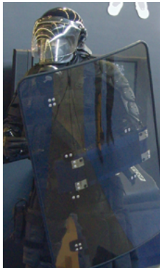
A law enforcement officer with riot-control shield, body armour and helmet