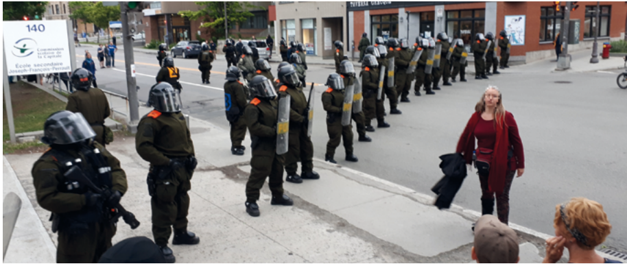
Police officers with protective equipment in Quebec City, Canada, 7 June 2018