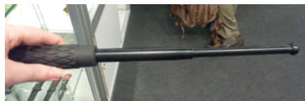
Telescopic / extendable batons