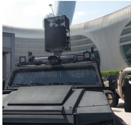
A vehicle-mounted acoustic device

indiscriminate, as they cannot be used to target a particular person without also affecting others in close proximity, 13 and because the health implications are unpredictable, as individual sensitivity to sound exposure varies greatly. 14