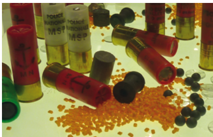
12 gauge (shotgun) kinetic impact projectiles