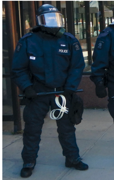
Police officers with disposable plastic restraints

officials can carry multiple sets. Fabric restraints are used to reduce the risk of injuries associated with metal restraints. These are sometimes used when a suspect has already been brought under control, replacing the restraints used at the moment of the detention.