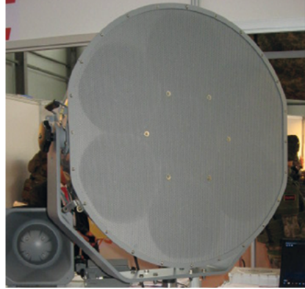
A free-standing acoustic device