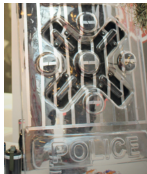
An electric shock shield

for such purposes. They are more widely used by private security companies and for self-defence by civilians.