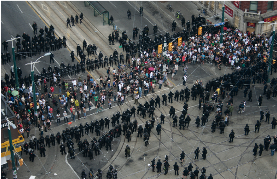
Protesters at G20 in Toronto boxed in by riot police at Queen and Spadina, 17 June 2010

Any additional use of force, or threats of use of force, on those already contained may amount to excessive force and could lead to panic or injuries arising out of a crush or stampede.