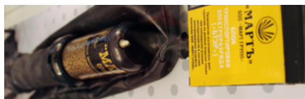
A projectile electric shock weapon

that their use in drive-stun mode should be prohibited. 37 The Committee previously recommended that “electrical discharge weapons are used exclusively in extreme and limited situations – where there is a real and immediate threat to life or risk of serious injury – as a substitute for lethal weapons and by trained law enforcement personnel only”. 38