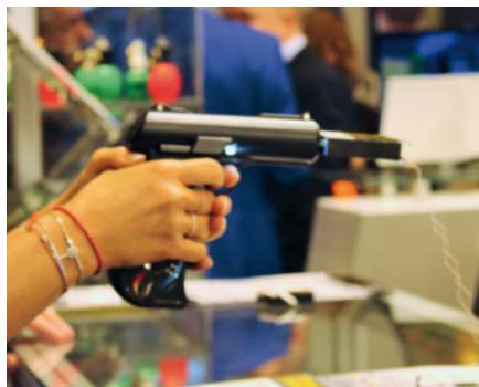
A projectile electric shock weapon and cartridge.