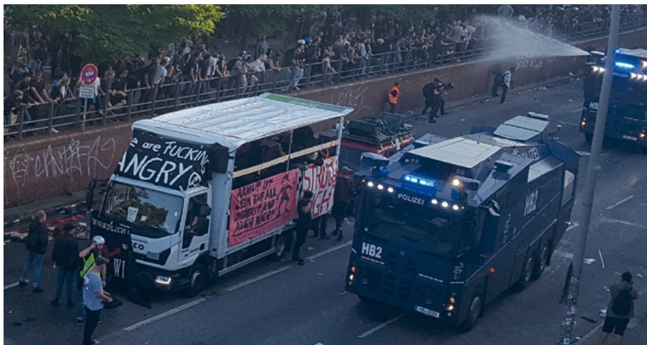
Police using a water cannon against protesters, Hamburg, Germany, 6 July 2017

The kinetic impact of the water can knock a person over, push them into fixed objects, or pick up loose objects and propel them as missiles. There is a risk of blunt trauma injuries when people are struck from close range. Injuries such as blindness, fractures, bruising and concussion have been reported. The United Nations Human Rights Guidance on Less-Lethal Weapons in Law Enforcement states that the targeting of a jet of water at a person or persons from close range could amount to “potentially unlawful use”. 123