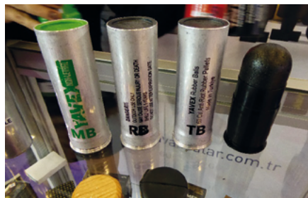
38-40 mm launchable projectiles

The ODIHR Human Rights Handbook on Policing Assemblies states that “[kinetic impact] projectiles are very high on the use of force continuum and next on the scale to the use of firearms”, and “if used incorrectly they can cause death or serious injury”. 58 The handbook and the UNODC/OHCHR Resource Book on the Use of Force and Firearms in Law Enforcement both recommend that kinetic impact projectiles should only be used when there is an immediate risk of serious injury or death and should only be aimed at individuals posing such a threat. 59 The ODIHR handbook, recommends that skip-firing – the practice of firing kinetic impact projectiles at the ground in front of someone so that they skip up and hit them – be avoided and, importantly, it states that kinetic impact projectiles “should never to be shot indiscriminately into a crowd”. 60 Skip-firing or ricochet, makes the projectiles’ trajectory unpredictable, 61 increasing the risk that vulnerable areas of the body or persons other than those targeted will be hit.