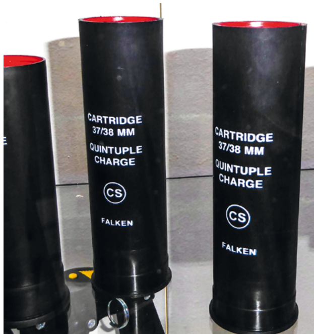
Cartridges with launched CS (tear gas) projectiles

only be used “for dispersing groups that present an immediate and direct threat and when conventional methods of policing have been tried and have failed, or are unlikely to succeed”. 25