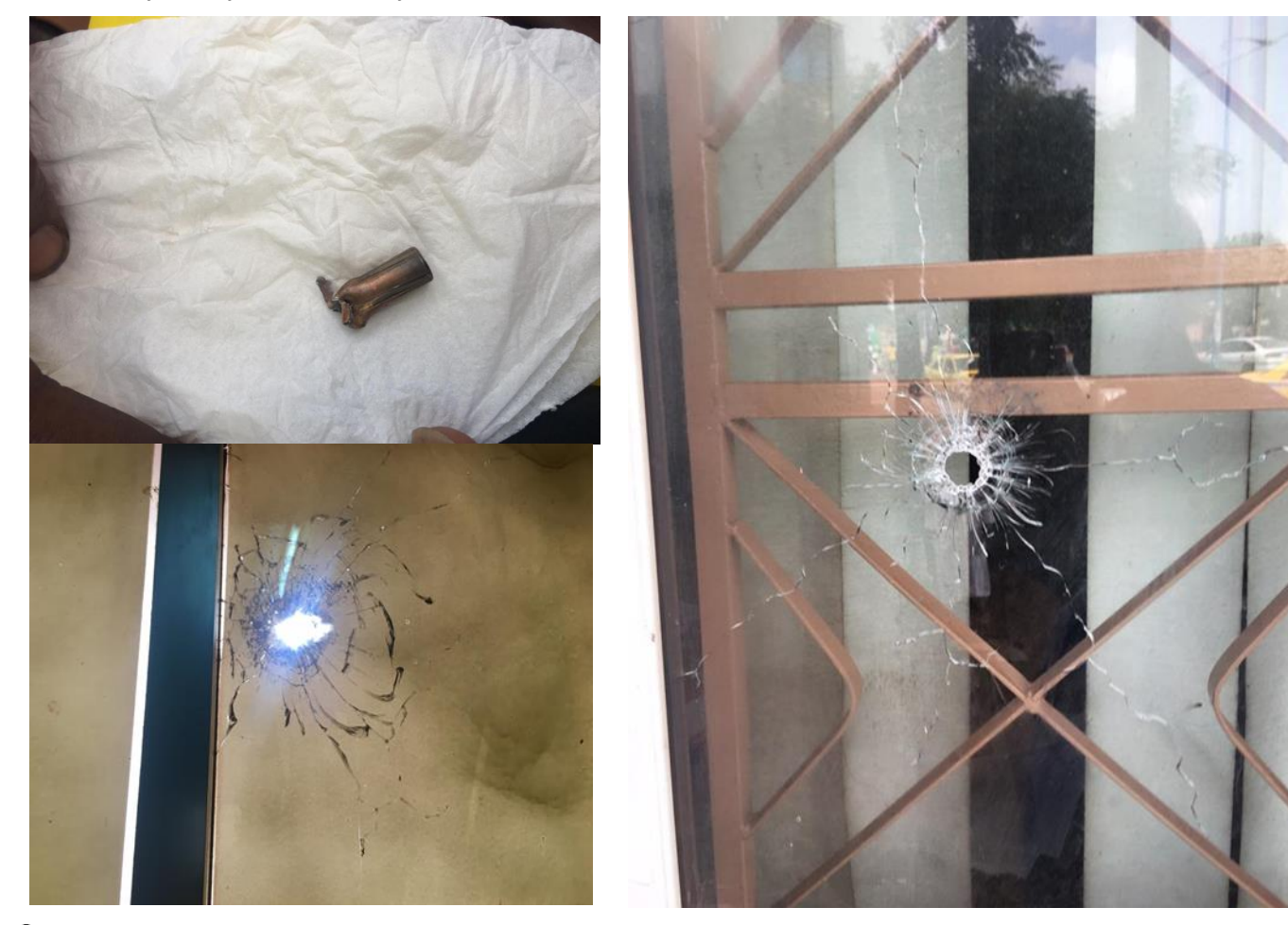
Bullet impact on Immeuble Adjacoroba in Sogoninko/Magnambougou, during the 11 July demonstrations.

Beyond the victims, some of the private properties were riddled by bullets fired by police officers stationed near the Magnambougou junction. This is the case of Immeuble Adjacoroba in Sogoninko, which was hit by bullets fired by security forces on 11 July.