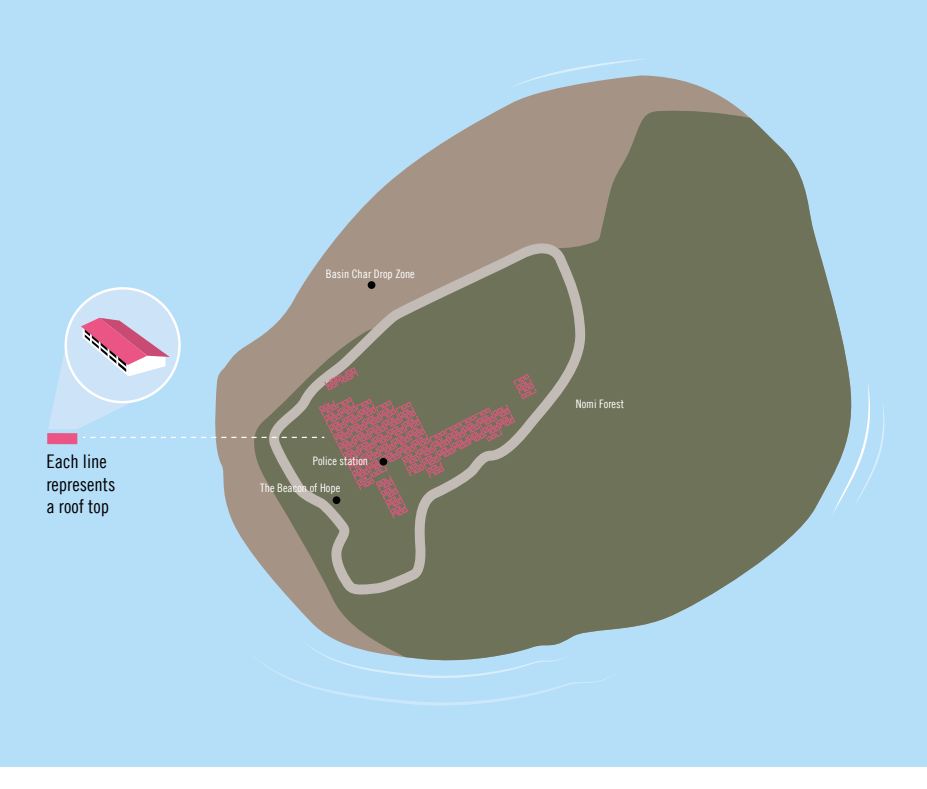
Illustration of Bhashan Char (top view)

phone-based financial service, to a Navy official before she could call her daughter. If she sent her daughter money for food, she would sometimes receive the money, but she said that sometimes the Navy officials offering the money transfer service through their phones would not pass the money on to her daughter.