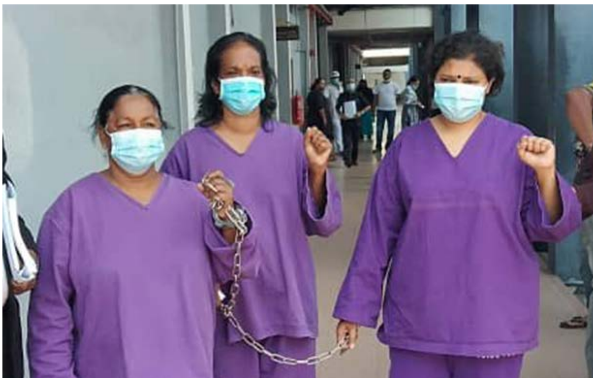
Remand hearing of unionists involved in protests, 3 June 2020, Ipoh, Magistrate Court

also pressured to undress in front of officers, threatened with a baton, and denied water and face masks while jailed. 81 Following advocacy and mobilisation from civil society organisations (CSOs), on 1 October 2020, the five protesters were granted a discharge not amounting to an acquittal. This was after the prosecution accepted the defence's representation not to proceed with the charges. 82