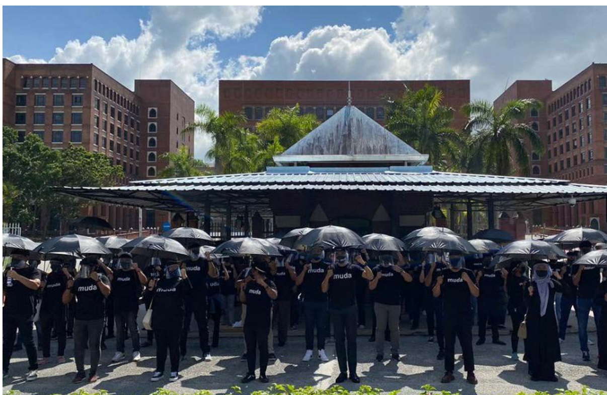
MUDA party members at Registrar of Societies, Putrajaya demanding registration. 21 December 2020, Putrajaya

The legal framework governing the operations of CSOs and political parties remains unduly restrictive and overly burdensome.