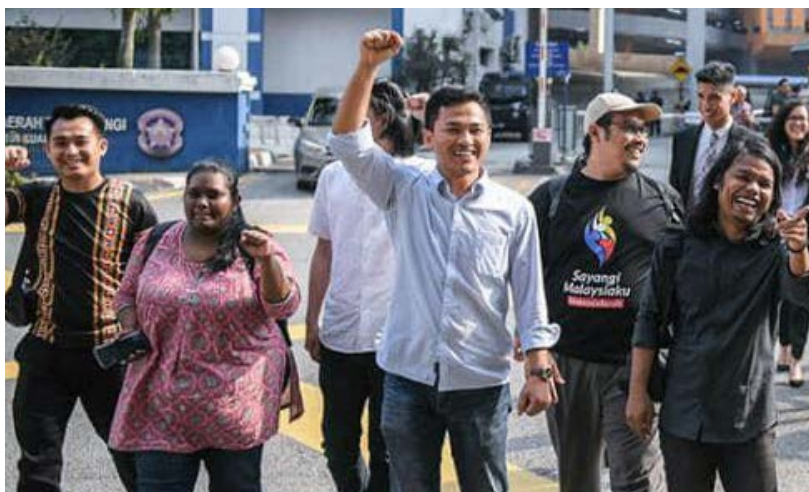
20 civil society activists investigated for potential violations of the Peaceful Assembly Act, 4 March 2020, Dang Wangi Police District Headquarters