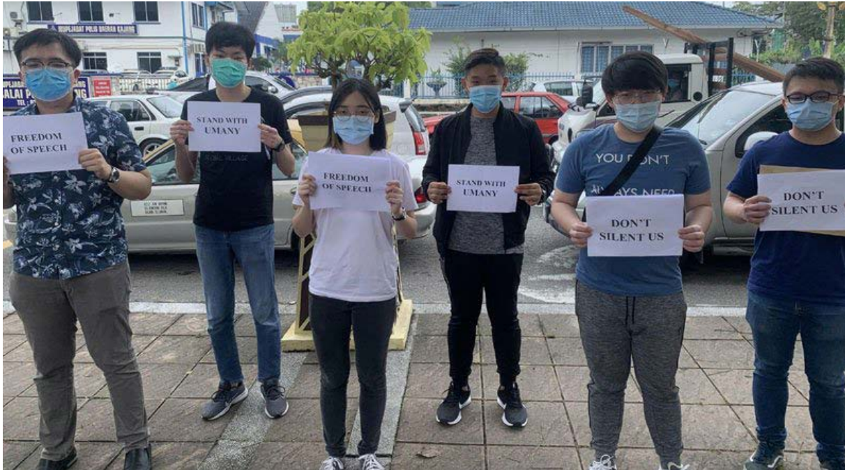
Two Umany students called for investigation under the Sedition Act by the police for publishing a Facebook post about the role of the king, 5 November 2020, Kajang Police District Headquarters.

The Sedition Act has been used extensively in recent years. According to the Home Affairs Minister, between 2015 and July 2020, 300 cases were opened under the Act. In these cases, 41 individuals were charged with violating the Act, 171 cases have been closed, and 34 cases were still pending as of July 2020. 11