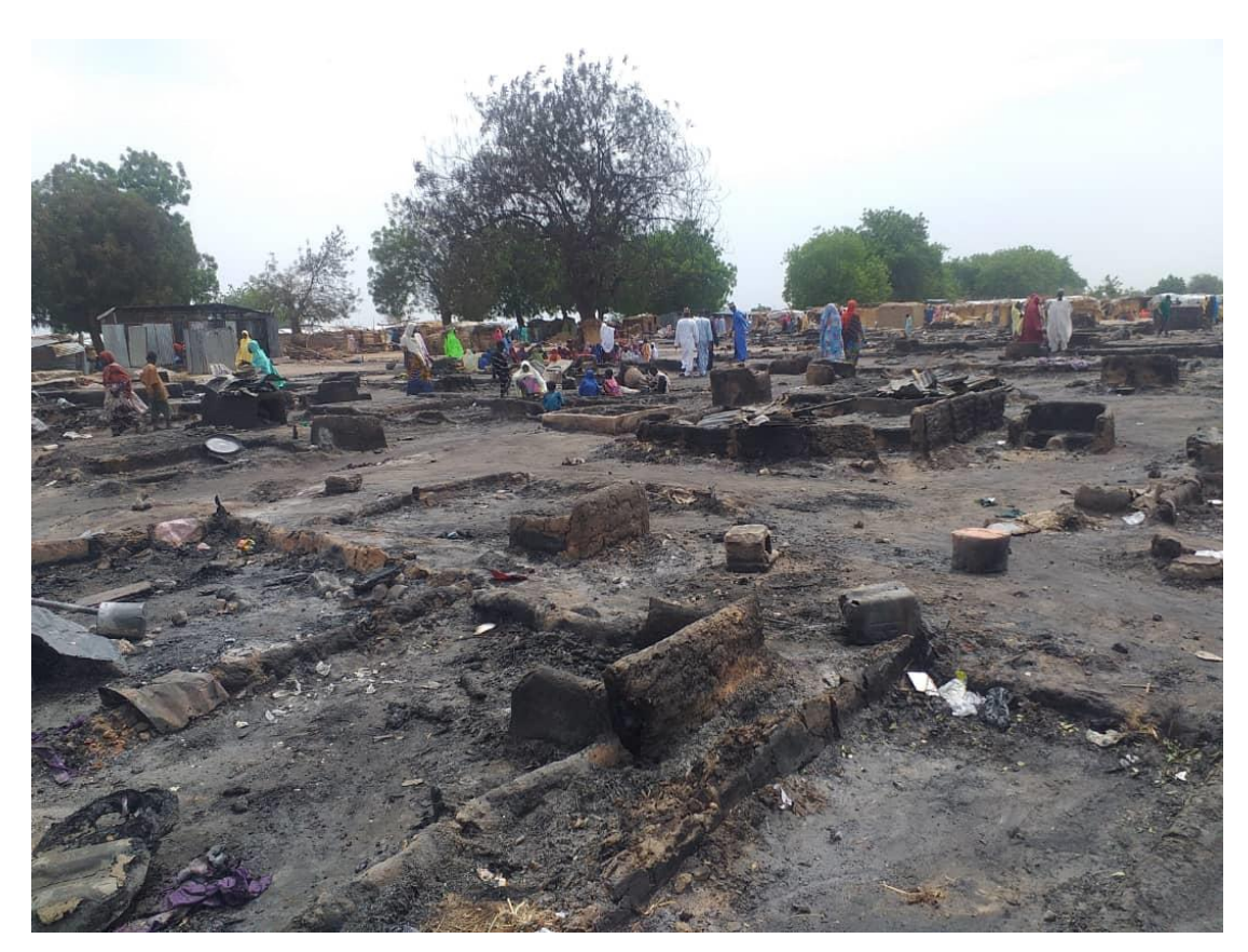
The remains of burnt shelters in Muna El-Badawy Camp, May 2020

Following a series of major fires in four different camps in the first half of 2020, including in Muna El-Badawy Camp, the Nigerian federal Minister of Humanitarian Affairs said the government would be developing a strategy to prevent fire outbreaks. <sup>335</sup> It is unclear what steps have been taken in subsequent months. Given the level of overcrowding, securing additional land for new or expanded camps is essential. <sup>336</sup>