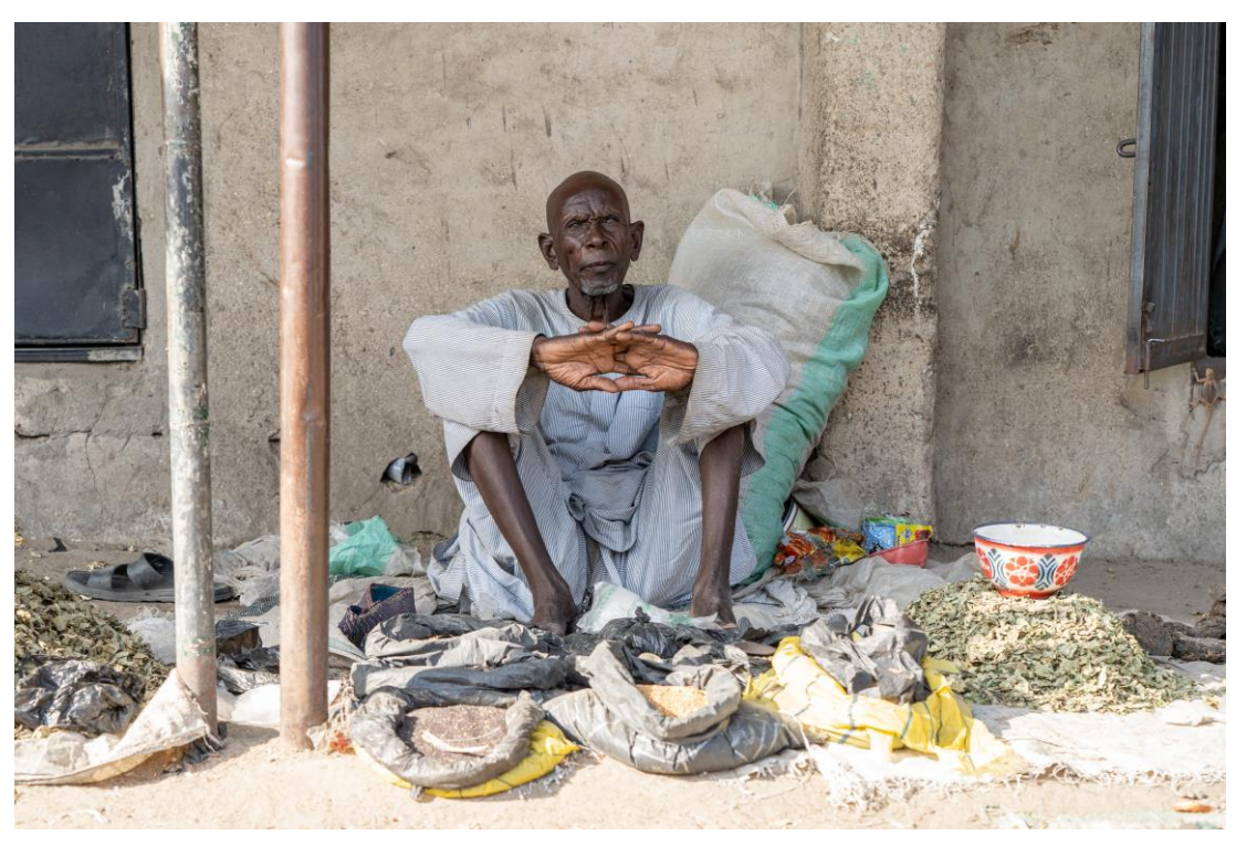
A displaced older man sits and sells small goods at a market near Maiduguri, Borno State, Nigeria, October 2020.