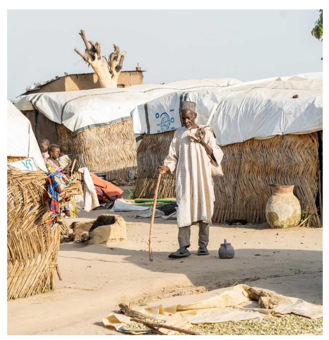
On older man walks to his shelter in an IDP camp in Borno State, Nigeria, October 2020.

An untold number of older people have died after being left behind, as they were unable to access adequate food and health care. A 72-year-old community leader in Baga town said he was one of dozens of older people who could not flee when Boko Haram took the town in December 2018; when the military recaptured Baga weeks later, soldiers asked him to assemble everyone, so that the military could bring them to Monguno. As the community leader went house to house, he found six people who had died. "Those people died in their homes—alone," he said. "We buried them in their houses." 116 He gave the names of all six; four were older men, and the other two were younger men with disabilities—one physical and one psychosocial.