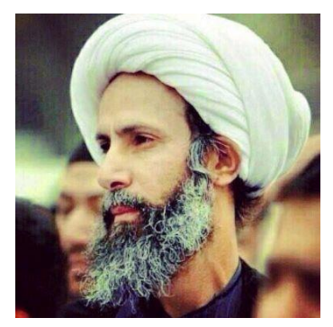
♠ ↑ Nimr al-Nimr.

The situation in the Eastern Province remained volatile throughout the rest of 2011, with security checkpoints, search operations and confiscation of electronic devices and footage of protests, and waves of arbitrary arrests of activists and protesters and occasional reported releases. In October, protests flared up again, marked by clashes with security forces which, according to the Ministry of Interior, resulted in 11 police officers being injured by people intent on causing "strife and discord" and who were acting at "the behest of a foreign country seeking to undermine the security of the homeland", in apparent reference to Iran. The Ministry also declared that it would "strike with an iron fist" anyone who sought to compromise Saudi Arabia's security or stability. In November, at least four people were killed in unclear circumstances. Tension remained high throughout the subsequent months, with 10 Shi'a men shot dead in unclear circumstances between January and July 2012.