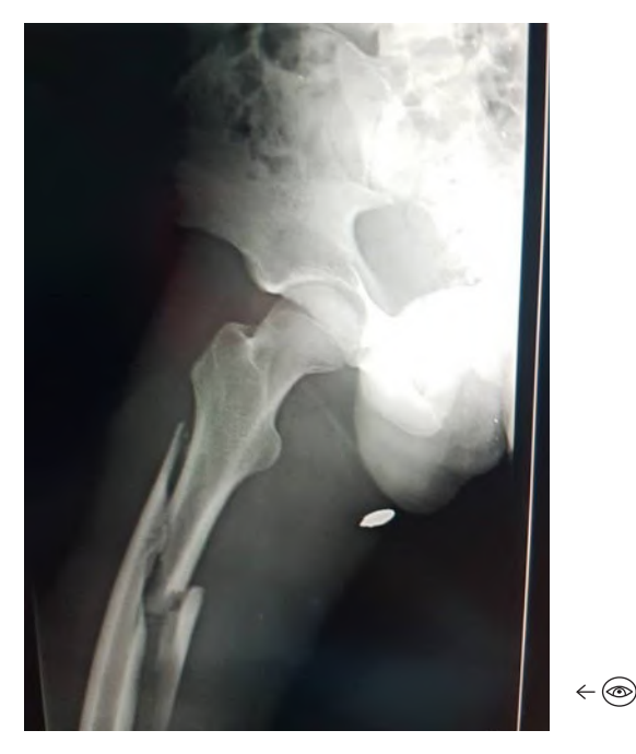
M.A.X.'s X-ray taken at the Dr José María Benítez de la Victoria Hospital, January 2019.

The jurisprudence of the Inter-American Court has established that, in addition to the absolute demonstrable necessity of using lethal force, its use must be proportionate to the level of resistance offered at any given moment and "the level of cooperation, resistance, or aggressiveness" in order to "use tactics of negotiation, control or use of force, as appropriate". <sup>114</sup> The details of this case indicate that the GNB used lethal force almost immediately, in order to enable road traffic to circulate and when the blockade posed no risk or threat to the lives of the officials.