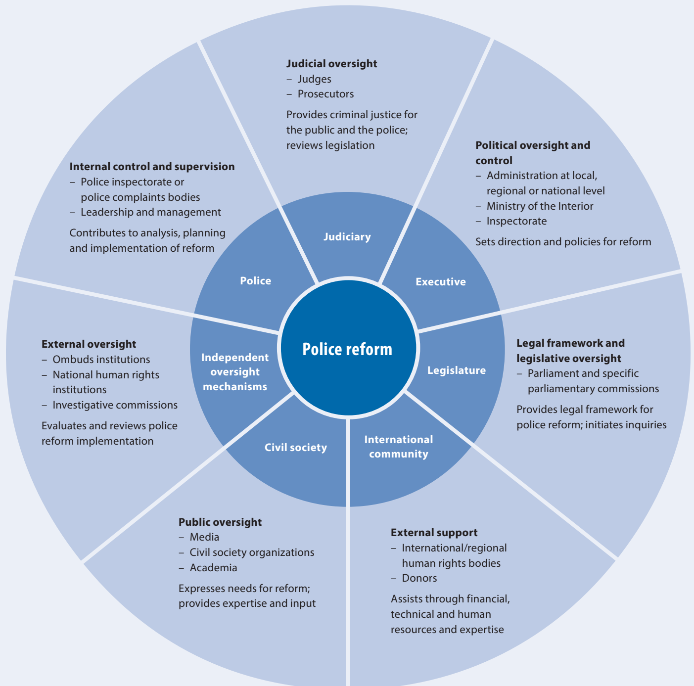
Figure 1 Police reform involves a variety of state and non-state actors