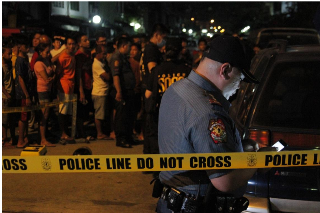
A policeman waits at the scene of an anti-drug police operation, 17 August 2017, Manila.