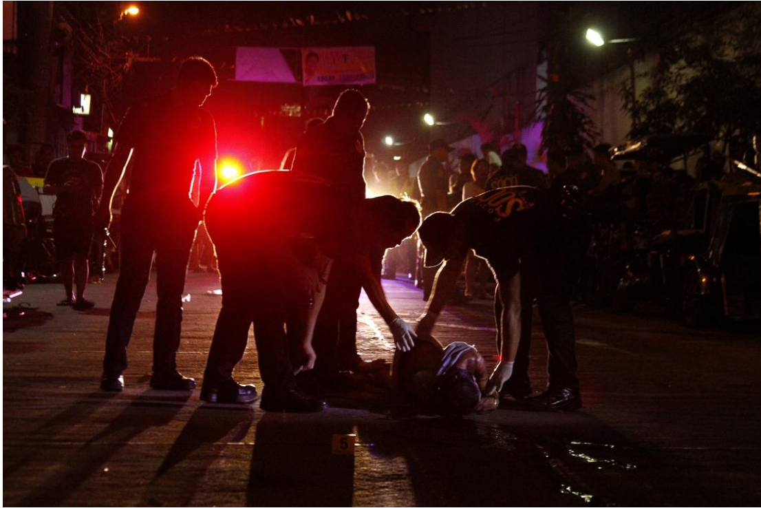
Crime scene investigators handle the body of a man killed by unknown armed persons, 11 May 2018, Caloocan City, Metro Manila. Local officials said the man was on a “drug watch list.”

A former public safety officer who had served in various security roles in their community for more than a decade told Amnesty International that in their experience, “drug personalities” with connections do not end up on these lists. “I know a big-time pusher [in our area], but his name is not on the list,” they said. 117 Documentation by Amnesty International and others, as well as extensive media reports suggest that this is not unusual and that the vast majority of those on the lists are poorer, more marginalised members of the community.