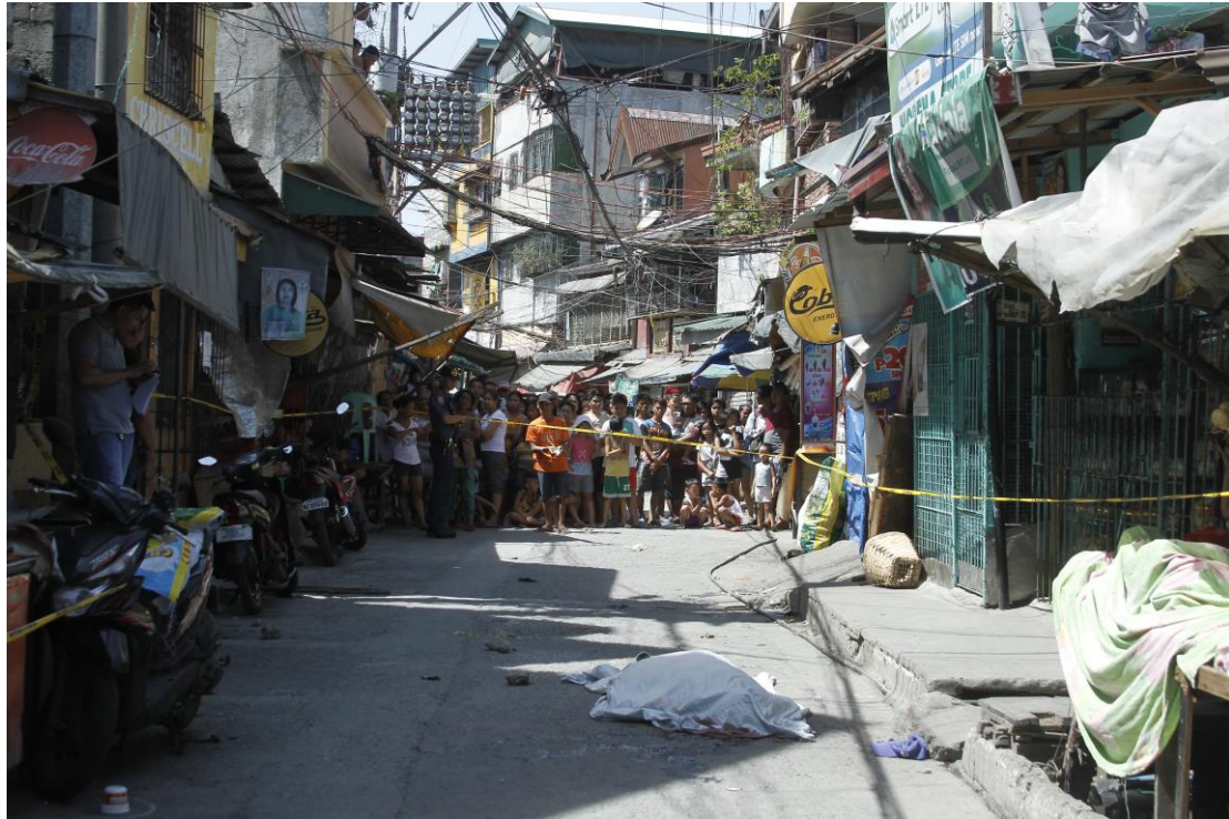
Onlookers gather behind police crime scene tape at the site of the killing of a man who was shot by unknown armed persons, 21 March 2019, Malabon City, Metro Manila. A sign reading "Don't emulate me, I'm a [drug] pusher" was left on the body.