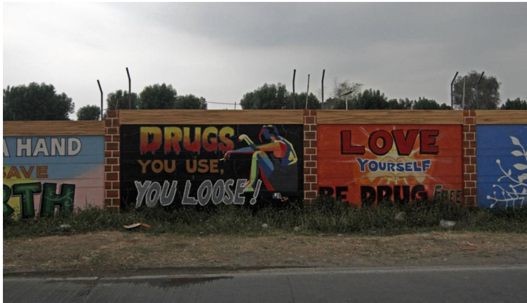
In this photo taken 18 April 2019, murals supporting the government's anti-drug campaign can be seen in Bocaue, Bulacan.

Mandatory drug testing is an arbitrary interference with an individual's privacy and is counterproductive from a right to health perspective, since it deters people from seeking the help they may need. Moreover, the consequences of having a positive result after a drug test can be deadly, as Feria attested. Far from allowing people using drugs to seek help, the requirement for them to expose themselves to local authorities and others so publicly has increased stigma and demonisation of people using drugs further.