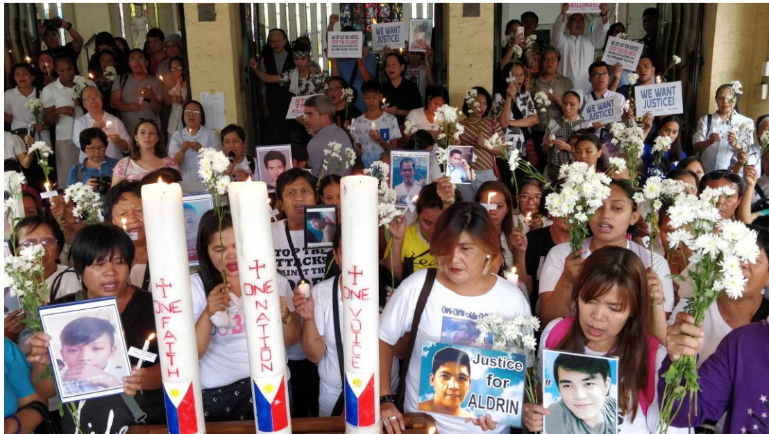
Families of victims of extrajudicial executions gather at the Shrine of Jesus Parish, 15 March 2019, Quezon City, Metro Manila. They were holding a prayer and rally demanding justice for the victims.