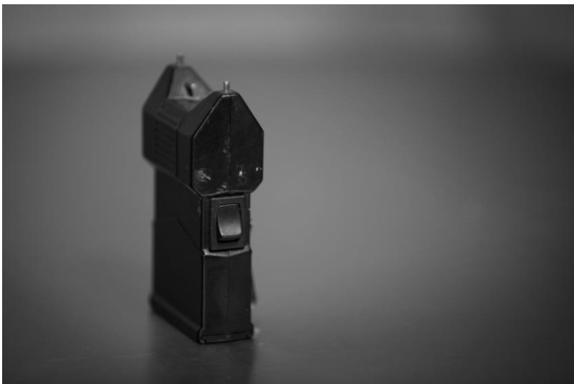
Fig. 15 – A female "asset" gave Althea electric shocks for about an hour and a half (reconstruction based on testimony).

Althea recalled that, at the DEU, the female "asset" hit her on the back and pulled her hair. Althea said the woman had an electrical device in her hand and used it to give her electric shocks for about an hour and a half until it seemed to run out of battery. Althea described her experience to Amnesty International: "Every time she used it, I would fall and I couldn't breathe. She used it on my back – the pain was intolerable – like an electric shock."