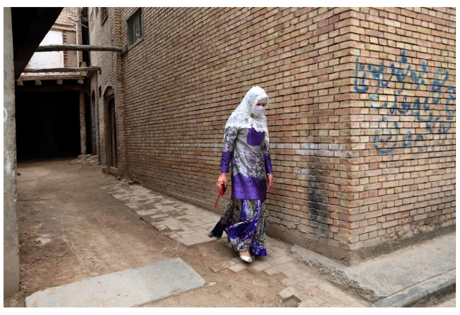
Undated photo of Uighur woman walking through an alley in the western city of Kashgar. Under the "Regulation on De-Extremification" implemented in the XUAR since March 2017, the wearing of traditional veils and headscarves can lead to punishment.

In fact, ethnic tensions in the XUAR are nothing new. For decades, many Uighurs have felt resentment towards what they see as systematic ethnic and religious discrimination in the XUAR. Promised broad autonomy under China's laws and policies, many Uighurs and other ethnic minority groups instead experience social and economic disadvantage. Though they acknowledge that government policies have led to economic development of the XUAR, they see many of the benefits of growth either flowing out of the region or going to the many Han immigrants who have been encouraged to settle in the region over the years.<sup>14</sup> On top of this is a sense of cultural alienation, as they are repeatedly being told that their traditions are backwards compared with the modernity of Chinese culture and their children receive a "bilingual education" that focuses on teaching Chinese language and Han culture at the expense of their own language and traditions.<sup>15</sup>