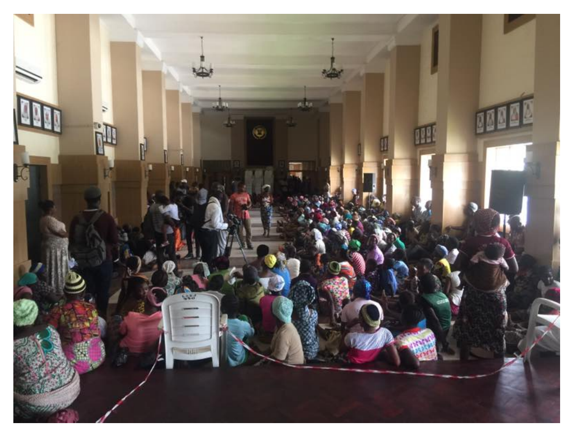
Some Otodo-Gbame evictees awaiting the court decision on the contempt proceedings filed against Lagos state authorities. 12 April 2017

On 21 June 2017, the Court found in favour of the applicants and held that evictions without resettlement are unconstitutional, while also restraining the government from further forced evictions and ordering it to consult with affected residents and evictees with a view to resettling them within the state. <sup>156</sup> On 28 June 2017, Lagos State announced that it had filed an appeal against this decision which at the time of writing is still pending. <sup>157</sup>