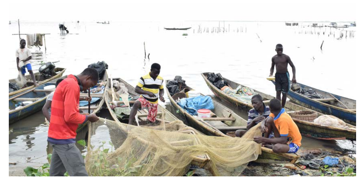
Fisher people evicted from Ilubirin. 26 October 2016

The CESCR has noted that the right to work