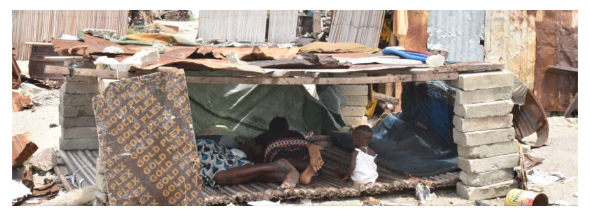
Two women and their two babies who lost their homes in Otodo-Gbame, during forced evictions in November 2016 and March 2017, take refuge under a makeshift structure. 5 April 2017