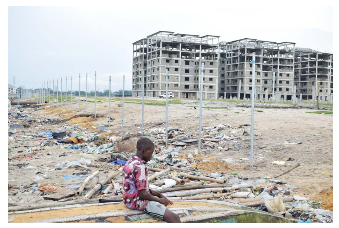
A boy sits on a canoe in the place where his home used to be in Ilubirin community. All the structures in this community were demolished on 15 October 2016. 26 October 2016