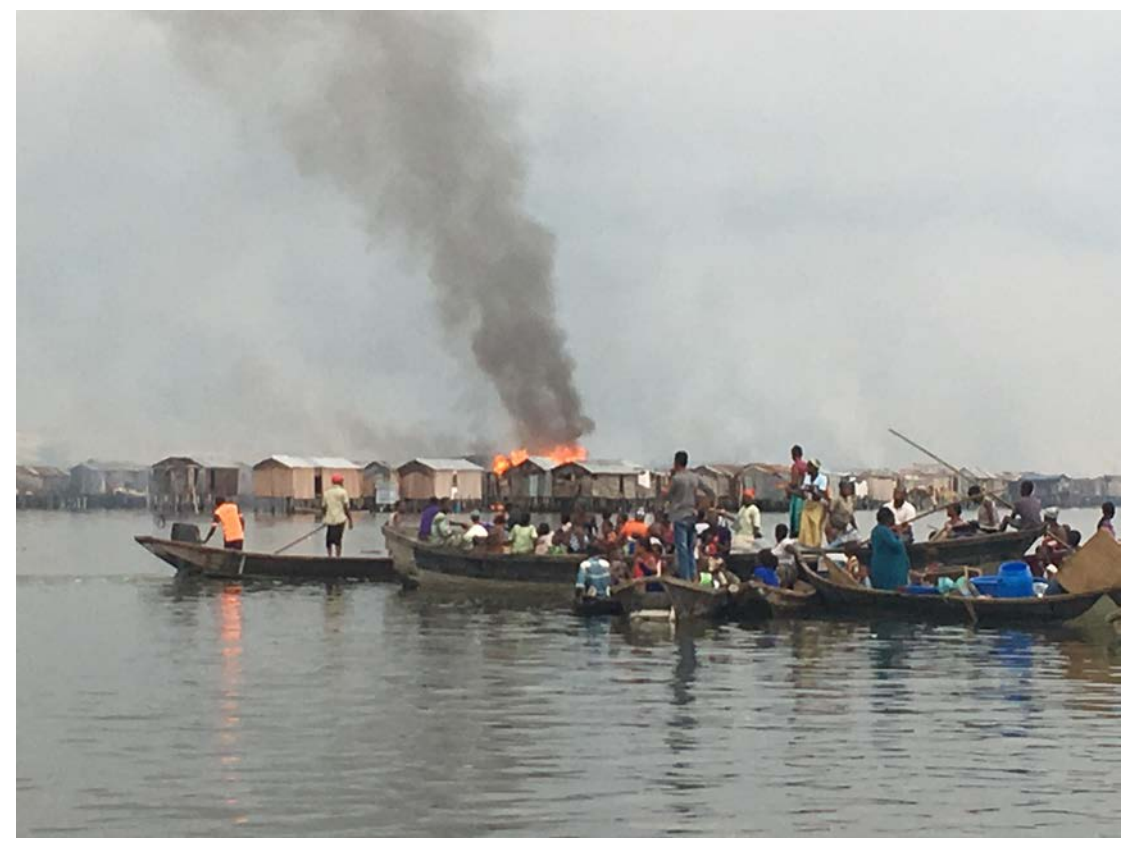
Otodo-Gbame evictees stranded on the Lagoon, watching their homes burn during the forced eviction on 9 April 2017.