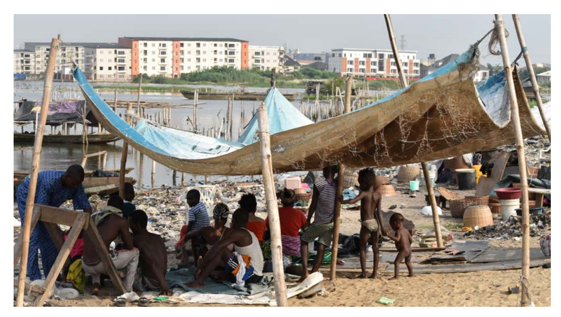
Ilubirin evictees sitting under a flimsy structure. They told Amnesty International that they also sleep here. 14 December 2016.