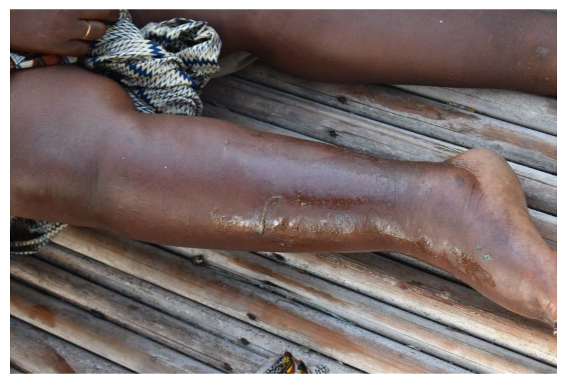
A woman's injured and swollen leg. She told Amnesty International that she sustained the injury when a police officer threw a stick at her leg during the protest against the demolition of Otodo-Gbame on 26 March 2017.

"police beat me with batons on my legs and back. I was beaten till I could no longer walk. The police carried me into their van and took me away. When I was released later in the evening, I still could not walk, someone carried me on his back from the car to my place." He was walking with the aid of a stick at the time of the interview two days later.<sup>206</sup>