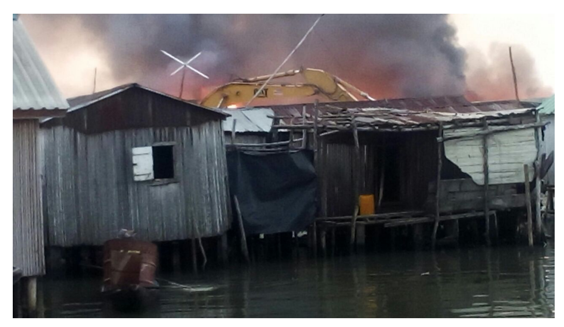
Bulldozer and fire demolishing homes in Otodo-Gbame on 10 November 2016.

Amnesty International saw three videos and 38 photos taken by residents and eyewitnesses on 9 and 10 November 2016 which showed burnt property, burning structures as well as evictees stranded with their salvaged possessions in canoes on the lagoon. One of the videos taken on the morning of Thursday 10 November, showed a bulldozer demolishing a house, fire and smoke could also be seen in the background, while evictees in canoes on the lagoon watched.<sup>82</sup>