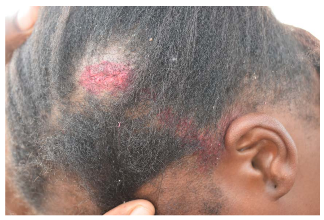
Head injury sustained by a woman resident. She told Amnesty International that a policeman threw a stone at her head on 26 March 207, during the protest against the demolition of Otodo-Gbame. 28 March 2017

Amnesty International documented 12 cases of assaults of residents by police officers. The majority of the assaulted residents said they were beaten, while a few others said objects were thrown at them, resulting in injuries. Such treatment amounts to excessive use of force which should be punishable as a criminal offence. The residents were protesting to prevent the demolition of their homes.