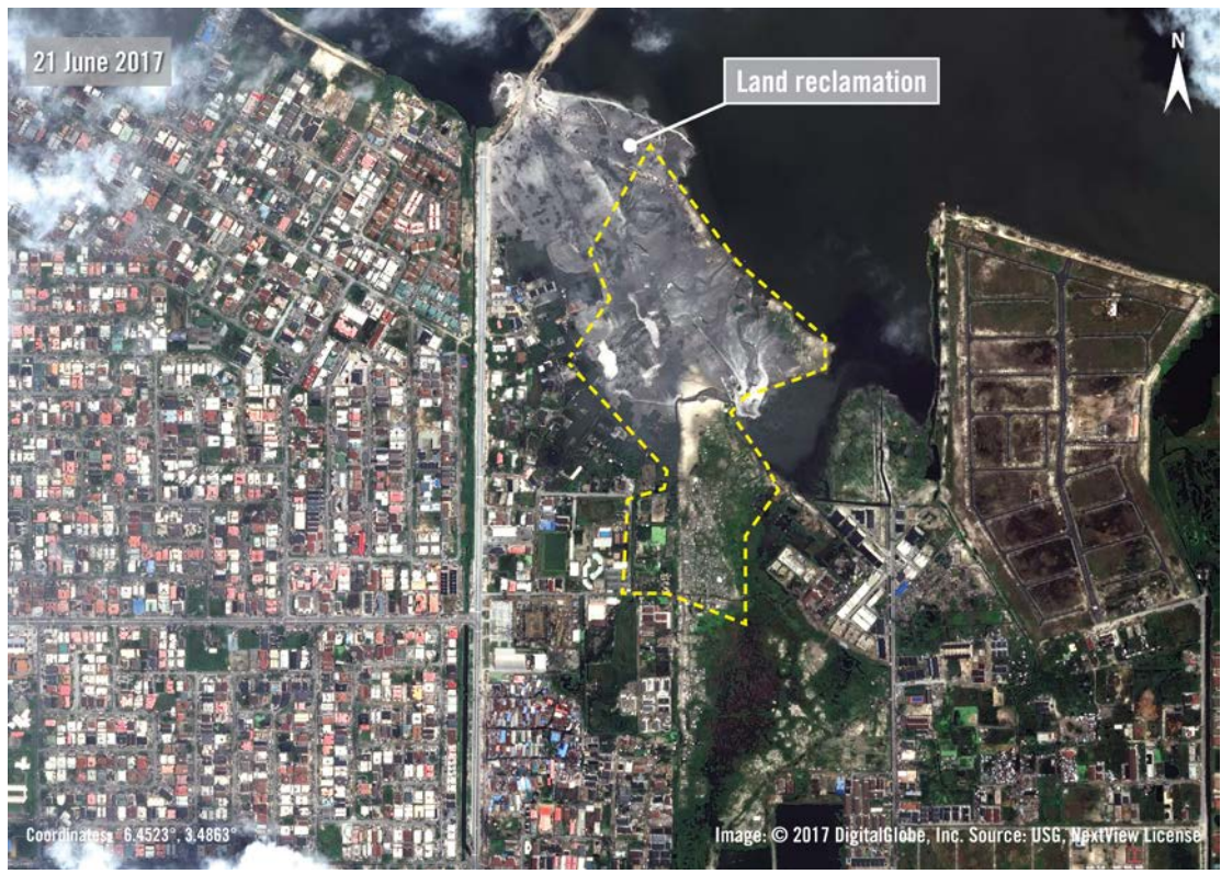
Satellite image of Otodo-Gbame after land reclamation exercise to expand the area for high-end real estate projects.