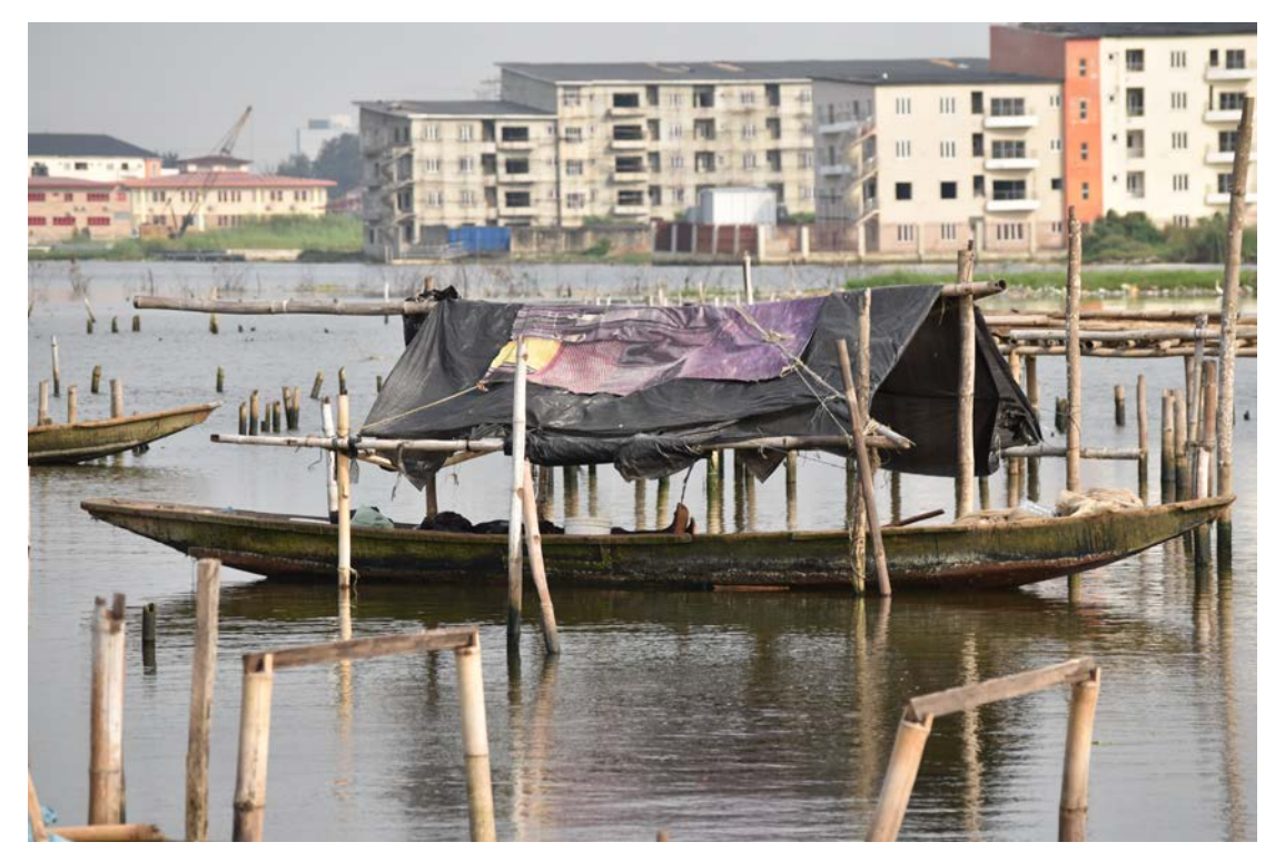
An Ilubirin evictee sleeping in a canoe with a tarpaulin roof. 14 December 2016

"Last night [25 October 2016], when we feared there might be a storm on the water, because of the very powerful wind, we had nowhere to run to, we were afraid the police would arrest us. The canoes we sleep in are small [and can easily capsize]." <sup>242</sup>