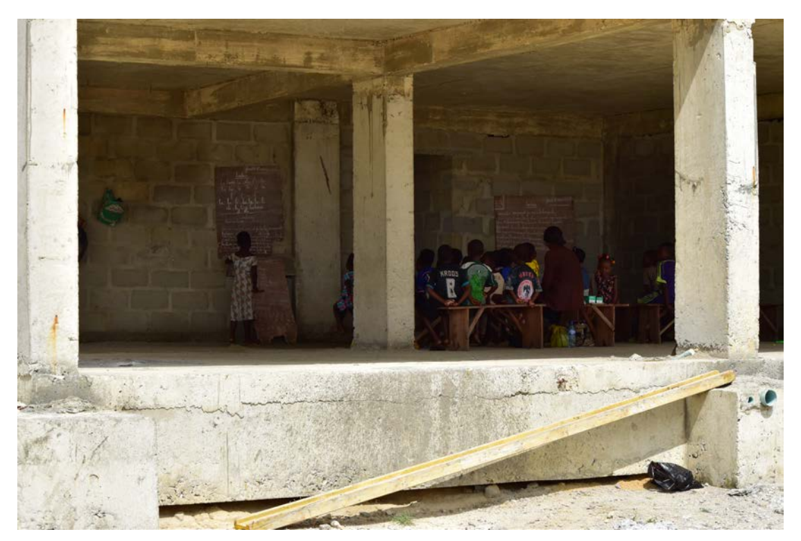
Ilubirin children taking lessons in one of the government's under-construction buildings. The classes moved here after the school it was demolished in November 2015. 19 May 2016