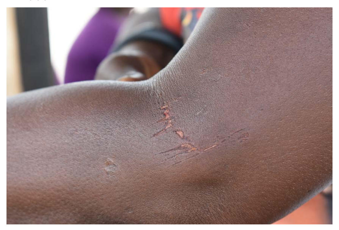
A woman's bruised elbow. She told Amnesty International that on 26 March 2017, she was beaten by police for protesting the demolition of her community. 28 March 2017.

"Police beat me with guns and sticks. There were many of them, one slapped me, another kicked me, another hit me with his gun butt. They tried to put me in their vehicle, and I resisted. They dragged me, I was crying, shouting, cursing them, so they finally left me. My whole body was aching, some parts were swollen." 204