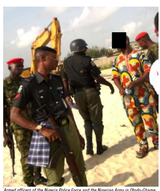
Armed officers of the Nigeria Police Force and the Nigerian Army in Otodo-Gbame during the forced eviction of 17 March 2017.

During the three forced evictions in Otodo-Gbame community on 9 to 11 November 2016, 17 and 21 March 2017, and 9 April 2017, the police appear to have played a leading role in chasing people out of their houses and in demolishing structures in the community, while also resorting to the unlawful use of force. Residents also reported that there were attacks on communities by armed men, with the police failing to intervene, and reports of armed men joining the police during forced evictions.