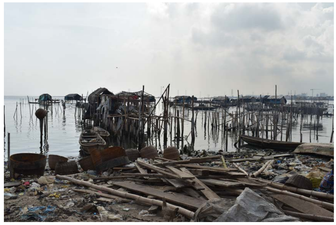
Some of the structures demolished during the forced eviction of 19 March 2016. 19 May 2016.