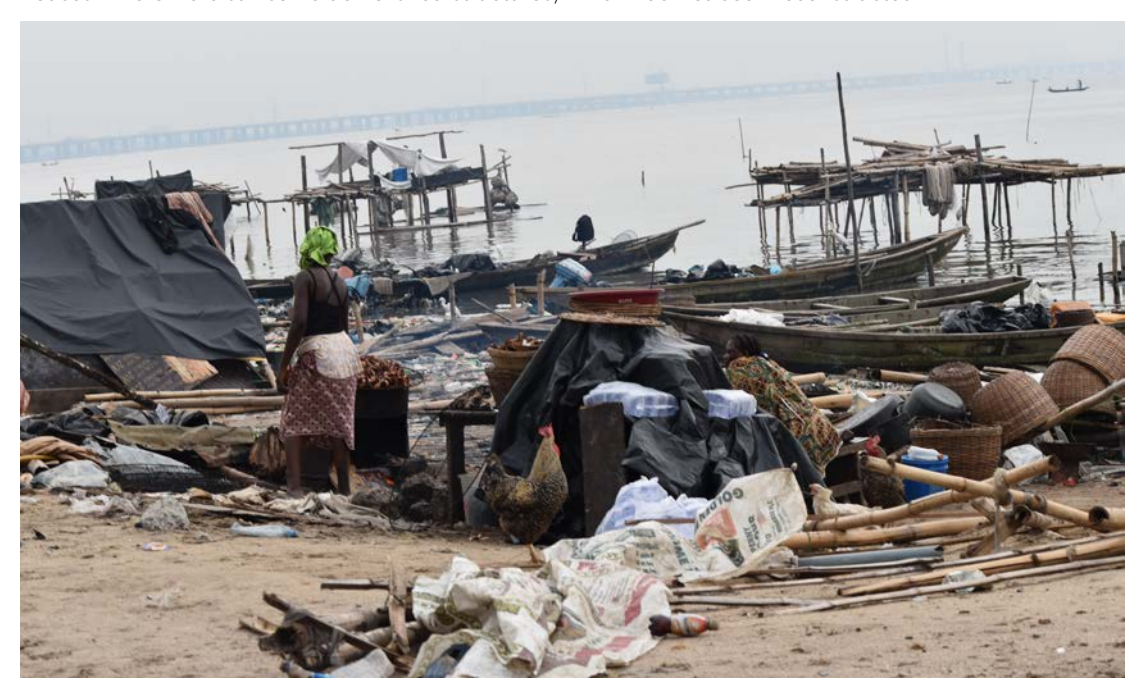
Ruins of demolished homes in Ilubirin, after the forced eviction of 26 September 2016. Evictees rebuilt some of their homes and continued to live in the area. 1 October 2016.

All five evictees interviewed by Amnesty International said that apart from this oral notice from KAI, no written notices were served. They further said that on eviction day, the Taskforce officials (another environmental agency, different agency for KAI) gave them one hour within which to move out their properties, and then demolished all their structures. When Amnesty International visited the community on 1 October 2016, researchers, observed that, as previously, the evictees had returned and rebuilt their houses. There were still some demolished structures, which had not been reconstructed.