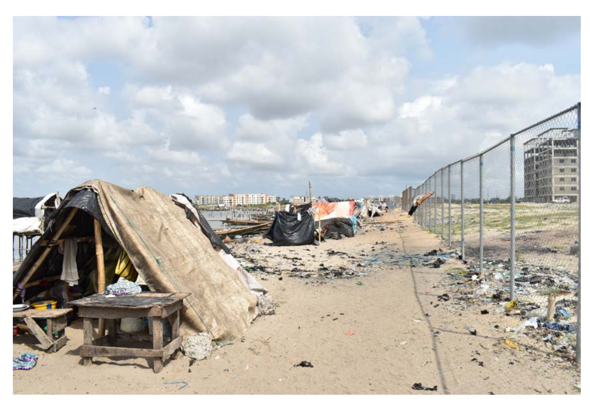
Five months after the October forced eviction, several llubirin evictees resettled at the edge of the lagoon, and just outside the fence constructed to keep them away from the land they occupied. 31 March 2017

On 31 March 2017, three residents told Amnesty International that those who returned to live near the shoreline had not been disturbed since the last eviction. But as the returned residents feared further evictions, they only built temporary structures.