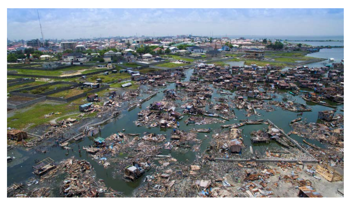
A section of Otodo-Gbame littered with demolition debris, while some houses remain intact. This picture was taken on 23 March 2017, after the forced evictions on 17 and 21 March 2017.