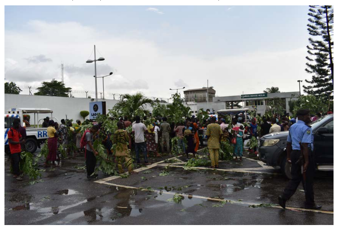
Some Otodo-Gbame evictees protesting against the forced evictions at the Governor's office, Ikeja, on 12 April 2017.

Again, on 12 April 2017, evictees staged a peaceful protest at the office of the Governor, demanding to be returned to their land. <sup>284</sup> They were met by the Commissioner for Special Duties and the Commissioner for Home Affairs, as well as the Special Adviser to the Governor on Civic Engagement, who promised to relay their message to the Governor and scheduled a subsequent meeting with community representatives for 18 April 2017. At the meeting, government representatives <sup>285</sup> requested that the community representatives should provide a list of all affected residents in order to enable the government to provide "special assistance" to them. When asked what this assistance would entail, government representative refrained from defining it, but specified that it was not in relation to resettlement or compensation, since there was a case pending in court. Being unsatisfied with the lack of clear commitments from the government, evictees embarked on another peaceful protest at the Governor's office on 19 April 2017. <sup>286</sup>