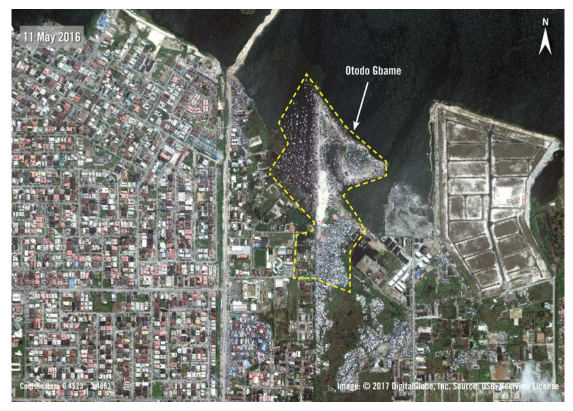
Satellite image of Otodo-Gbame taken on 11 May 2016.

The Otodo-Gbame community, home to at least 30,000people, <sup>59</sup> was an informal settlement at the edge of the lagoon, in the Lekki area of Lagos. Evictees told Amnesty International that the community had existed for over a century. The oldest person interviewed by Amnesty International was 79 years old, and said she was born in the community. <sup>60</sup>