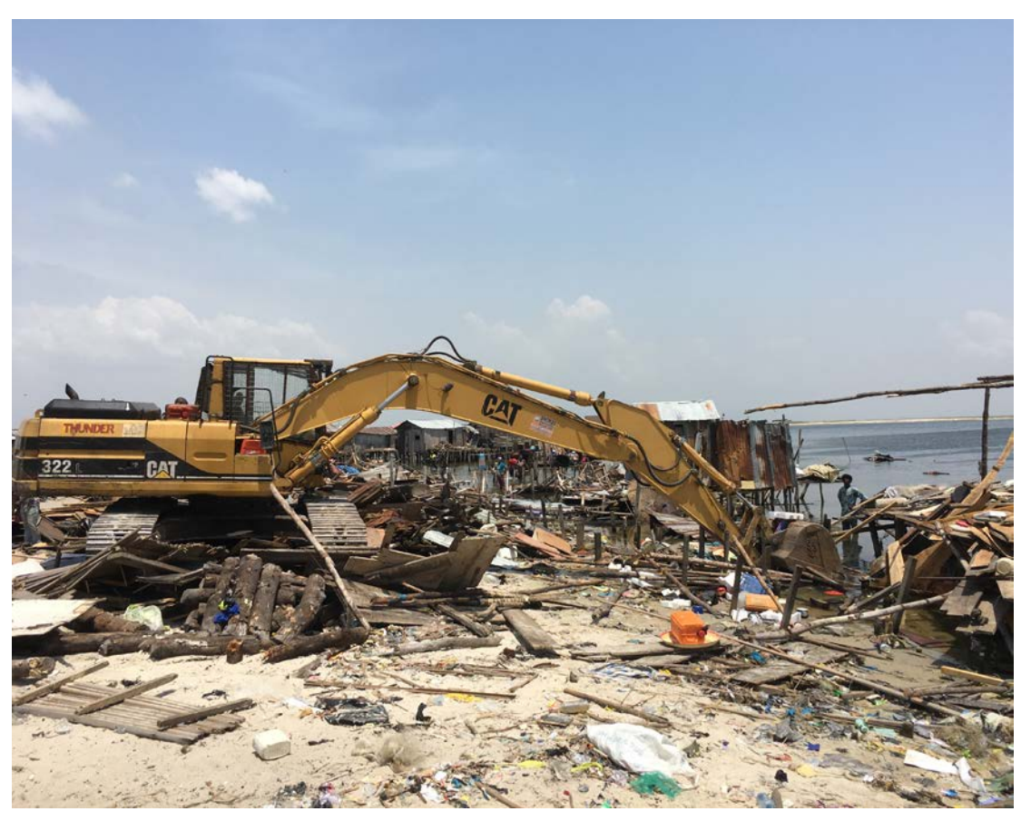
A bulldozer demolishing homes in Otodo-Gbame, during a forced eviction on 17 March 2017.