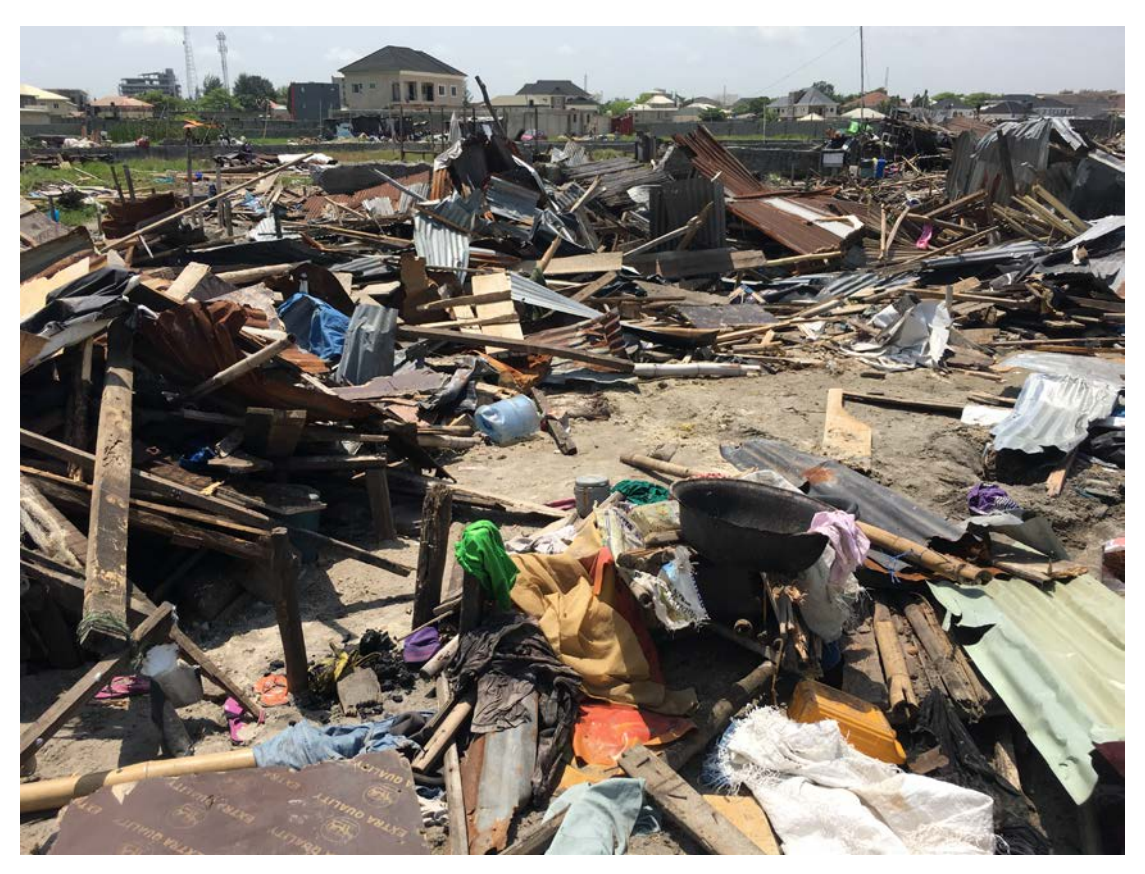
Aftermath of the forced eviction in Otodo-Gbame community, on 17 March 2017.

Four months later, without any prior notice or consultation, on 17 March 2017, the Otodo-Gbame residents were again forcibly evicted. Amnesty International interviewed 18 evictees who all said that their homes were demolished with bulldozers accompanied by police, army and other men armed with machetes, axes and guns. They further said that the police were shooting live ammunition and teargas to chase residents away.<sup>88</sup>