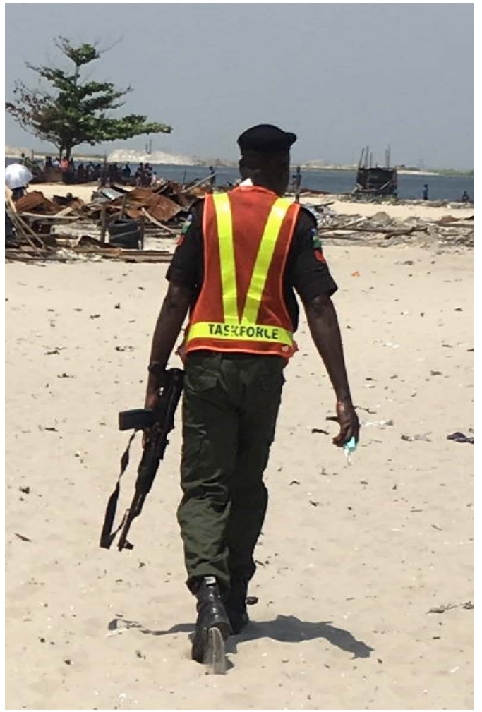
A Police officer wearing a Taskforce vest in Otodo-Gbame community, during the forced eviction of 17 March 2017

Some of the police officers who took part in those forced evictions arrived in the community as part of the Lagos State Taskforce team. <sup>169</sup> However, at an earlier meeting with Amnesty International on 17 February 2016, the Lagos State Commissioner of Police had told Amnesty International that the police do not carry out evictions. He stated that their duty was only to provide security and ensure that there was no breach of peace or violations of rights during evictions. <sup>170</sup>