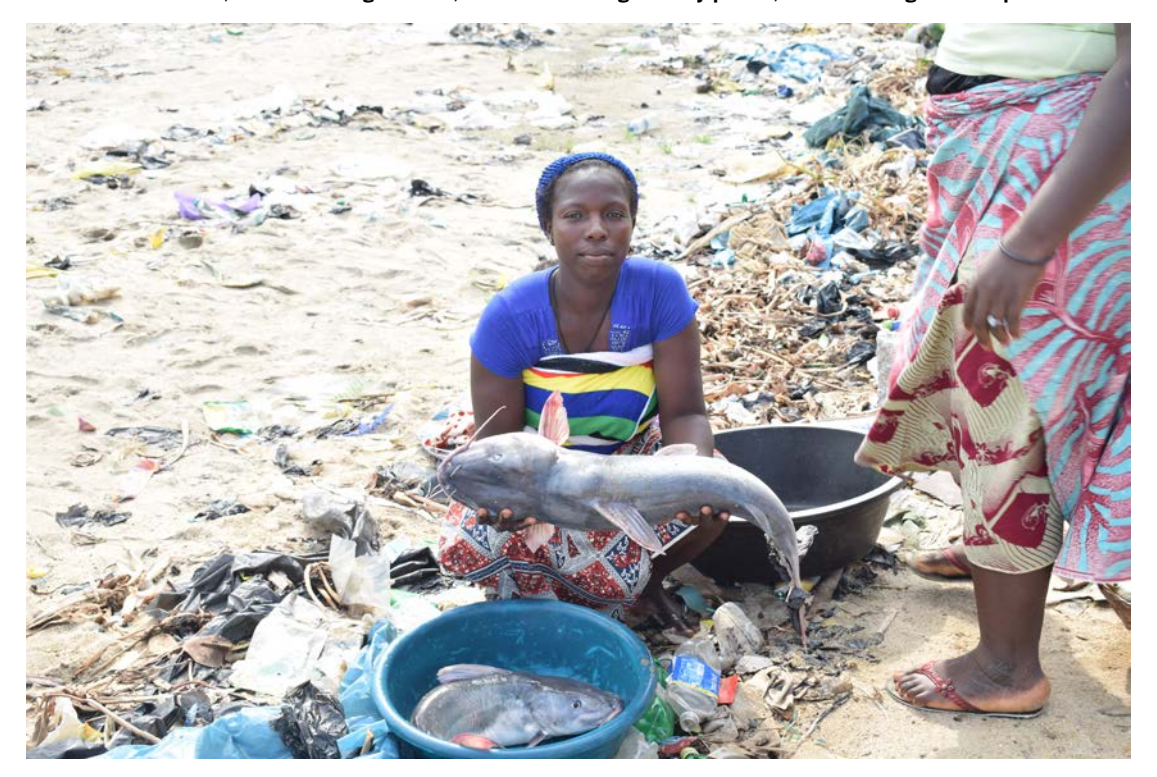
A woman forcibly evicted from Ilubirin displays her fish for sale. 26 October 2016

"...we would display the fish on land and people would buy, our wives would also start smoking the fish. When our wives are done smoking, people come from upland and faraway places to buy. But now, we don't have the space to do all that, because the police don't give us the chance. To be able to do our business [as usual], we need to have space to smoke the fish on land, we cannot smoke the fish in the canoes. Now, when we bring the fish, we sell them at giveaway prices, so we no longer make profit." <sup>253</sup>