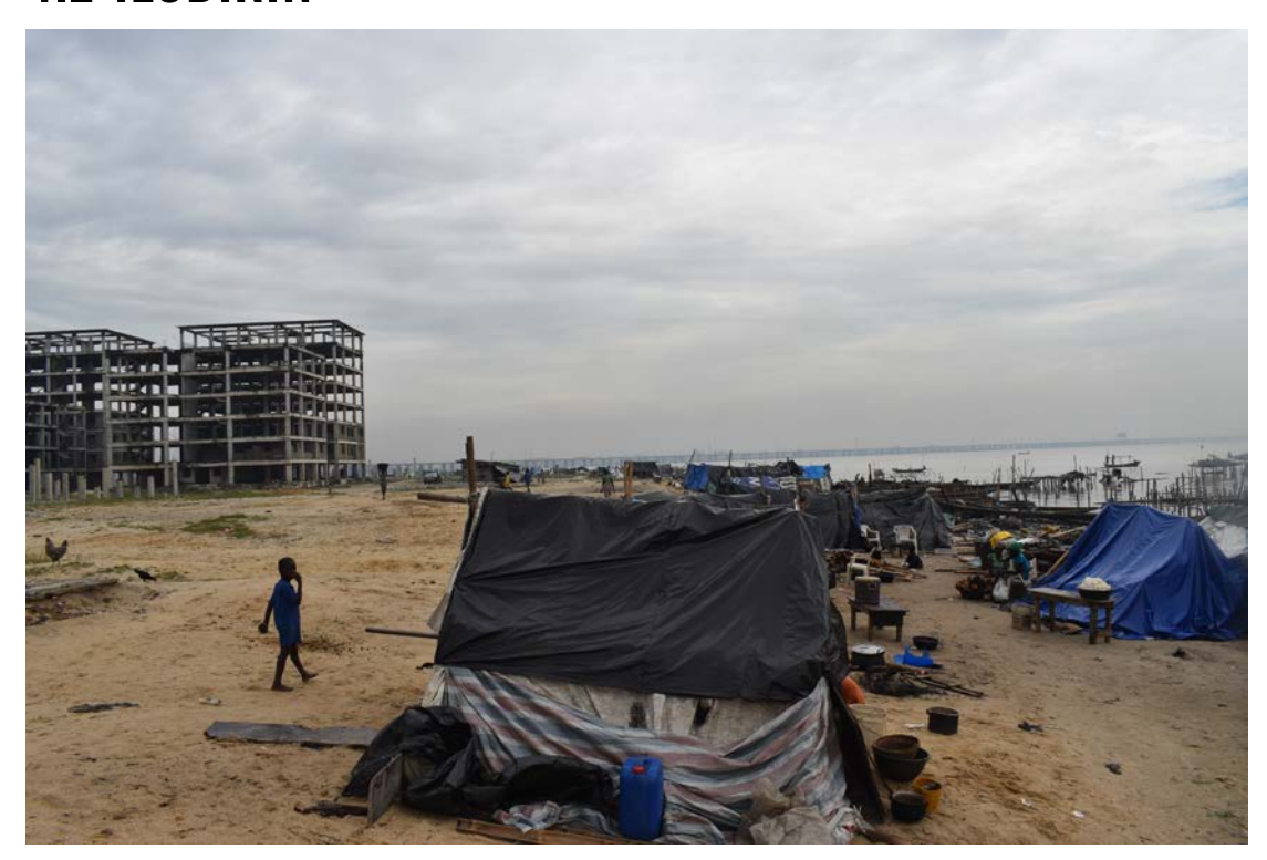
A section of Ilubirin community, with the under-construction government real estate project in the background. 1 October 2016.

The Ilubirin fishing community is home to hundreds of mainly fishers and their families. It is located at the edge of the Lagos lagoon near high-end business districts, in Lagos Island. Structures in the community were constructed mostly with plastic sheets and sticks. <sup>107</sup> The government did not provide any services or infrastructure, such as sewage disposal, potable drinking water and electricity, to Ilubirin. The residents provided electricity for themselves (using portable generators). They used the lagoon for sewage disposal and purchased drinking water. <sup>108</sup> By 17 November 2015, the community had an estimated 823 residents <sup>109</sup> and 222 structures (168 residences, 41 businesses, 10 bath houses, 1 school and 2 churches). <sup>110</sup>