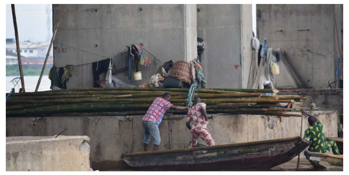
Ilubirin evictees living under a bridge in Lagos. 8 July 2017

"We are many living under the bridge, we are staying under five pillars, and there are about 20 people under each pillar. Women cannot stay here, that is why I asked my wives and children to go to Sabo Koji [Amuwo-Odofin Local Government Area of Lagos]".<sup>243</sup>