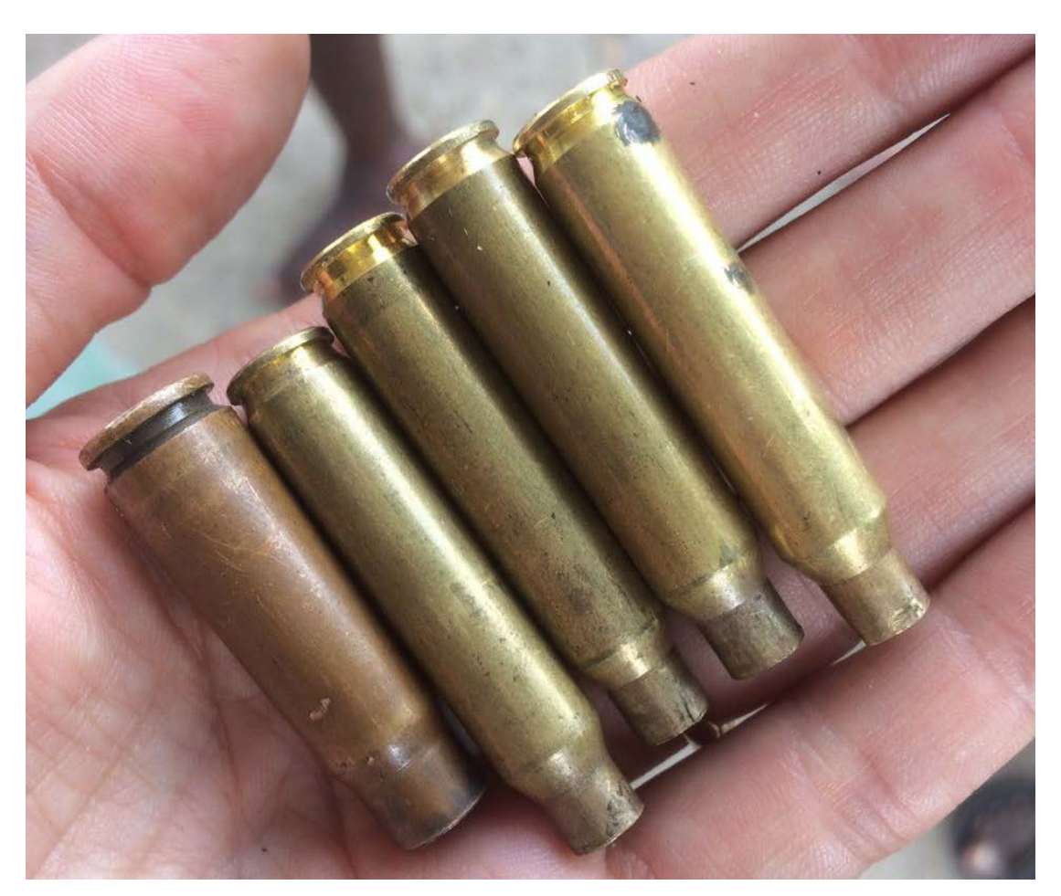
Bullet casings found in Otodo-Gbame on Sunday, 26 March 2017

Under the UN Code of Conduct for Law Enforcement Officials (Article 3) and the UN Basic Principles on the Use of Force and Firearms by Law Enforcement Officials (Basic Principles on Use of Force), police must seek to avoid the use of force, and far as possible apply non-violent means before resorting to the use of force, which they may use only if strictly necessary and to the extent required for the performance of their duty. Basic Principle 9, which reflects the international law obligation to respect and protect the right to life, provides that police must not use lethal force (firearms) unless it is strictly necessary to defend themselves or others against the imminent threat of death or serious injury or to prevent a grave threat to life. Firearms should never be used to disperse people and indiscriminate firing into a crowd is always unlawful. <sup>183</sup> Firearms must never be used as a tactical tool to chase people out of their houses during demolitions. They may only be used to save another life in line with Basic Principle 9. When policing crowds, teargas may only be used for the purpose of dispersing the crowd in a situation of more generalized violence.