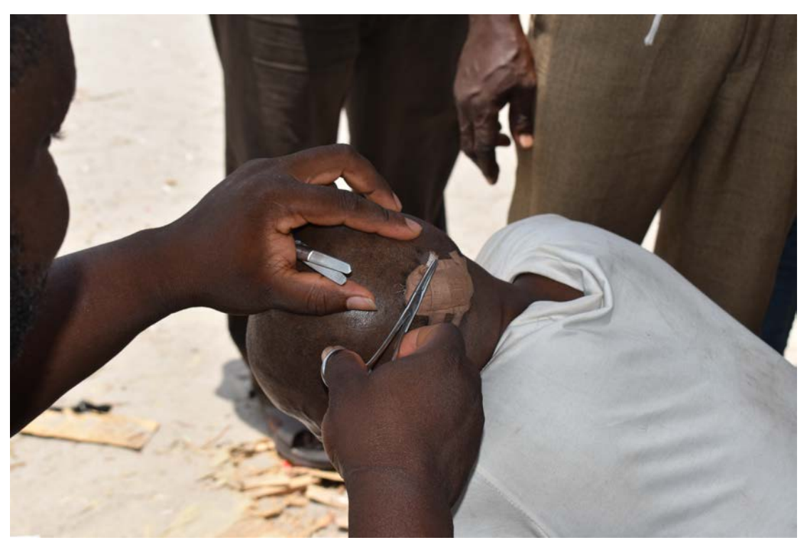
A volunteer aid worker dressing a head injury of a woman in Otodo-Gbame Community. 28 March 2017 Amnesty International Nigeria

A volunteer aid worker provided medical aid to Otodo-Gbame evictees who sustained injuries during the evictions and attacks because the community's hospital was demolished in November 2016, depriving them of access to healthcare. 303