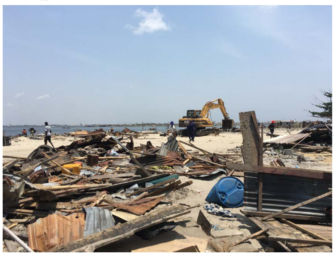
A bulldozer demolishing homes in Otodo-Gbame on 17 March 2017.

State Environmental Sanitation Enforcement Agency (Taskforce), army and other armed men, returned with a swamp buggy, to demolish more structures on the water. 93