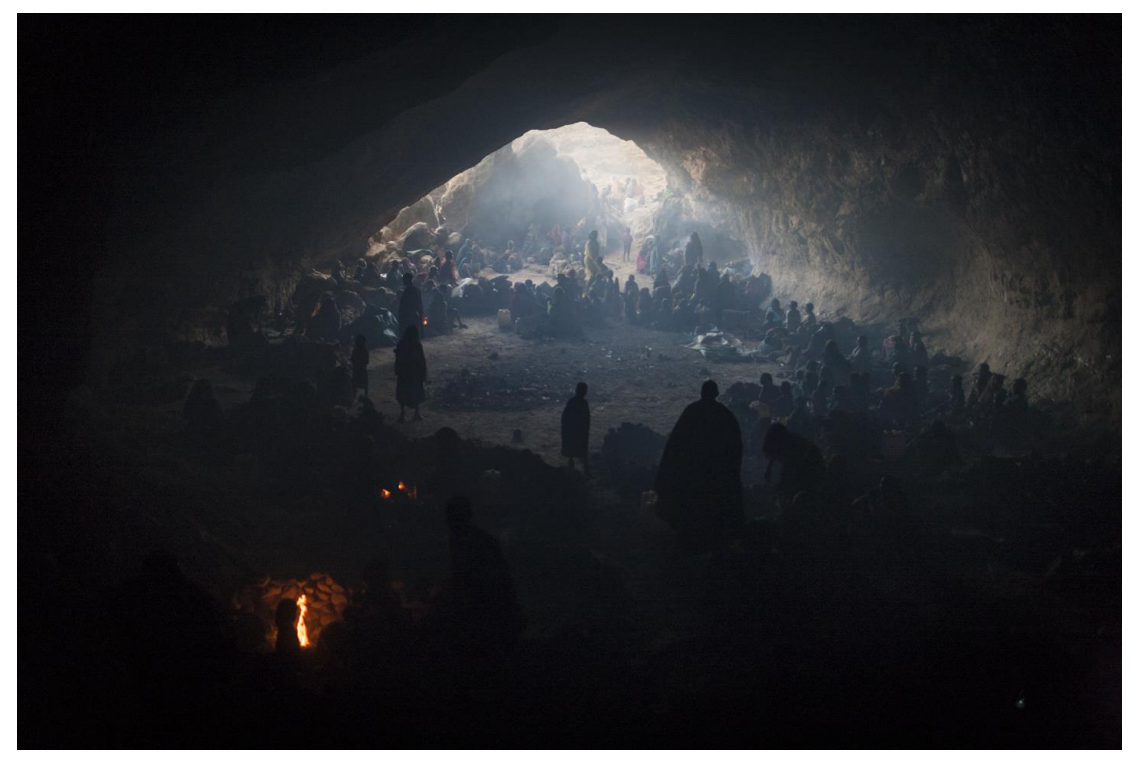
Hundreds of women and children seek shelter in a cave from the bombing by government forces outside of the town of Sarong in Jebel Marra in Central Darfur, Sudan, March, 2015.