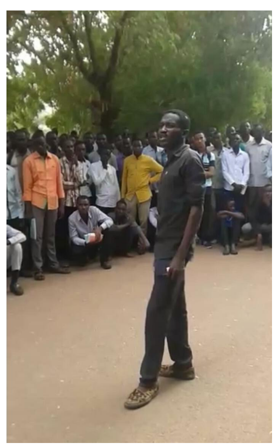
Darfur Students' Association public forum discussing tuition fees in October 2015 at the Holy Quran University

The Darfur Students' Association issued a statement rejecting the new policy and argued it was a U-turn from the prior commitment made to exempt Darfuri students from paying fees. It also stated it would organize a sit-in protest until the university reinstated the fee waiver. The peaceful sit-in started on 13 October 2015 around 8am, at the university's Al Thoura Block 1 Campus. About 500 students participated. Members of the Darfur Students' Association distributed a statement and delivered some speeches objecting to the imposition of tuition fees. Around noon, the sit-in was attacked by 70 to 100 individuals composed of ruling party affiliated students, the police and NISS agents.79 A member of the Darfur Students' Association told Amnesty International: