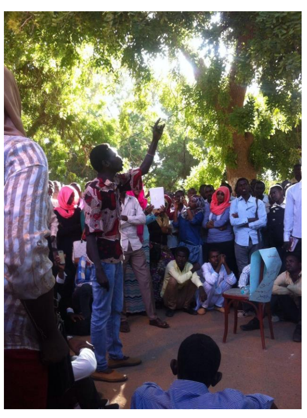
Student forum at the University of Khartoum to address attacks on Darfuri Students, 10 December 2015.

However, in its efforts to dominate the political sphere since 1989, the regime of the current ruling party has gradually dismissed thousands of civil servants, including teachers, judges, engineers, medical doctors, university professors and army officers. 48 Sudanese universities were not spared in this quest for domination. Today, all university Chancellors are appointed by the President<sup>49</sup>, assisting in the transformation of these public institutions into political institutions and sacrificing academic independence. Student organizations now mirror Sudan's political landscape, in particular the ideological divide between Islamists and secular liberals. Violent clashes between student organizations have taken place intermittently over the past 48 years for a variety of reasons. The first recorded violent clash took place in 1968 between