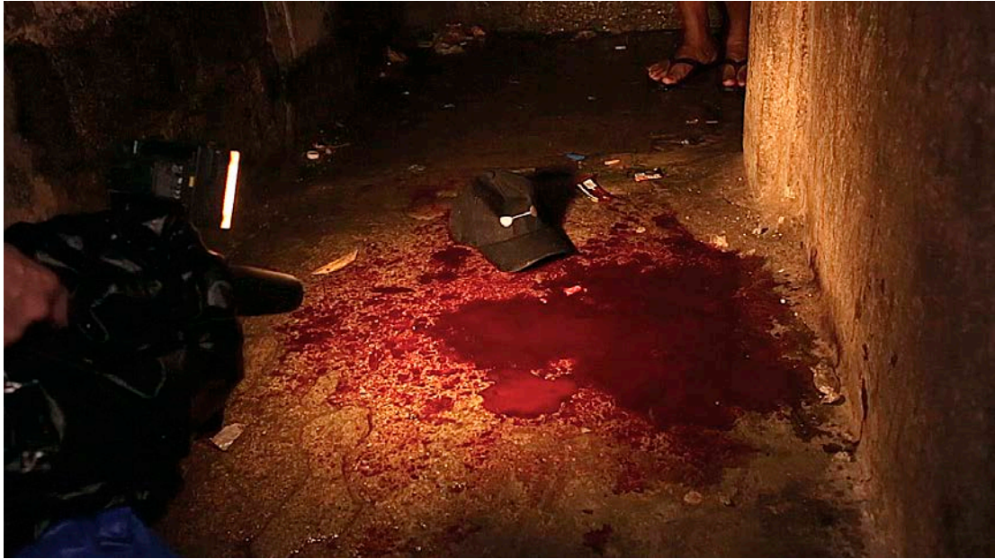
A pool of blood is filmed by a cameraman following a killing on 12 December 2016, Caloocan City, Metro Manila. The killing in a police “buy-bust” operation was one of two cases documented by Amnesty International delegates observing journalists’ night-shift coverage of police activities. Screenshot, © Amnesty International (photographer Alyx Ayn Arumpac)

Of the 33 drug-related killings documented by Amnesty International, 20 occurred during formal police operations. The vast majority appear to have been extrajudicial executions.