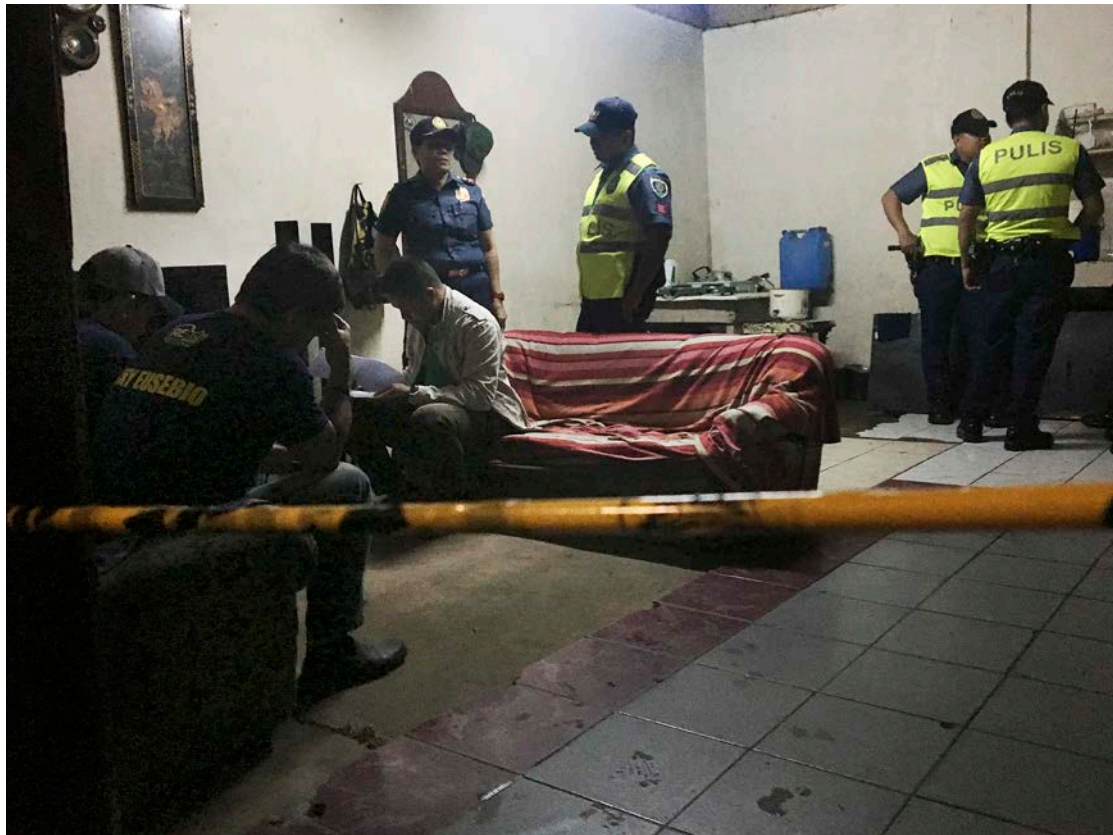
Policemen wait on the ground floor of a house where four people were killed by unknown armed persons in an alleged “drug den,” 12 December 2016, Pasig City, Metro Manila. Crime scene investigators had not arrived yet to work the case—one of two incidents documented by Amnesty International delegates observing journalists’ night-shift coverage of police activities.

Tokhang, Ampo-an had surrendered as a user to the Eastern Police Station. A family member told Amnesty International, “People are being killed like chickens now. You just cut their throat and let them die.” 213