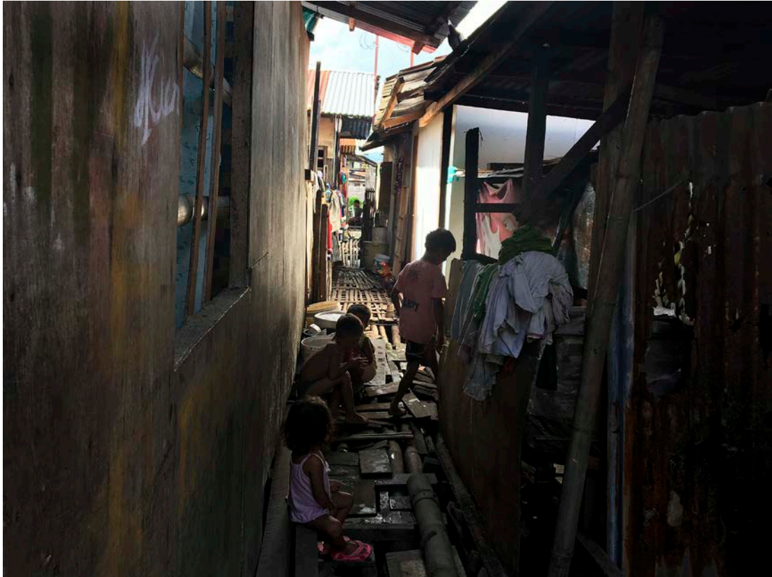
Children play, 8 December 2016, in a floating slum (exact location withheld) where one of the cases of killings by police documented by Amnesty International in Cebu Province took place. Many of the people who have been targeted in the anti-drugs campaign are poor.