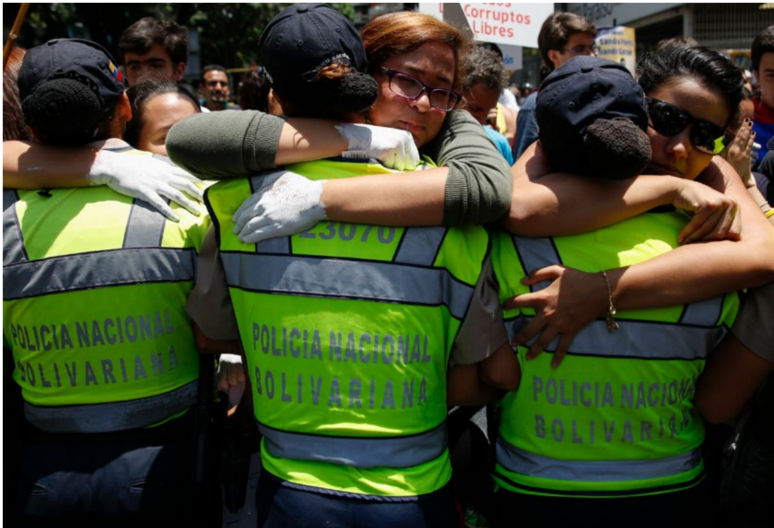
Anti-government demonstrators embrace riot police during a protest against Venezuelan President Nicolas Maduro's government in Caracas May 22, 2014.

This however does not mean that all police who personally disagree with the work of human rights defenders will consequently fail in their duty to protect them. It is here important to consider the level of professionalism within the police force and how well the police institution as such is functioning, to understand to what extent personal opinions may or may not interfere with police fulfilling their duties. Human rights defenders need furthermore to distinguish between individual officers displaying a negative or indifferent attitude and generalised problems emanating from the police institution as such.