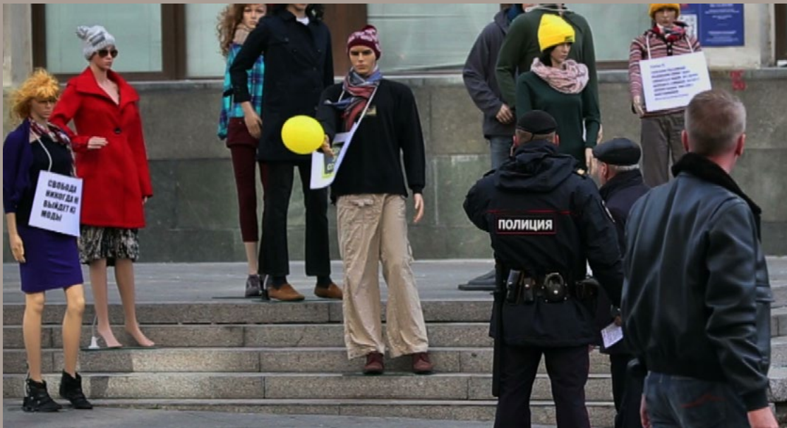
Mannequin Demonstration in Russia, still image from Amnesty International's film 'Don't be a Dummy' - Russia Freedom of Expression Action, 2015.

In 2014, Amnesty International staged a one-picket protest and additionally put up placard-holding mannequins, to highlight the prohibition of peaceful street protest in Russia without express prior permission from the government. 18