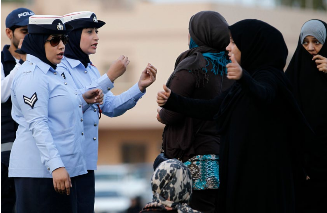
Community police officers warn anti-government protesters to leave a roundabout on the main highway of Budaiya, west of Manama, March 26, 2012.

As their job title indicates, law enforcement officials are supposed to enforce the law and it is important to know what obligations the law imposes on them. As long as human rights defenders abide by the law, police will not have a (lawful) reason to interfere with their activities or intervene against them. Accordingly, as a general rule and as far as possible, it will be in the interest of human rights defenders to avoid breaching domestic legislation when carrying out their work. This requires a good understanding of the laws that directly or indirectly impact them and their work as well as the legal framework governing police actions.