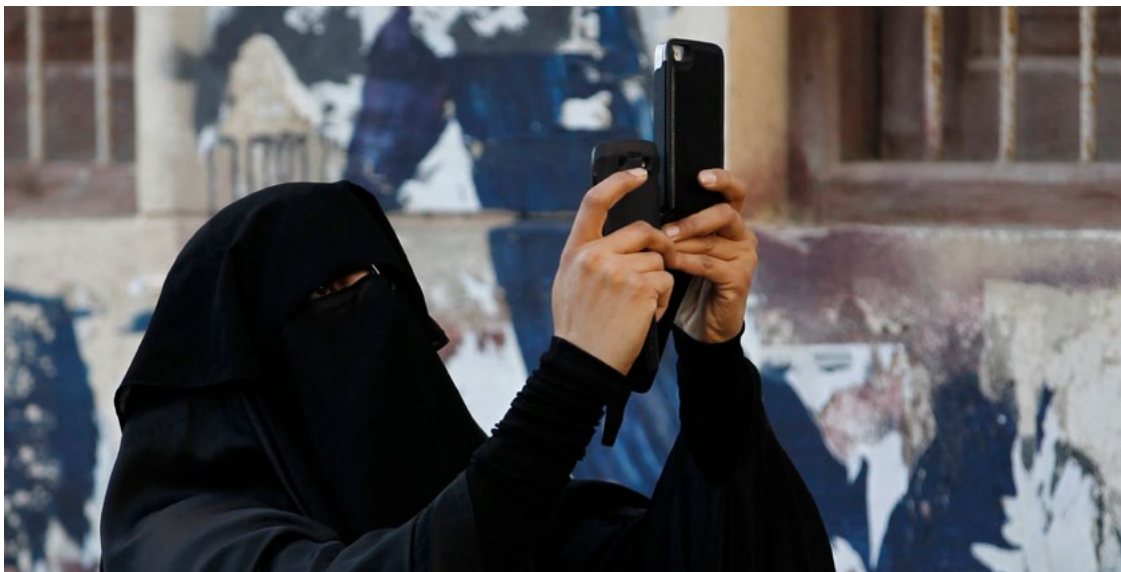
A protester uses a mobile device to take a video of an anti-government protest in Manama (Bahrain), December 17, 2012.

Knowledge and the ability to apply international human rights law and policing standards in relation to public assemblies should also help to assess police behaviour and when possible to call on police to respect them: In the policing of assemblies, law enforcement officials should facilitate the holding of assemblies and this includes if assemblies are considered unlawful under domestic legislation; they should seek to solve problems through communication, de-escalation and peaceful settlement of conflicts, and they should distinguish between participants who are engaged in violent acts and those who are not and who keep their right to freedom of peaceful assembly despite the violent behaviour of others. In that regard a range of means and methods have been developed by law enforcement agencies around the world to ensure that assemblies take place without problems including in situations of political or other tensions. 7 When organising or observing assemblies, these examples may help human rights defenders in analysing to what extent police are complying with their responsibilities under international human rights law and standards and help them in discussing problems (as well as possible solutions) with police.