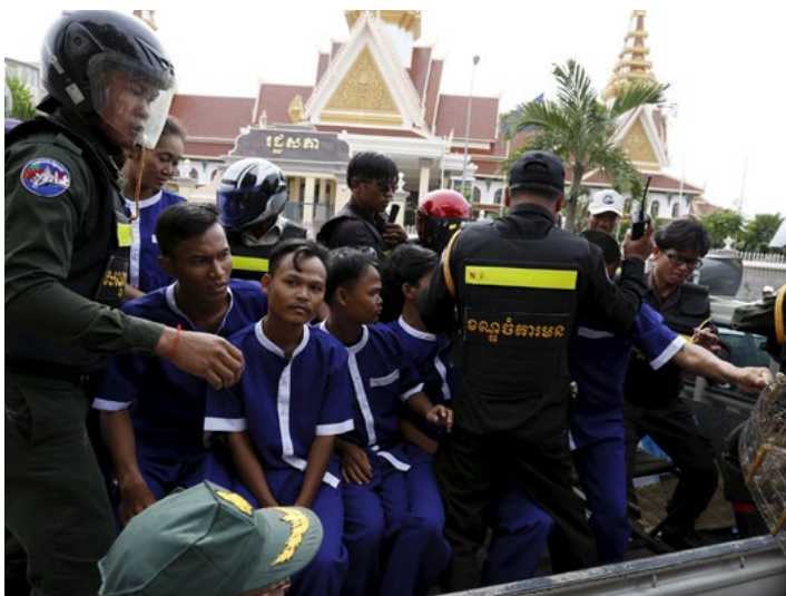
Police officers detain protesters who tied themselves with long chains to their feet and wore prison uniforms on a police truck during a protest in front of the Cambodia National Assembly in Phnom Penh, July 26, 2015.

The “Guia Como Filmar a Violência Policial em Protestos” (Guide to Filming Police Violence during Protests) by the NGO Article 19 serves as a reference for human rights defenders recording the police during assemblies in Brazil. Besides offering advice on how to film in order for the material to be most effective, the guide also answers a number of questions about what is allowed, with reference to the applicable legal provisions. It further provides advice on how to react when confronted with unlawful police orders. When prompted to stop filming or to delete a recording, for example, the guide suggests that informing the police officer that the images are being streamed can help to prevent unlawful conduct. 11