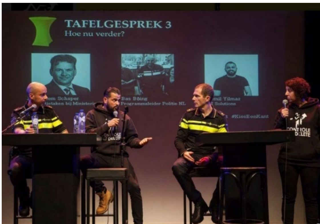
Discussion between police and members of Controle Alt Delete, an initiative to stop ethnic profiling in the Netherlands, at the Controle Alt Delete #5 event at Amsterdam Melkweg (The Netherlands), 11 December 2017.

Even if the general relationship with police is difficult, entering a conversation with a hostile attitude can only be counter-productive. Even though it is the interest of human rights defenders to advocate for victims of human rights violations, defenders need to avoid giving the impression to police that they consider that the victim is always right, and the police are always wrong. Rather, they will be more likely to have an effective dialogue if they demonstrate their readiness to listen to police and try to understand their point of view as well as the challenges of police work.