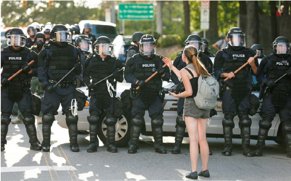
A counter-protester talks to police during a gathering after a report of a rally by white nationalists was disseminated over social media, in Durham, North Carolina (U.S.), August 18, 2017.

However, given that it has indiscriminate effects on violent and peaceful protestors alike, as well as on bystanders, police should only use this weapon when violence has become so widespread that it is not possible to deal with violent individuals any more. It should only be used for the purpose of dispersing the crowd, and therefore should not be used in settings where protestors do not have the possibility to escape. And in no circumstances should tear gas canisters be directly fired at persons. 27 These are the elements which – if not respected by police – provide sufficient opportunities for human rights defenders to appropriately criticise a police intervention in the course of an assembly without resorting to legally incorrect statements.