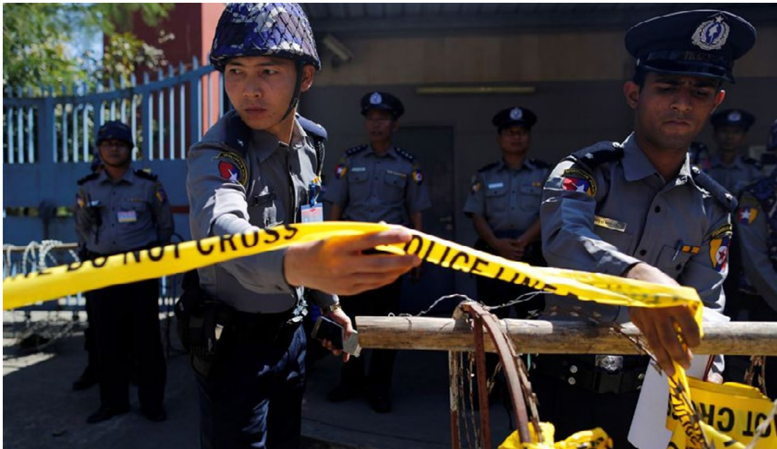
Police stand guard during a protest by Buddhist monks and activists from Myanmar in front of the Thai embassy in Yangon, Myanmar, against the Thai military government invoking a special emergency law to let authorities search the Dhammakaya Temple in an attempt to arrest a former abbot, February 24, 2017.