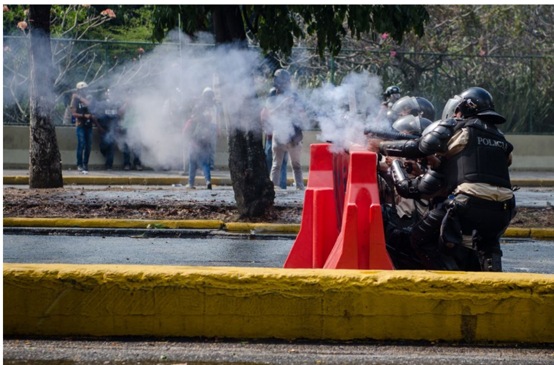
Police firing tear gas to disperse a student march to the Ombudsman office in Caracas (Venezuela), 2014.

The Organization for Security and Co-operation in Europe, Office for Democratic Institutions and Human Rights (OSCE/ODIHR) has developed a very useful Handbook on Monitoring Freedom of Assembly. 28 In some aspects it is shaped to the specific monitoring activities which OSCE itself regularly conducts in Member States. However, in many other respects its guidance is also relevant to other human rights defenders who are monitoring assemblies. Among other things, it recommends that “[m]onitors should not offer any formal opinions to the media or other agencies during an assembly. Any comments should be limited to identification of their role as independent human rights monitors”.