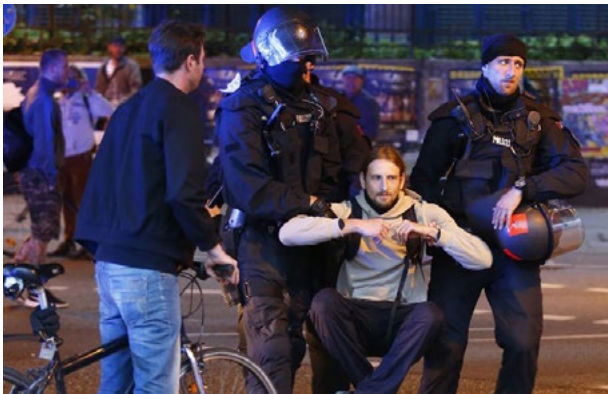
German riot police carry a protestor near Schanzenviertel ahead of the G20 summit in Hamburg (Germany), July 4, 2017.

In many countries, it will however be more likely that the police disperse the assembly, especially in contexts where there is a repressive political and legal climate and where it was not “authorised” to take place. In that case, human rights defenders need to consider how likely the police are to resort to force in order to achieve the dispersal and what kind of force they are likely to apply.