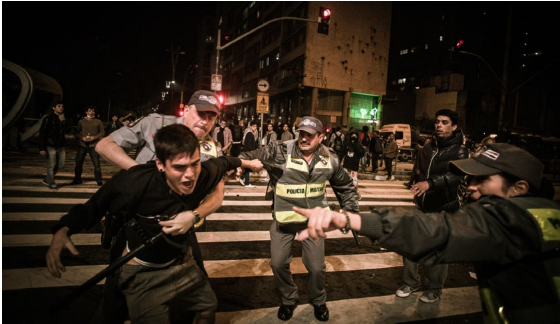
Police officers detaining a protester in São Paulo (Brazil) on June 18, 2013.

If police use force against human rights defenders during assemblies, for example, it is necessary to consider the circumstances that led to the use of force and evaluate the means used before concluding whether it was excessive or unnecessary. This requires familiarity with the international standards and domestic laws and policies on the use of force and the police's powers and level of discretion in that regard. 30 The same applies to cases of arrest. In order to conclude that an arrest was arbitrary, it is necessary to be familiar with what constitutes an arbitrary arrest and under what laws and by what procedures police are allowed to legitimately make an arrest.