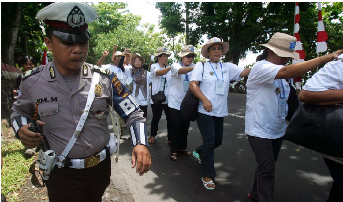
Police escort a group of environmental activists as they shout slogans while protesting against illegal fishing and sea pollution in conjunction with the World Ocean Conference in Manado (Indonesia), May 11, 2009.

Several countries have adopted national legislation for the protection of human rights defenders, translating into domestic law their international obligations set out in the UN Declaration on Human Rights Defenders. While this is certainly a positive step towards giving the rights of human rights defenders legitimacy at the national level, it has to be acknowledged that the degree of effective implementation and practical impact on the situation of human rights defenders varies considerably from one country to another. 39