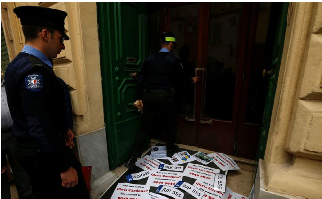
Police officers walk over posters left by civil society activists calling on the police to question Maltese Economy Minister Chris Cardona, after some of the journalists from the Daphne Project initiative reported him as having met with one of the men accused of the murder of anti-corruption journalist Daphne Caruana Galizia, at the police station in Valletta (Malta), April 19, 2018.