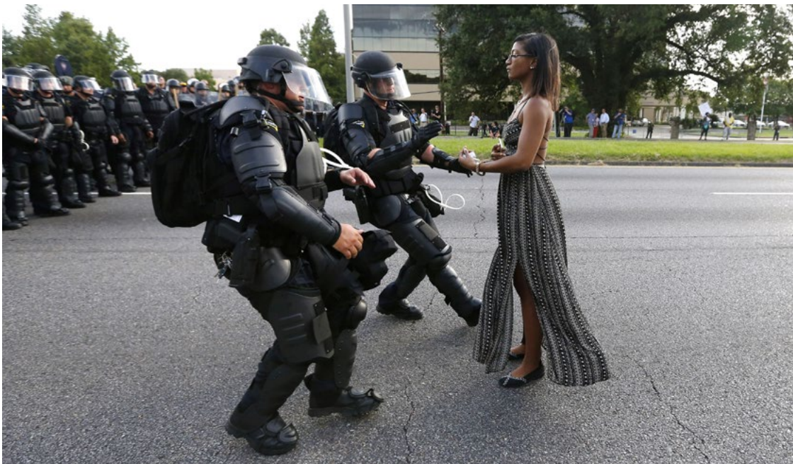
A demonstrator protesting the shooting death of Alton Sterling is detained by law enforcement near the headquarters of the Baton Rouge Police Department in Baton Rouge, Louisiana (USA), July 9, 2016.

When human rights violations at the hands of the police have taken place, human rights defenders often may want to publicly denounce what has happened. In terms of seeking to influence police action, however, it is necessary to consider how such statements will be perceived, not only by the public but also by police. In particular, the way they voice criticism will considerably affect the likelihood of whether or not police will engage in an open discussion about problematic policing approaches or take seriously the criticisms and recommendations put forward.