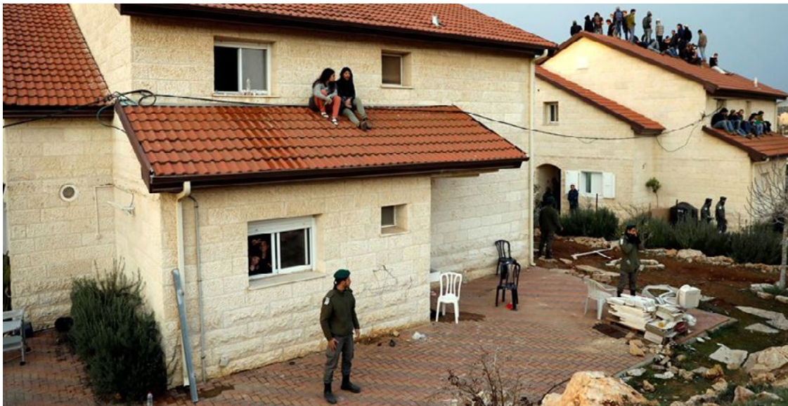
Pro-settlement activists sit on a rooftop of a house to resist evacuation of some houses in the settlement of Ofra in the occupied West Bank (Palestinian Territories), during an operation by Israeli forces to evict the houses, February 28, 2017.

Very often the law uses the wording “law enforcement officials may” rather than “must”. Such “may”-formulations present opportunities to discuss with police how they exercise their discretion, and to suggest a decision-making process shaped by human rights considerations. In the context of assemblies that are considered unlawful under domestic law, for example, the law might specify that the assembly can be dispersed, but not that it must be. Considering that the primary task of the police is to maintain peace and order, human rights defenders could present the case that dispersing an unlawful yet peaceful assembly that does not affect public order is likely to be counterproductive: Police will create disorder instead of maintaining public order and therefore should refrain from dispersing a peaceful assembly. This is today a recognised standard and considered good policing practice. 29