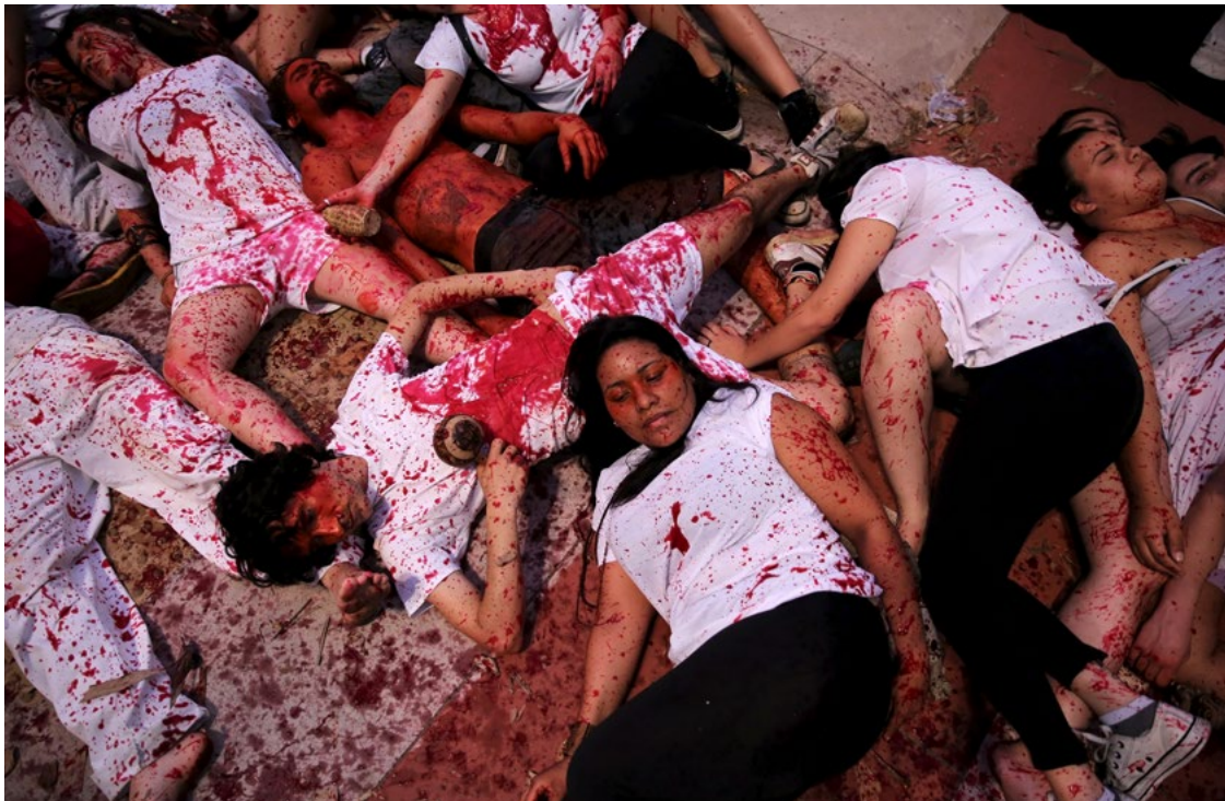
Activists covered in fake blood perform during a protest against the death of Semiao Vilhalva, a leader of the Guarani Kaiowa tribe, in Sao Paulo September 17, 2015. The organisers of the protest said Vilhalva was shot dead on August 29 during a confrontation with men trying to expel tribe members from land the tribe had earlier occupied in the municipality of Antonio Joao, Mato Grosso do Sul state. Police are investigating the case.

Police are however not the only actors posing risks to human rights defenders. Depending on the topics they are working on and whose interests they are opposing, human rights defenders may become subject to threats or attacks by a range of non-state actors. Those denouncing impunity and violations committed by armed groups, for example, may be subjected to threats and harassment by those groups, while private corporations may obstruct the activities of defenders working on labour rights or on the exploitation of natural resources. Defenders working on domestic violence may receive threats from the perpetrators or family members. There have also been instances in which community leaders and faith-based groups have resorted to attacks against defenders working on LGBTI issues or on violence against women. 38