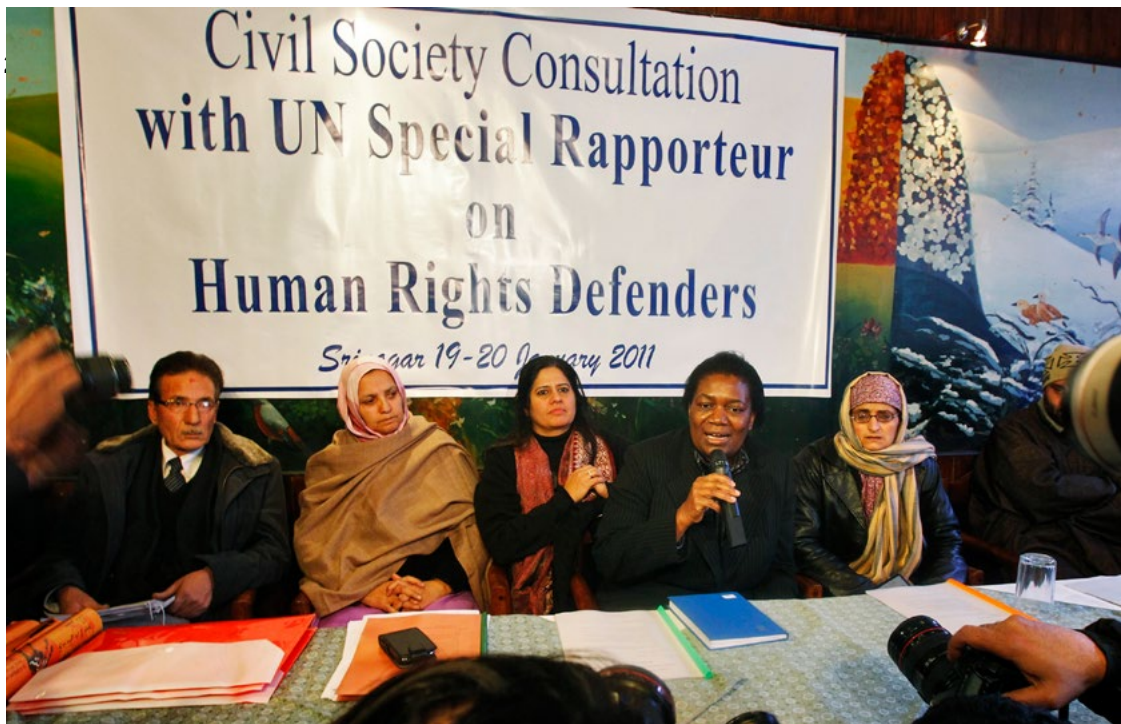
Uganda's Margaret Sekaggya (4th L), United Nations Special Rapporteur on Human Rights Defenders, speaks during a meeting with members of civil societies in Srinagar (India), January 19, 2011.