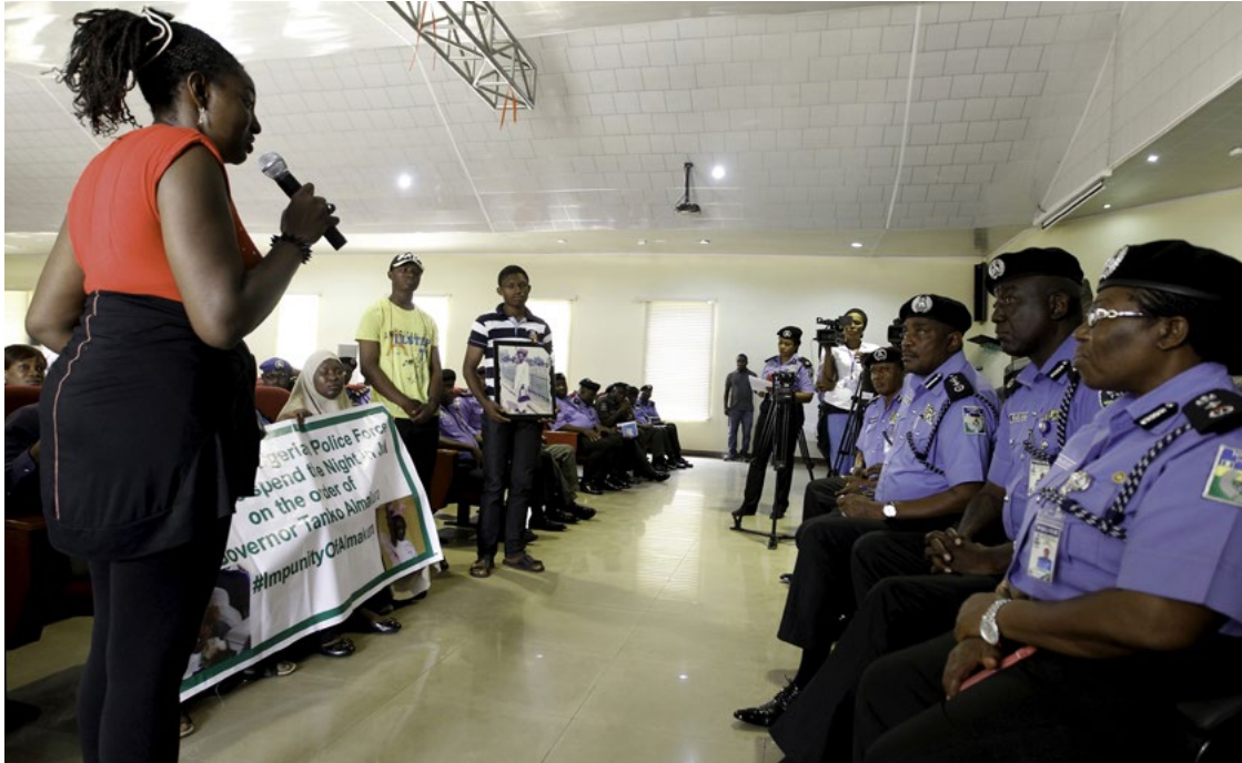
A member of a citizens' initiative against violence speaks about cases of killings by police, as they call on Nigeria's Inspector-General of Police Solomon Arase to address excessive use of force by the police, in Abuja (Nigeria), September 18, 2015.

high rank in the ranking structure), leaving that officer with little or no influence within the law enforcement agency. Such officers may nevertheless be useful interlocutors in order to learn how police training is done and to what extent and how human rights issues are included in the curriculum.