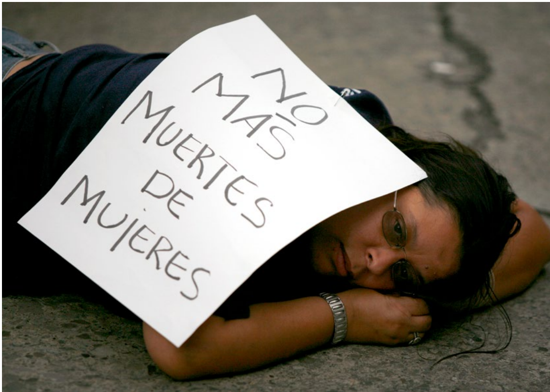
A protester takes part in a demonstration aimed at calling attention to the high murder rate of Guatemalan Women outside the International Olympic Committee's (IOC) 119th session in Guatemala City July 3, 2007. The sign reads 'No more killing of women'.