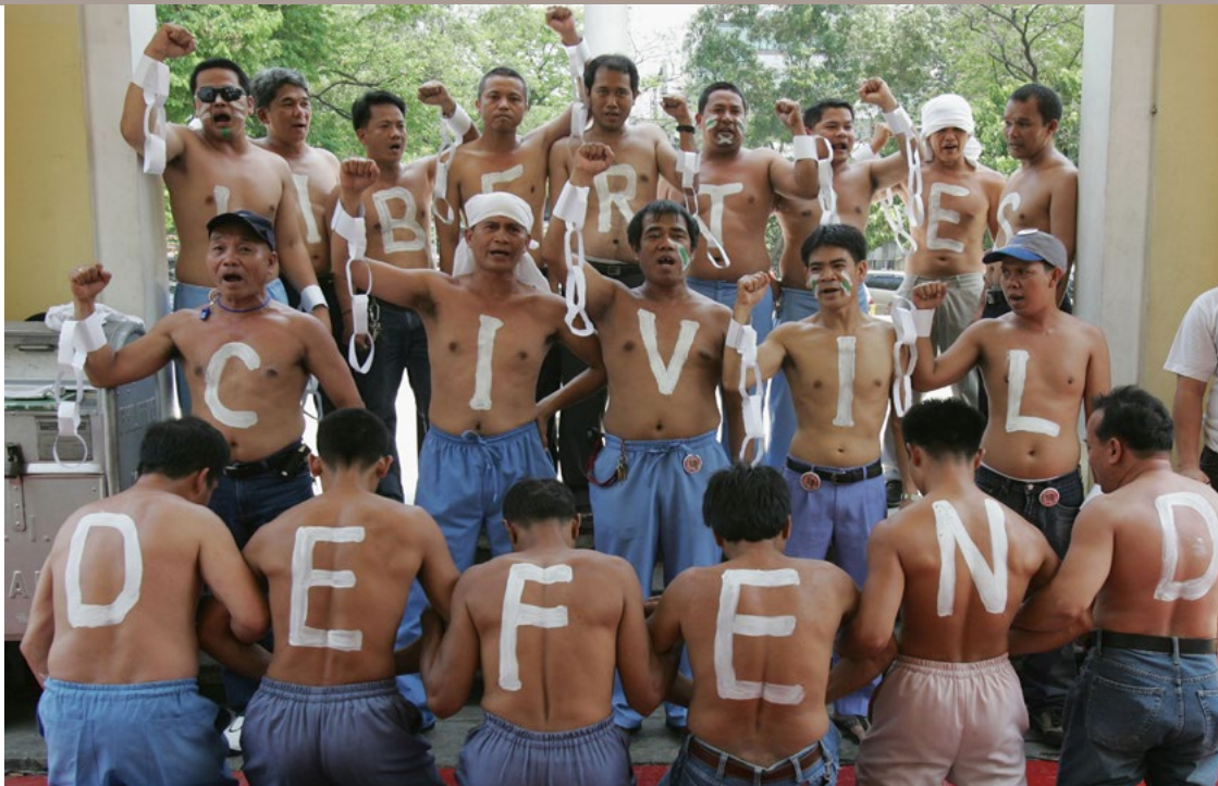
Health workers display their painted bodies which read 'Defend Civil Liberties' while shouting anti-government slogans during a protest in front of the Philippine General Hospital (PGH) in Manila March 28, 2006.

The term human rights defender refers to anyone working for the promotion and protection of human rights, provided that they do not resort to or advocate hatred, discrimination or violence, deny the universality of human rights (all human rights for all) or take action that seeks to undermine the human rights of others. It includes professional as well as non-professional human rights workers, volunteers, journalists, lawyers and anyone else carrying out, even on an occasional basis, an activity to promote and protect human rights.