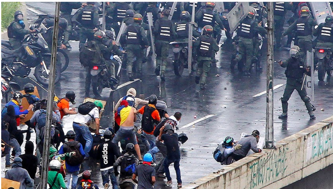
A member of the riot security forces (R) points what appears to be a pistol towards a crowd of demonstrators during a rally against Venezuela's President Nicolas Maduro's government in Caracas (Venezuela), June 19, 2017.

It is thus crucial for human rights defenders to be aware of the risks police pose to them and draw up protection plans to mitigate those risks. This section will outline some basic elements of what to consider in that regard. As mentioned before, however, this paper is not intended to serve as a safety manual for human rights defenders.