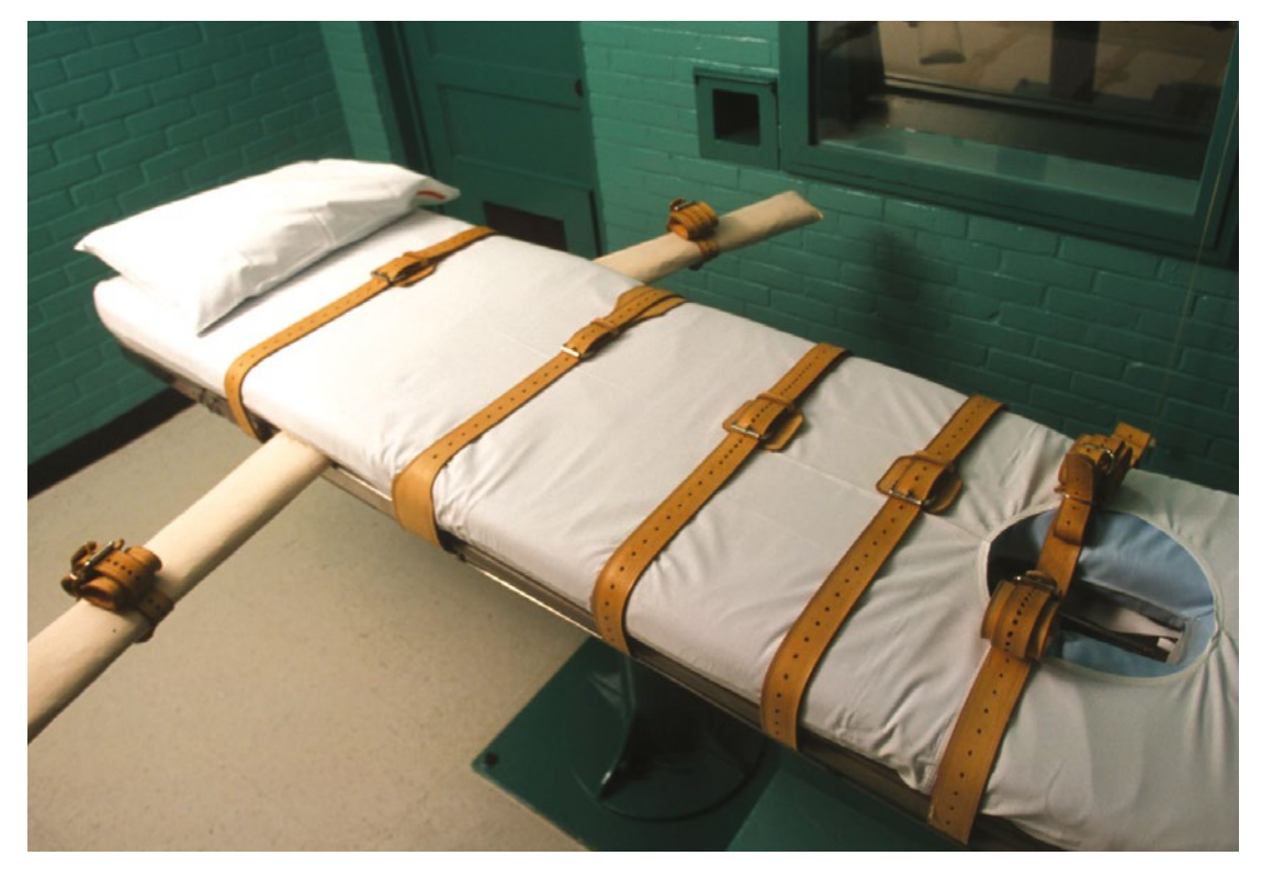
Execution room, Huntsville, Texas, © Getty Images

In China, Guatemala, the Maldives, Papua New Guinea, Taiwan, Thailand, Vietnam, and the United States, the intravenous administration of a lethal dose of certain pharmaceutical chemicals ("lethal injection") is provided for as a method of execution under the law.<sup>28</sup> Amnesty International and the Omega Research Foundation oppose the death penalty in all cases and call for the abolition of the death penalty.