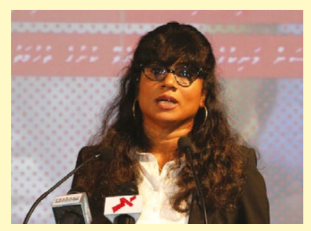
MP Mariya Ahmed Didi

"They... continued beating me with my handcuffs on... They were beating me with batons. Police and military officers then forcefully opened my eyelids. They went for the eye that had been injured [as a result of a police beating] the day before. They sprayed pepper spray directly into my eye. Then they did the same with my other eye. They then sprayed into my nose as they were also beating me. They then took me to a police station