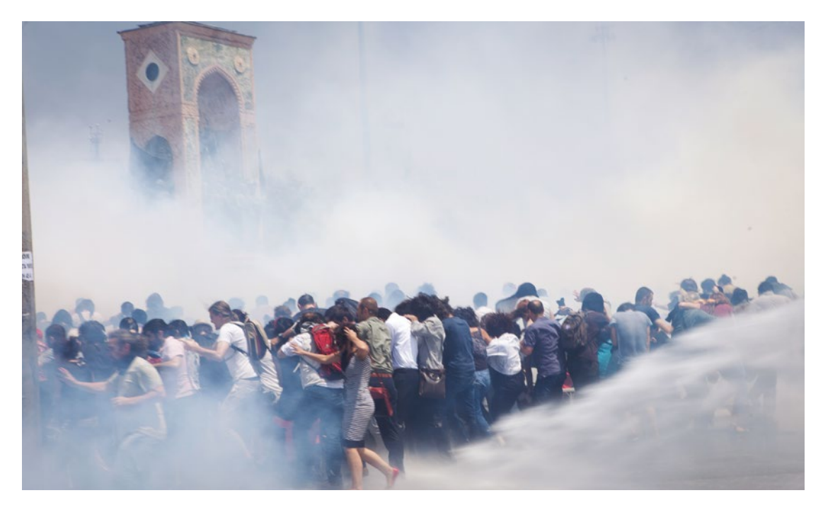
Riot police attack hundreds of protestors on 31 May 2013, Taksim Square, Istanbul

However they can easily be misused, including in prison cells and detention centres, and during large scale policing of public assemblies.<sup>21</sup> When the authorities use RCAs like tear gas in excessive quantities or in confined spaces where people cannot disperse, the toxic properties of the agents can lead to serious injury or death, particularly to vulnerable individuals. In addition, people have died and been injured by being hit directly with RCA projectiles such as tear gas canisters.