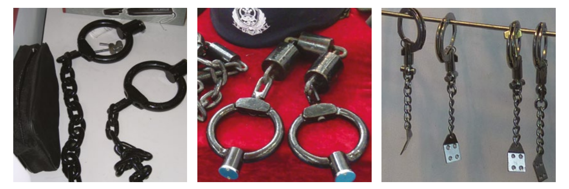
Leg irons, weighted leg irons, and fixed cuffs

Amnesty International and the Omega Research Foundation have documented the development, promotion, transfer or use of inherently abusive or inappropriate mechanical restraints including thumb-cuffs, finger-cuffs, leg irons (some weighing up to 8 kilograms) and fixed restraints. For example, handcuffs designed to be bolted to prison walls have been manufactured and promoted by companies in Asia and Europe.<sup>8</sup>