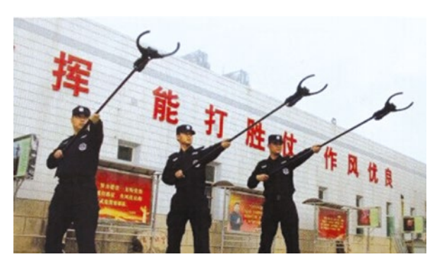
"Shock capturing fork" demonstration, screenshot from Chinese company website.

New products are coming on to the international security equipment market all the time including electric shock gloves, knuckle-dusters and capture devices. In October 2014, a Chinese company announced that it had sold 200 "shock capturing forks" for holding and controlling violent individuals to the Linhe District Public Security Bureau.<sup>15</sup>