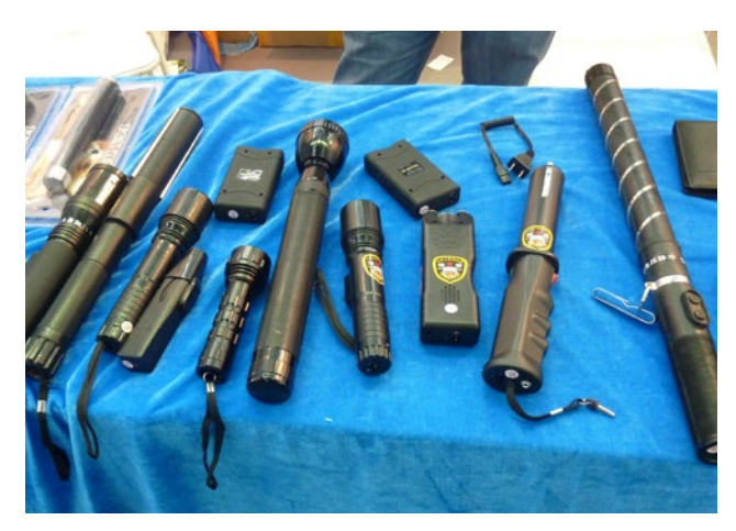
Range of direct contact electric shock weapons on display at an Asian security exhibition, © Robin Ballantyne, Omega Research Foundation

The use of such weapons results in intense, both localised and general pain but not incapacitation of the subject.<sup>10</sup> Potential injuries include burns, puncture wounds and welts, as well as the risk of secondary injuries should the subject fall. Because of their nature and design, direct contact shock weapons carry an unacceptable risk of arbitrary force.