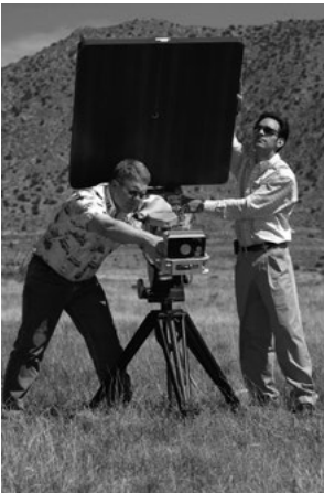
Active Denial System being fine-tuned.

Millimetre wave weapons are another class of directed-energy weapons that are designed to enforce compliance through physical shock, by heating water in the target's skin, causing incapacitating pain. They include the Active Denial System (ADS), developed in the USA.