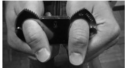
Left: Thumb-cuffs photographed in Taiwan in 2008. Right: Thumb-cuffs in use. Both ©Robin Ballantyne

In accordance with Rule 47(1) of the Mandela Rules , it is prohibited to use chains, irons or other instruments of restraint which are inherently degrading or painful. 97 The term