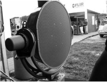
A remotely operated loudhailer on display on the LRAD Corporation stand at a trade show in 2011.

Millimetre wave weapons are another class of directed-energy weapons that are designed to enforce compliance through physical shock, by heating water in the target's skin, causing incapacitating pain. They include the Active Denial System (ADS), developed in the USA.