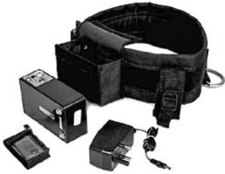
Anti-Scape Stun Belt (Force Group, South Africa). The device comprises a belt (note D-rings for handcuffs), shocking unit and remote control.

Such devices, by combining restraints with electric-shock weapons, are more injurious than other restraints, and potentially in breach of the requirement of Principle 2 of the Basic Principles on Use of Force that “non-lethal incapacitating weapons” should be developed with a view to “increasingly restraining the application of means capable of causing death or injury to persons”. The Committee against Torture 109 and the European Committee for the Prevention of Torture, 110 among others, have stated that such devices are unacceptable. All stun belts and other electric-shock stun devices designed for attachment to the body of a prisoner or detainee should be prohibited for manufacture, transfer and use. 111 (See also Chapter 3.13.1 on other electric-shock weapons.)