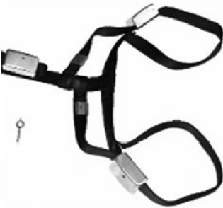
Left: Fabric leg-cuffs.

Amnesty International therefore considers that law enforcement agencies should ensure that only specially designed plastic restraints are used, and are authorized for use. Furthermore, law enforcement agencies should set standards for the minimum width of plastic cuffs based on independent medical evidence, 104 and all officers using plastic restraints should carry a means to immediately remove them if necessary to prevent injury or pain. Following arrest, wherever possible, and at the earliest opportunity, officers should replace plastic cuffs with alternatives less prone to cause injury, if there is a continued need for restraint. Fabric restraint systems, appropriately tested and selected in line with human rights standards, could provide a more humane yet effective alternative to the use of “metal on skin” devices.