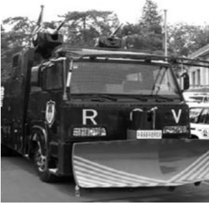
Riot control vehicle water cannon on outside display stand at China Police 2006 Exhibition, Beijing.

The use of a mixture of water and chemicals makes it impossible to deliver accurate targeted doses of the irritant. Therefore, an independent body of scientific, legal and other experts should examine the inherent effects and the proper use of water cannon, and agree rules for the legitimate and safe use of each type of device that are consistent with international human rights law and standards.