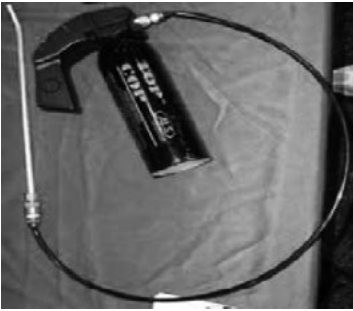
ALS Technologies' "Top Cop" tear gas sprayer.