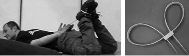
Left: Plastic disposable restraints demonstrated at IWA 2010 (International Waffen Ausstellung trade fair 2010). Right: Plastic disposable restraints.

to use, equipment such as plastic cable ties not originally designed or intended for use on humans. 103