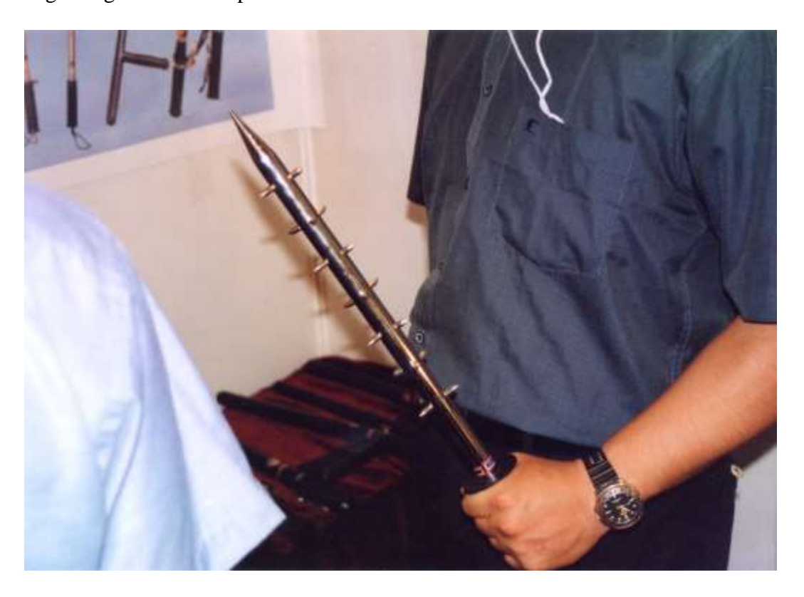
Spiked Chinese steel police baton, on display at China Police exhibition, June 2002. Amnesty International does not believe that such a piece of equipment could have a legitimate policing function.

Batons, and variations on them - sticks, canes, lathis (a long wooden pole carried by all police officers in India) - are the most commonly used police weapon worldwide. They are cheap, easily manufactured locally, and are generally issued to all officers, including those who would not normally carry a firearm or any other weapon. They are widely misused: in cases of excessive use of force; deaths in custody; torture, and other cruel, inhuman or degrading treatment or punishment.