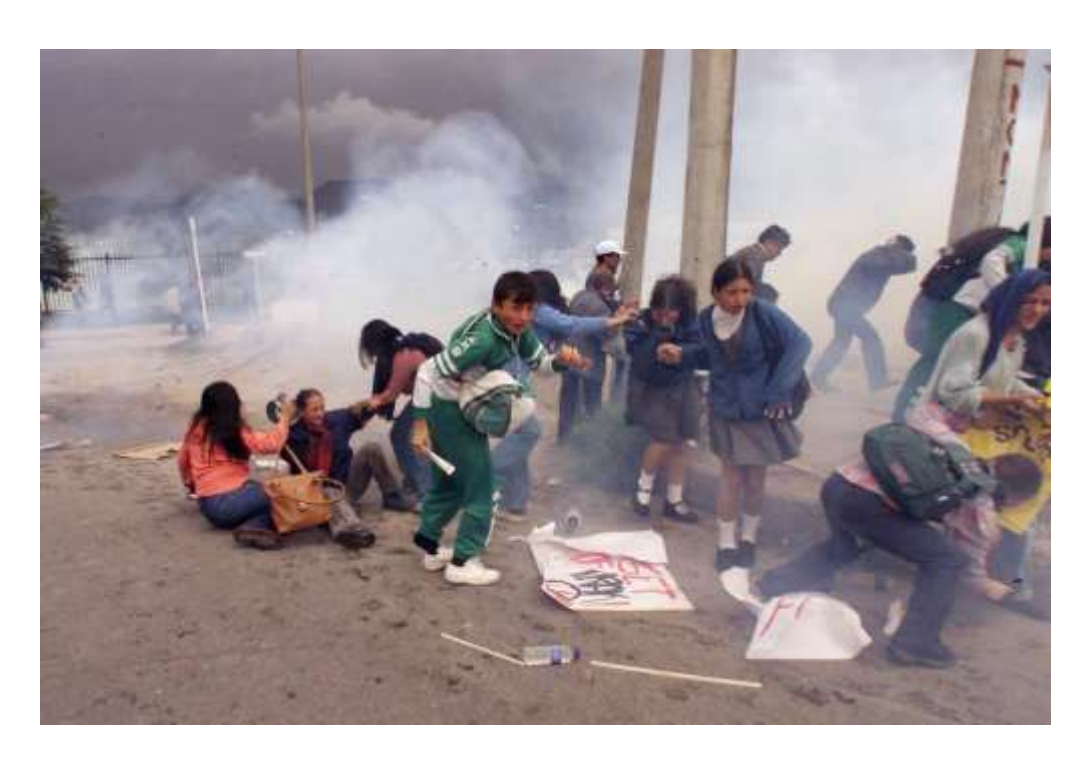
Students run from tear gas fired by police into a crowd of some 1,500 demonstrators who tried to march to the US Embassy to protest against the war in Iraq, Thursday 27 March 2003, Bogotá, Colombia.

Amnesty International has documented the firing of tear gas at demonstrators, many of them non-violent, in more than 70 countries in the last five years.