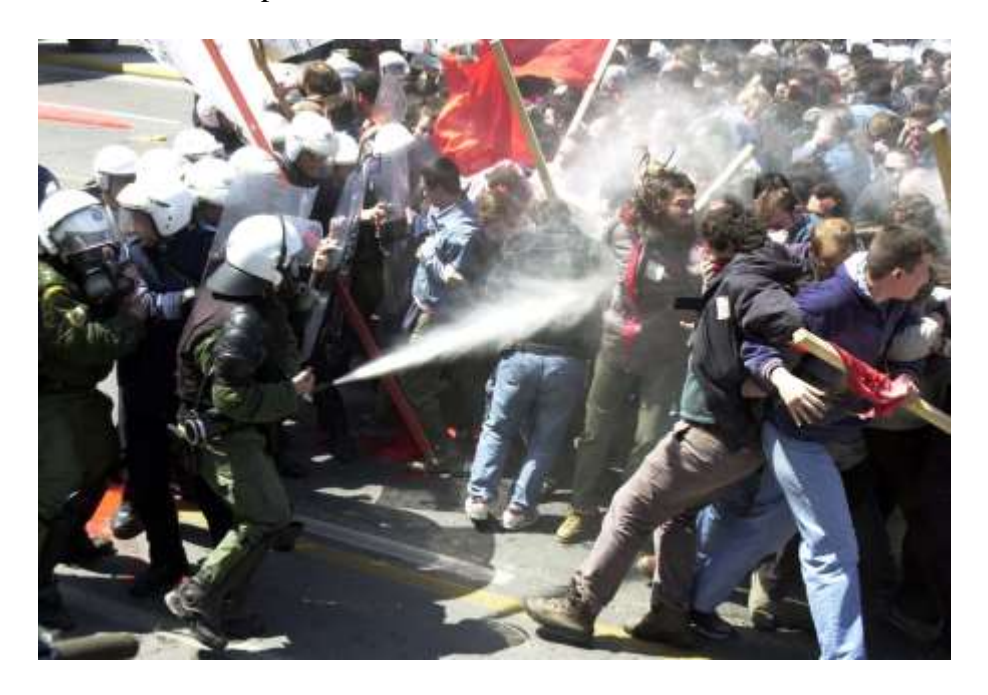
Greek riot police fire pepper spray into the faces of demonstrators during an antiwar demonstration outside the Greek Parliament in Athens on 16 April 2003.

In many parts of the world, police forces use pepper spray for crowd control purposes. On 16 April 2003, Greek police fired pepper spray into the faces of anti-war protestors in Athens.