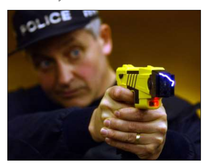
A British police marksman demonstrates the newly acquired US-made M26 Taser in Northhampton, UK. It was announced in April 2003 that five police forces in the UK would undertake a year-long operational trial of the taser.