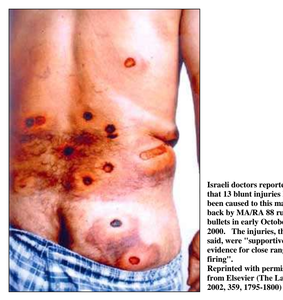
Israeli doctors reported that 13 blunt injuries had been caused to this man's back by MA/RA 88 rubber bullets in early October 2000. The injuries, they said, were "supportive evidence for close range of firing".

MA/RA 88, composed of "15 rubber balls with a metal core, each weighing 17g...When fired, the bullets form a circle with a diameter of 7m at a range of 50m".