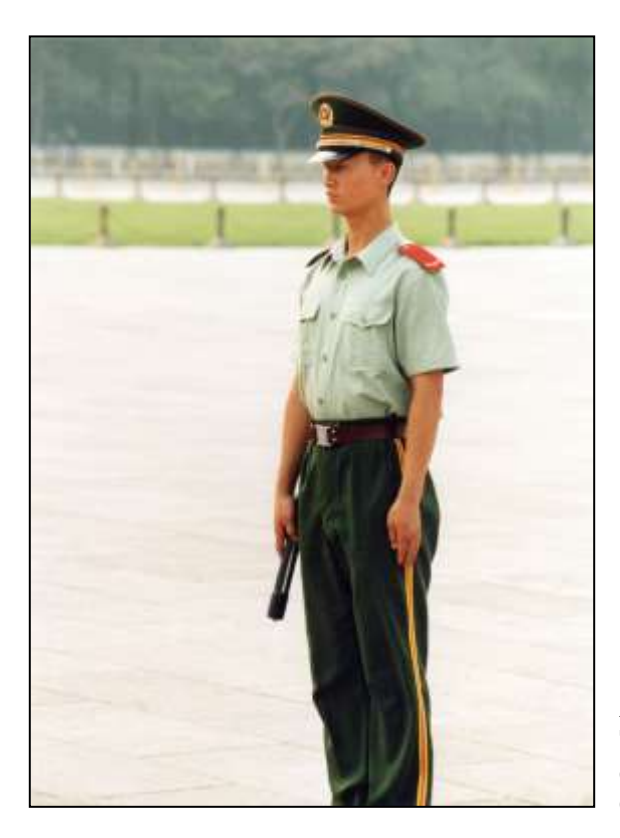
A Chinese police officer on duty in Tiananmen Square with an electroshock baton, June 2002.

To Amnesty International's knowledge, there are no export controls on electro-shock stun weaponry in China, one of the world's largest manufacturers and where stun batons are often used in law enforcement. In January 1998 it was reported that the North Korean police ordered thousands of electric batons, tear-gas guns and riot shields from China.<sup>81</sup>