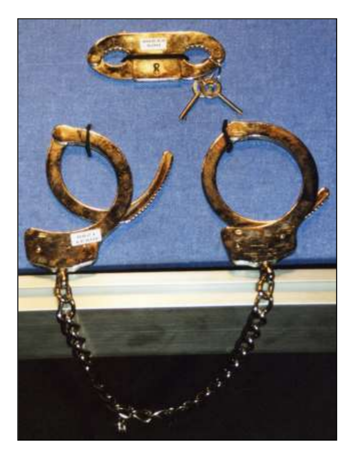
Spanish leg cuffs and thumbcuffs on display at the IWA Exhibition, Nürnberg, Germany, 2002.