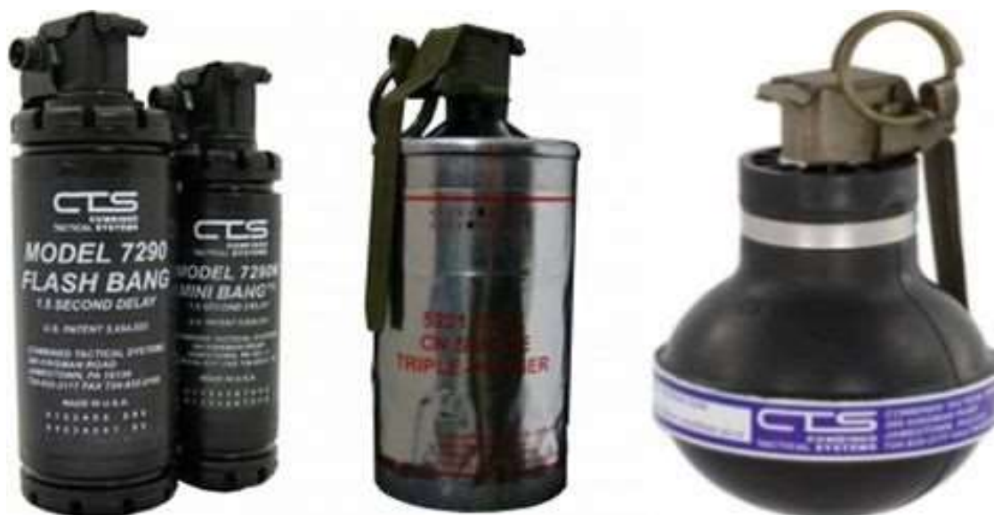
Law enforcement equipment promoted on Combined Systems Inc.'s website 202

Paraguay: Seguridad, Inteligencia y Tecnología del Paraguay SA (SIT) distributes law enforcement equipment manufactured outside Paraguay and also provides private security services. SIT has sold a wide range of equipment to public agencies, including Defense Technology (US) chemical irritant hand grenades to the Ministry of the Interior, 203 Glock (Austria) pistols to the National Anti-Drug Service (SENAD), and Monadnock restraints (US) 204 and ATK (US) ammunition to the National Police. 205