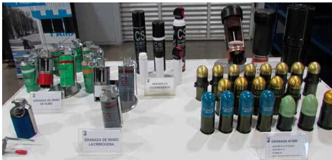
Display of FAMA E equipment, including CS grenades and aerosol sprays. Memoria FAMA E 2013, p. 25