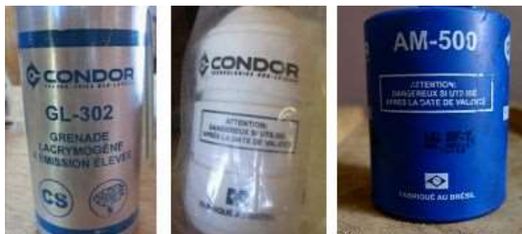
Various types of 37/38-mm and 40-mm ammunition manufactured by Condor in August 2012 and found in Côte d'Ivoire in 2013. Mid-term Report of the Group of Experts on Cote d'Ivoire presented to the UN Security Council, S/2013/605, 14 October 2013, Annex 4.

In August 2013, the EU Foreign Affairs Council announced that Member States had agreed to 'suspend export licenses to Egypt of any equipment which might be used for internal repression'. 180 This was due to the disproportionate actions of the Egyptian security forces which resulted in 'an unacceptable large number of deaths and injuries'. Although not binding on non-EU states, this suspension sent a very strong signal to other exporting states. However Brazil did not apply similar criteria to exports of equipment that could be used for internal repression - exports by Condor to Egypt totalled USD 18,084 in 2015 and USD 1,835,485 in 2014. 181