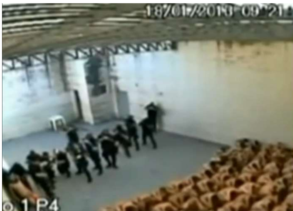
Screen shot of closed circuit video footage 113

Brazil: Closed circuit footage of a 2013 incident at the Joinville Regional Prison in Santa Catarina State received widespread media attention. 112 The footage shows officials, reportedly from the Department of Prison Administration, forcing a group of male detainees stripped down to their underwear to line up in tightly-packed rows, crouch down with their hands on their heads and face the wall. Behind the prisoners, a group of approximately 12 armed officials use kinetic impact projectiles and tear gas on the detainees, as well as spraying what appears to be a chemical irritant directly into their eyes. This behaviour is a clear violation of the UN CAT and the Inter-American Convention to Prevent and Punish Torture.