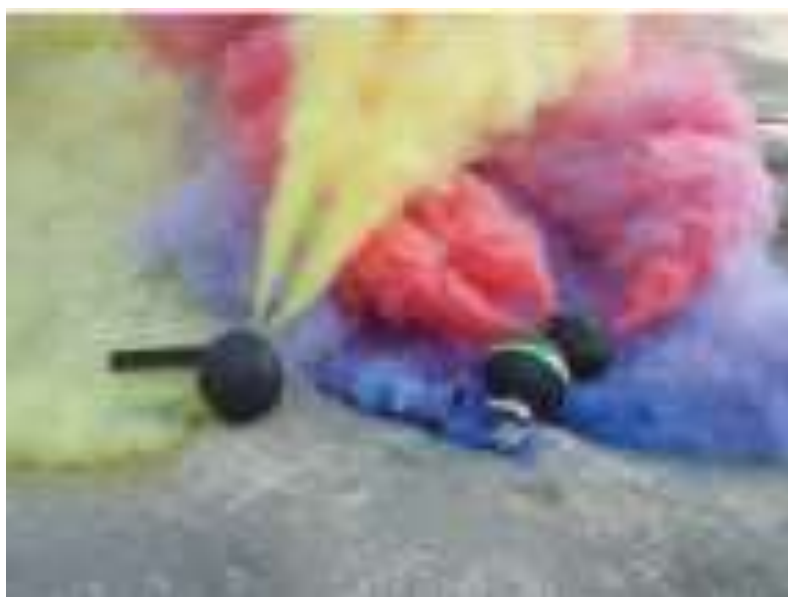
Picture of coloured smoke grenades.

riot control equipment, gas masks, dyes, 'propellant cartridges', handcuffs and raw materials and components for the production of tear gas devices. These licenses remain suspended and no further authorisations have been granted ' for the export of products which could be used in internal repression '. 239 However, information on the licensed production agreement between Falken and CAVIM on the CAVIM website makes no reference to this suspension and it is not clear if the licensed production of tear gas has been affected in any way. While the Spanish authorities suspended licenses for the export of raw materials and components for the production of tear gas devices in 2014, it is possible that CAVIM continues to use Falken S.A. technology. Unless adequately controlled, licensed production agreements could be used to evade export controls, even when the awarding of licenses to the destination country has been suspended.