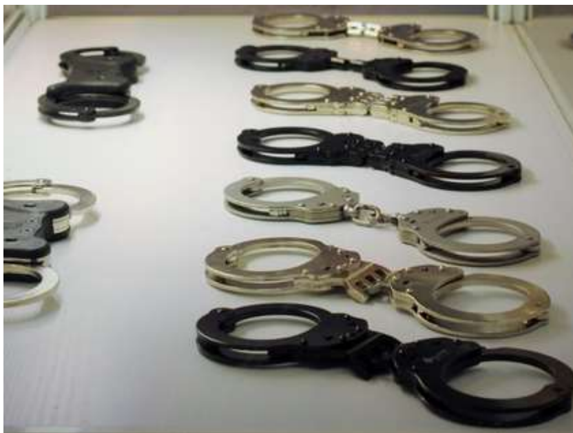
Handcuffs displayed Milipol 2015, Paris, France.

Common handcuffs consist of two adjustable wrist cuffs joined together by a short chain that allows a limited degree of movement. Other types include hinged and rigid handcuffs (i.e. those that are joined by a rigid bar, rather than a chain). Handcuffs can be double-locking, designed to prevent overtightening, and single locking, which can be progressively tightened through a ratchet (by both the law enforcement officer and the detainee). Although all handcuffs can be abused for torture and other ill-treatment, rigid and single locking handcuffs pose a greater risk of injury and abuse than others. There are reports of handcuffs being abused in places of detention in Argentina, Brazil, 97 Paraguay, Uruguay and Venezuela. However, the abuse of restraints often goes unreported.