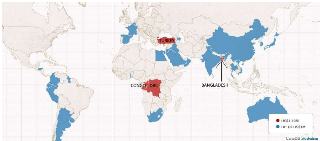
Map: Condor Non-Lethal Technologies Exports in 2015 188

of serious injuries suffered by protesters who were directly struck by tear gas canisters at close range. 187 Reports do not state which companies' products caused these injuries.