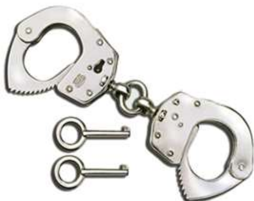
Thumb cuffs promoted on Algemas Zorro website. 166