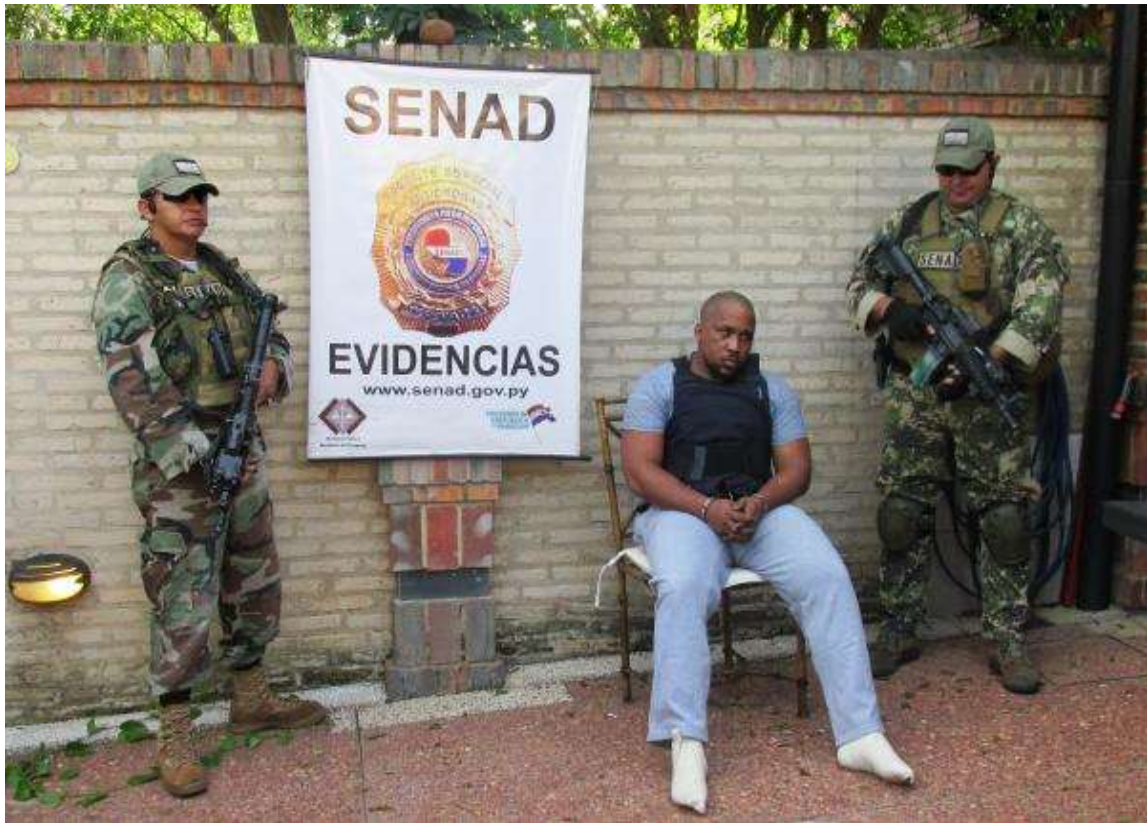
Detainee being guarded by officials from the Paraguayan National Anti-Drug Ministry. 34