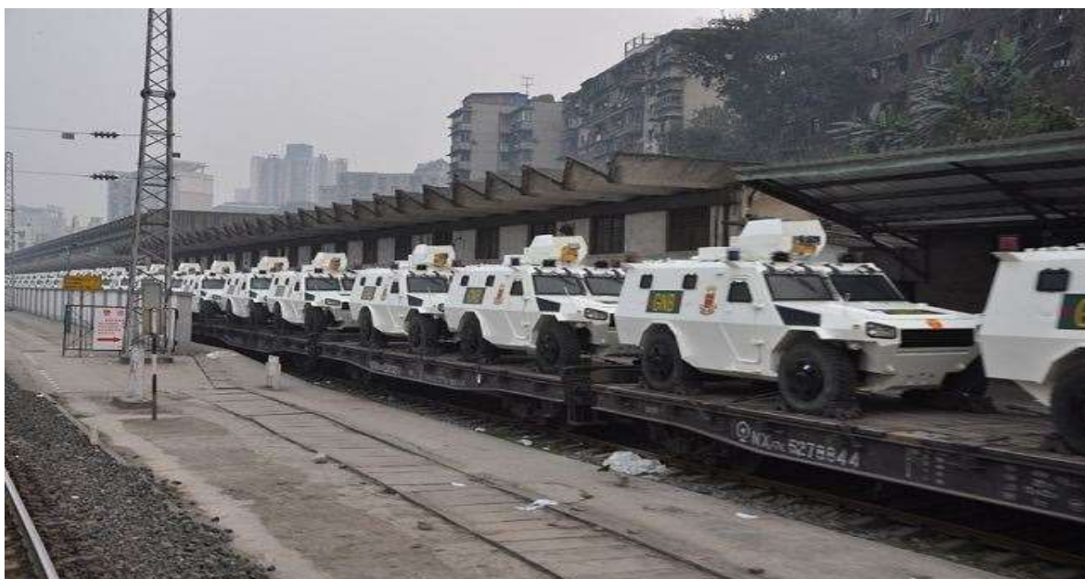
Photo from an unknown source of Norinco VN4 armoured vehicles with the Venezuela National Guard insignia allegedly taken in China. 215

In addition to the examples of transfers mentioned above, some Spanish manufacturers of law enforcement equipment have taken advantage of close ties between Spain and many South American countries to forge trading links. Spain publishes annual statistics showing the number of licenses awarded and the amount of money received for the export of riot control equipment from Spain. Although these statistics would be more transparent if they included the names of individual companies and a detailed description of the products being exported, they provide an overall picture of where Spanish companies are exporting law enforcement equipment to. Such trade data facilitates increased accountability for exports.