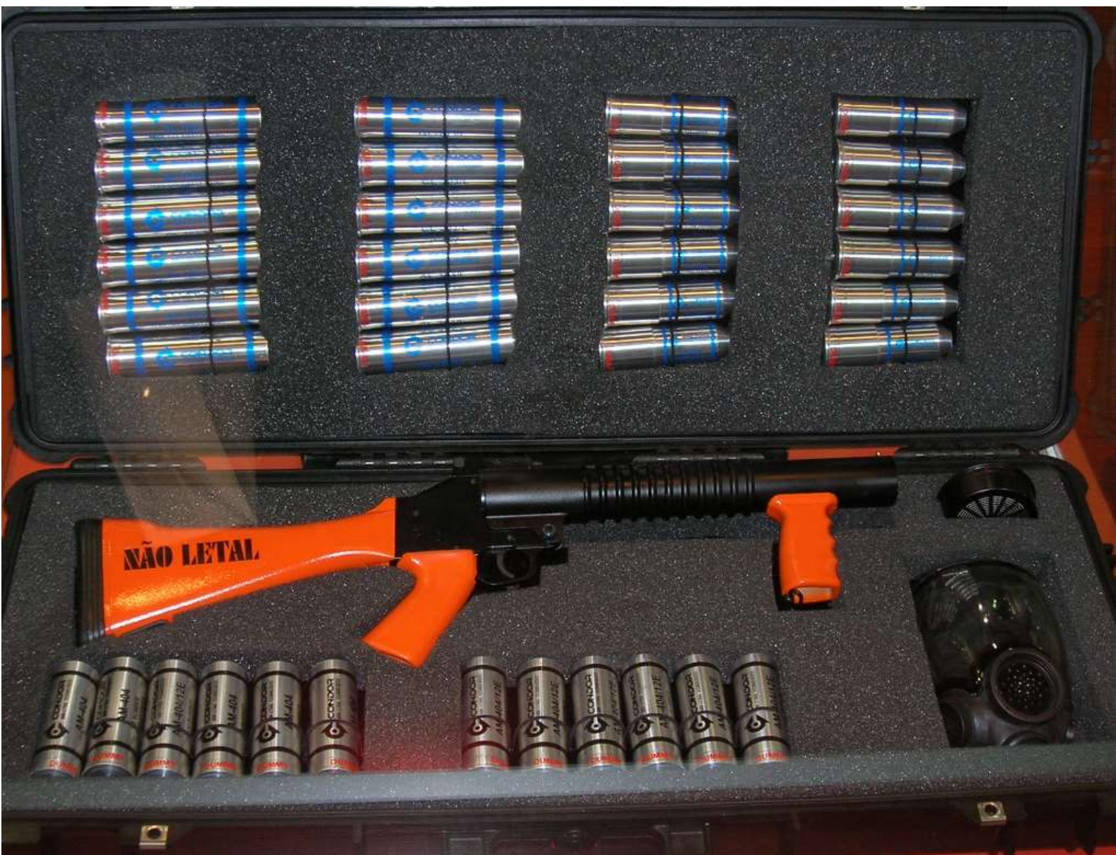
Law enforcement equipment on display at the Condor Non-Lethal Technologies stand at the LAAD Defense & Security Exhibition 2007, Rio de Janeiro, Brazil, April 2007.