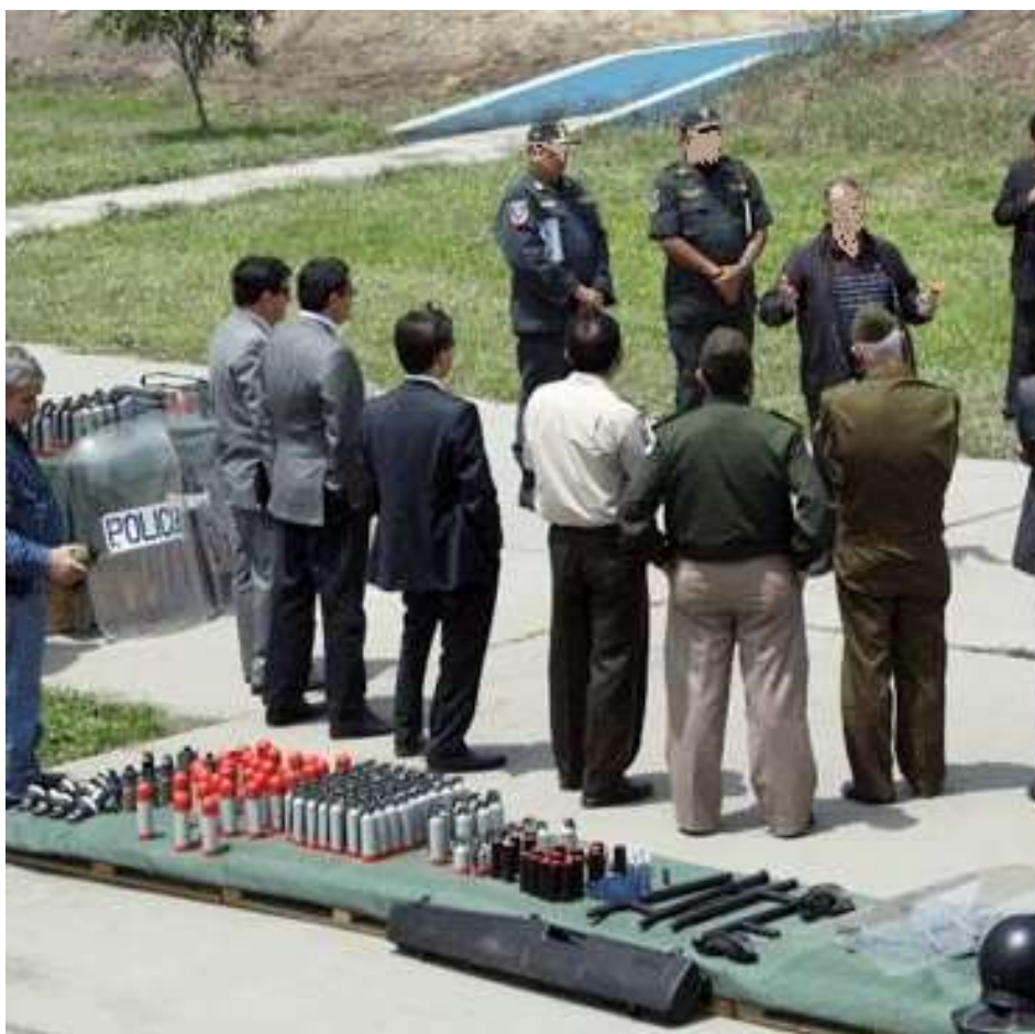
Photo taken at an exhibition and demonstration hosted by FAME SAC (Peru) and attended by representatives from the police forces of Argentina, Bolivia, Chile, Ecuador and Panama 248

The examples discussed above examine the Spanish Government's obligation to prevent companies based in its jurisdiction from contributing to human rights violations abroad. South American companies also have such obligations and further research of the licensed production agreements involving South American companies would be useful, for example, with regard to the production of weapon parts which are produced in South America and then exported to companies based elsewhere.