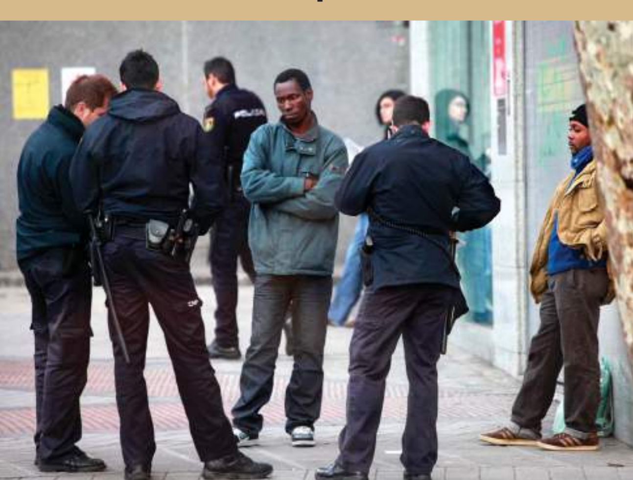
A Handbook of Good Practices